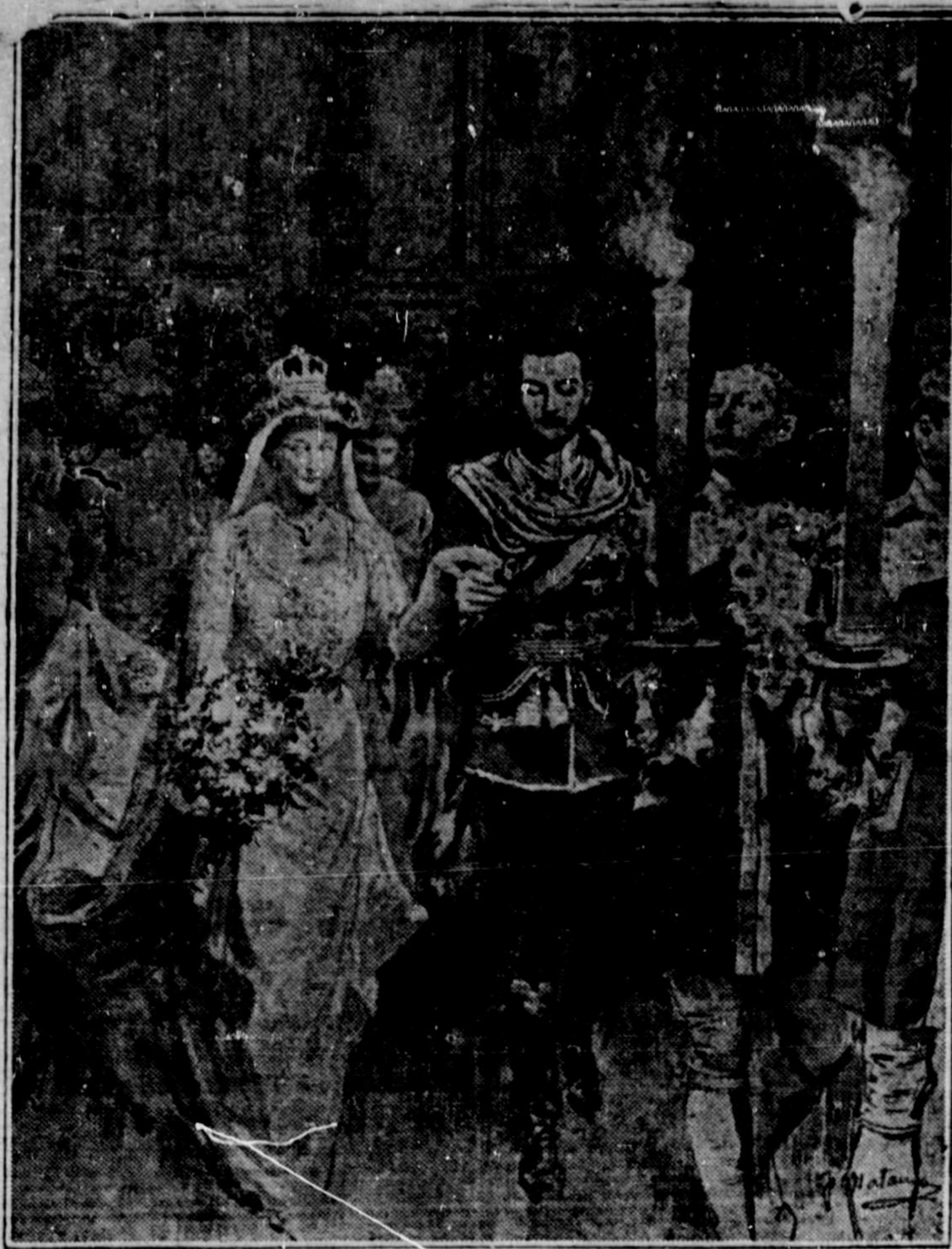
PENCIL SKETCH OF GUELPH-HOHENZOLLERN WEDDING. (Drawn by One of the Guests at the Ceremony.)

If he doesn't talk shop he prob- ably has not shop to talk.