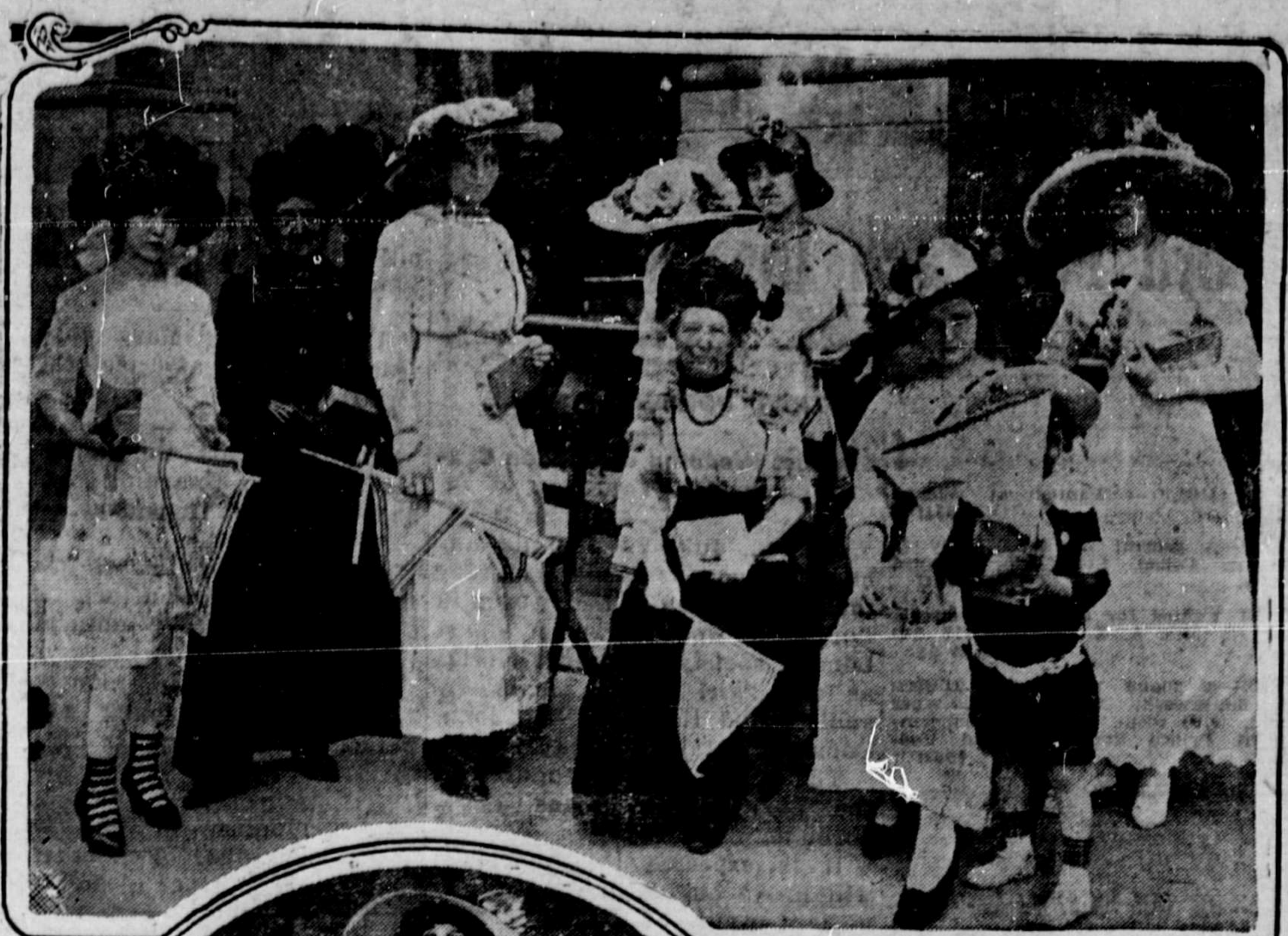
RAISING MONEY TO EDUCATE ONTARIO

Take notice that Margaret B. Grant, of Prince Rupert, B. C., occupation dressmaker, intends to apply for permission to purchase the following described lands: Commencing at a post planted at the northeast corner of Lot 694, Coast District, Range 5, thence east 20 chains, thence south 20 chains, thence west 20 chains, thence north 20 chains to place of commencement and containing 40 acres more or less.