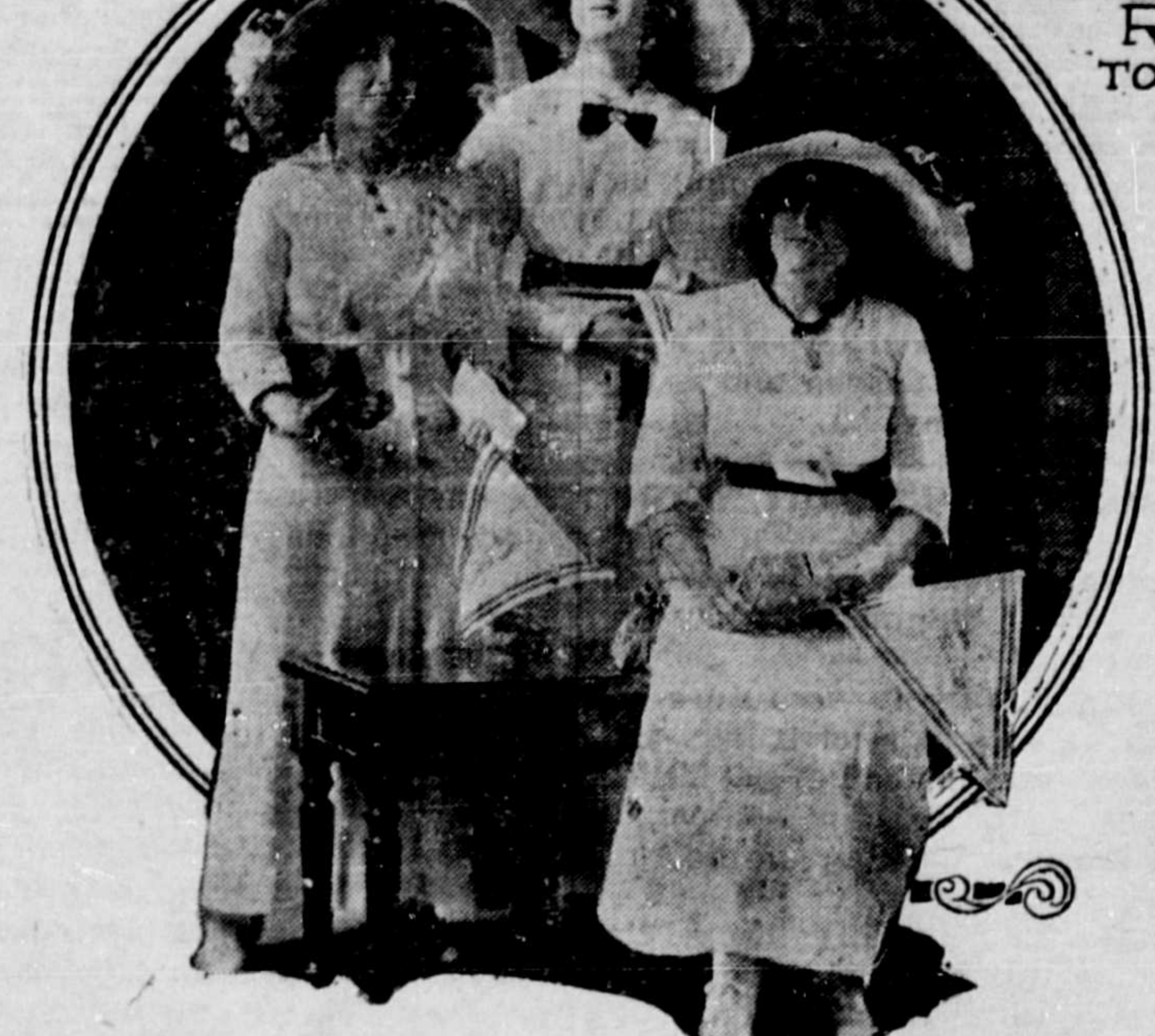
ONTARIO BOYS WILL BE GLAD TO HAVE THE SYMPATHY OF THESE YOUNG LADIES.