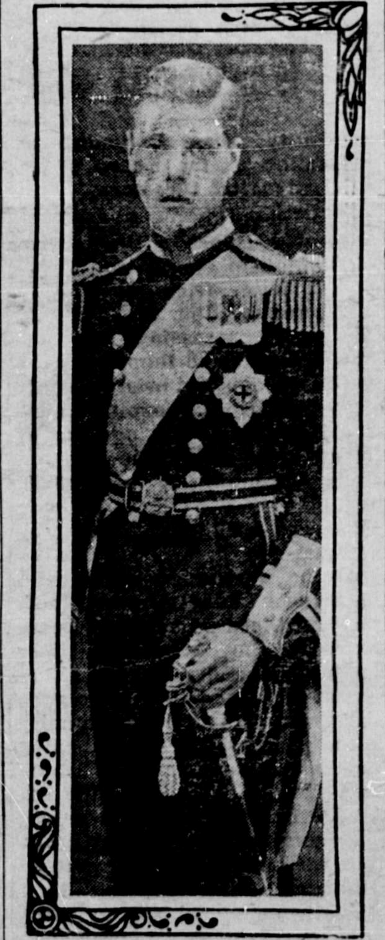
THE PRINCE OF WALES IN UNIFORM.

And here will be exemplified the truth that indeed the border between the motherland's great dependency and the American States does not need fortifica- tions and garrisons to keep the people at peace by showing a preparedness for war.