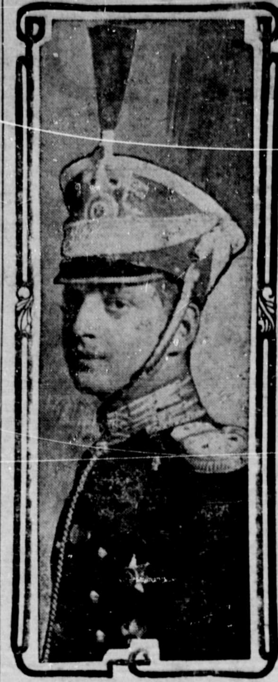
GRAND DUKE DMITRI.

The most recent photograph of the Prince of Wales in the uni- form in which he represented his father, King George, at Portsmouth last week and re- ceived M. Raymond Poincare, the French president.