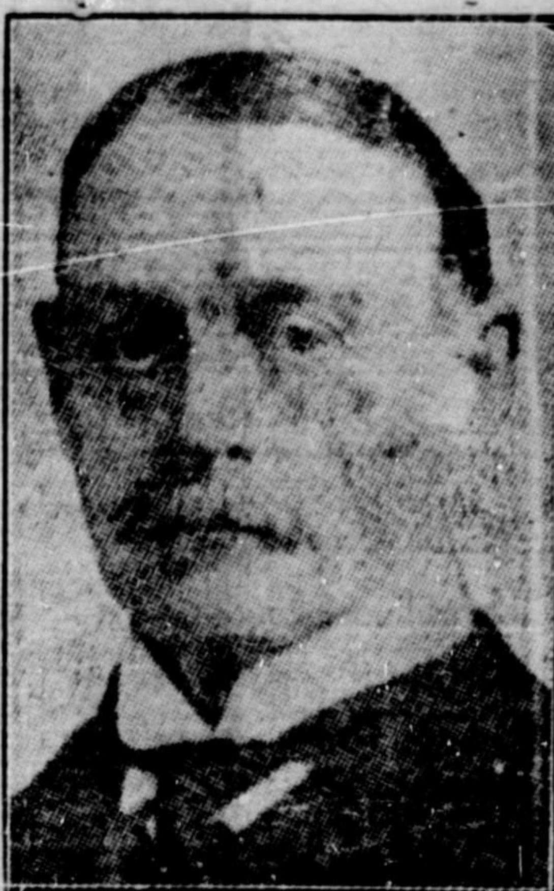
SIR ARCHIBALD HUNTER.

The governor of Gibraltar, who has been relieved of that important post on account of a tactless speech that he made recently.