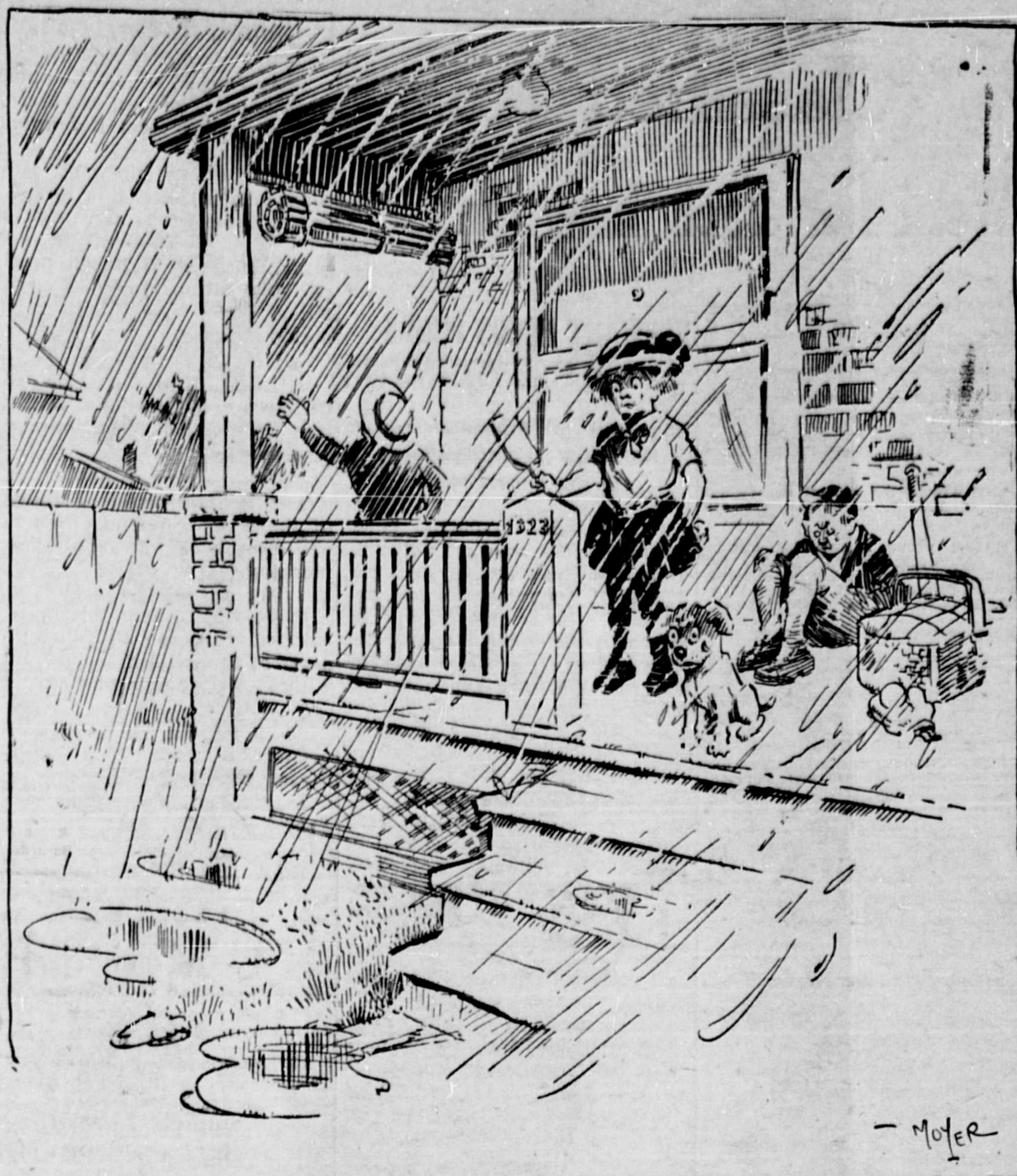
When Picnic Day arrives in Vancouver—All Ready for those Golden Sands