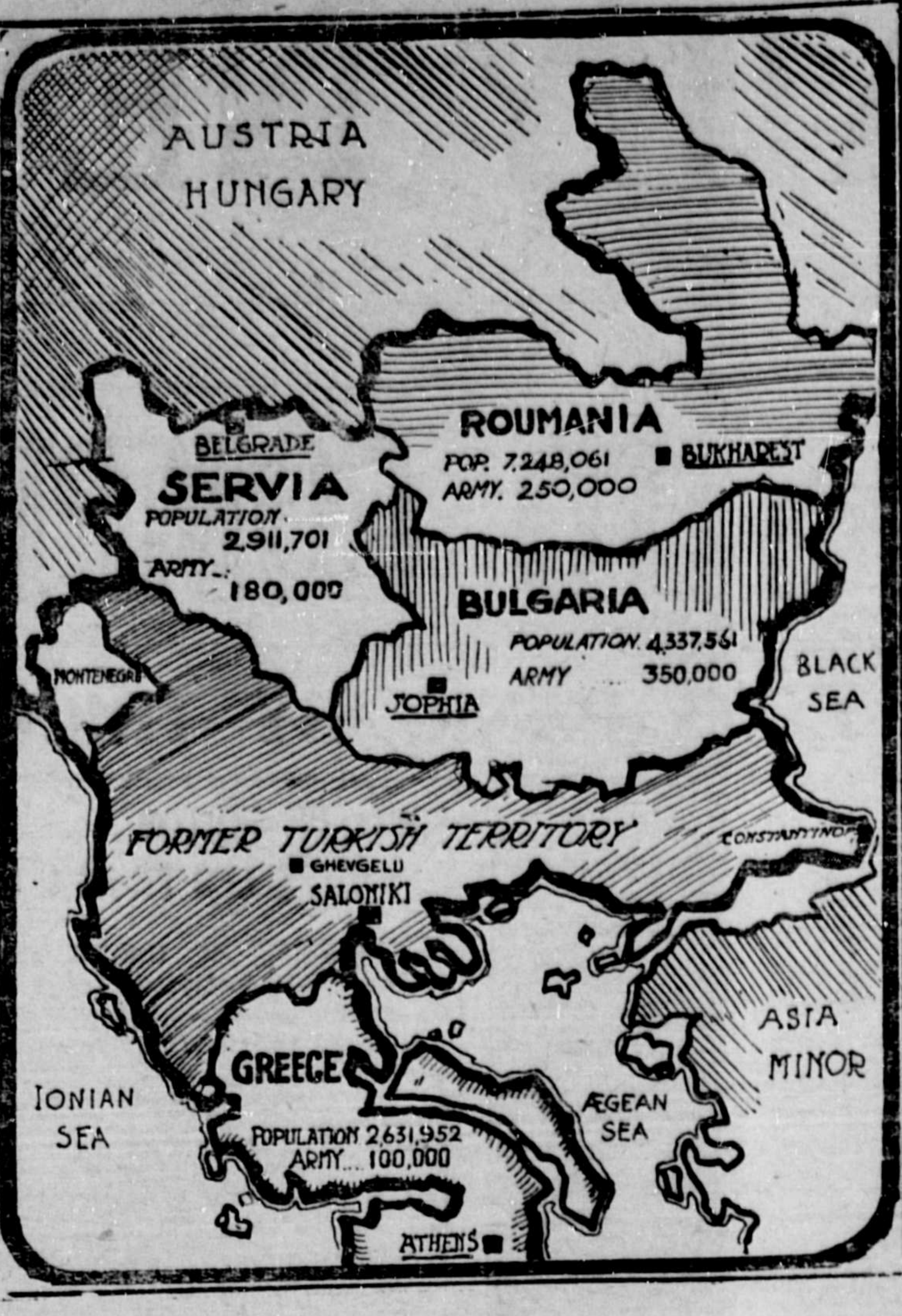
SCENE OF DESPERATE FIGHTING IN THE BALKANS The war footing and the population.—The authorities differ as to the relative strength of the Balkan armies. The figures above are taken from the London Daily Mail year book, and probably underestimate the facts. It is safe to say that a million men are under arms.

The Financial Post computes that $56,000,000 will be distributed this month, most of it in the first week, in dividends and interest on Canadian securities. Something over $31,000,000 of this sum is due on Canadian securities listed at home, $10,000,000 on railway stocks and bonds listed in London, and $7,000,000 on municipal bonds.