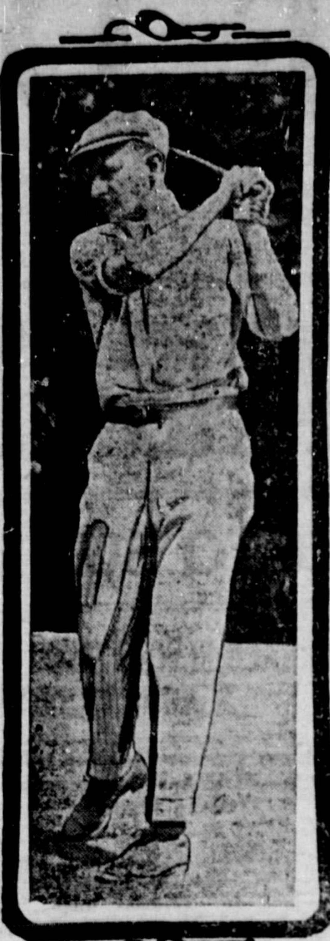
CANADA'S CHAMPION GOLFER.

Launch Alice B for hire. Telephone Green 394, Davis' Float. 155-1f