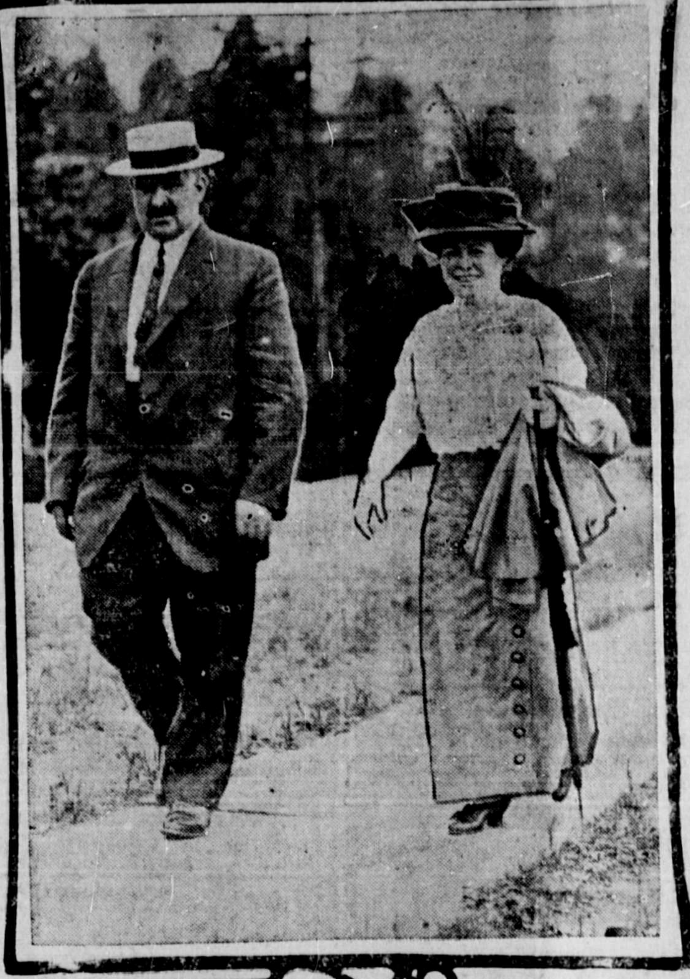
ON A VISIT TO HER CONDEMNED HUSBAND.