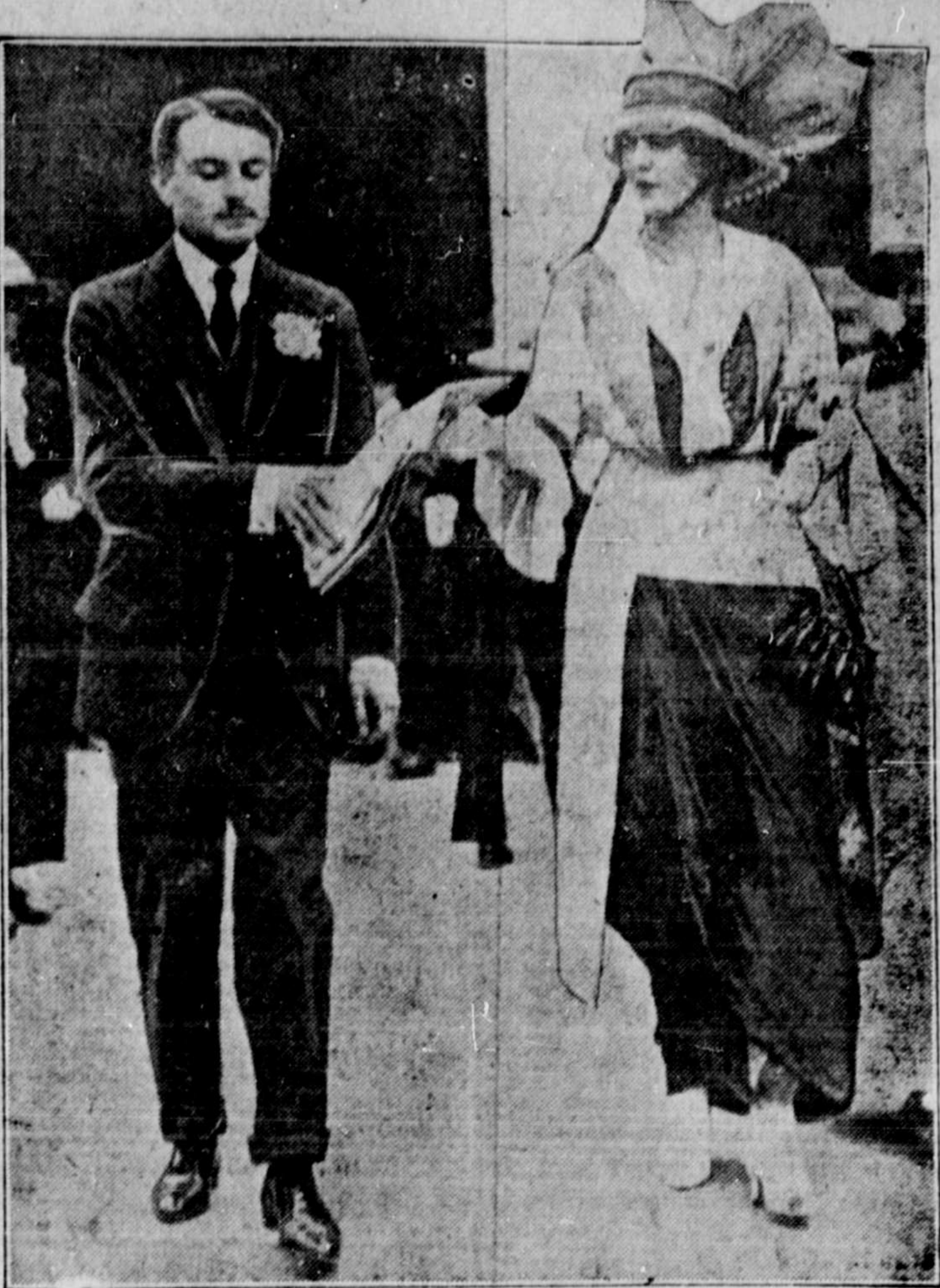
PRINCE PAUL OF SERVIA AND LADY CURZON

Water Act. Notice of Application for the Approval of Works, and for Approval of Under-takings by Minister of Lands.