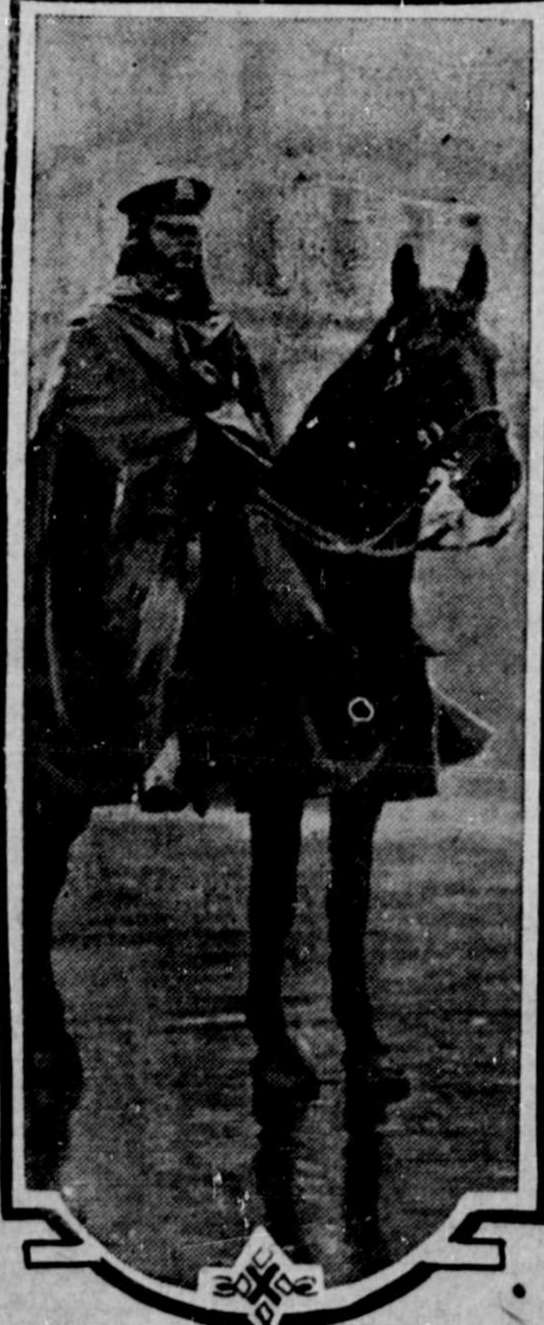
IN COMMAND AT NANAIMO

Demer's are showing the first shipment of Fall coats. 201-1f