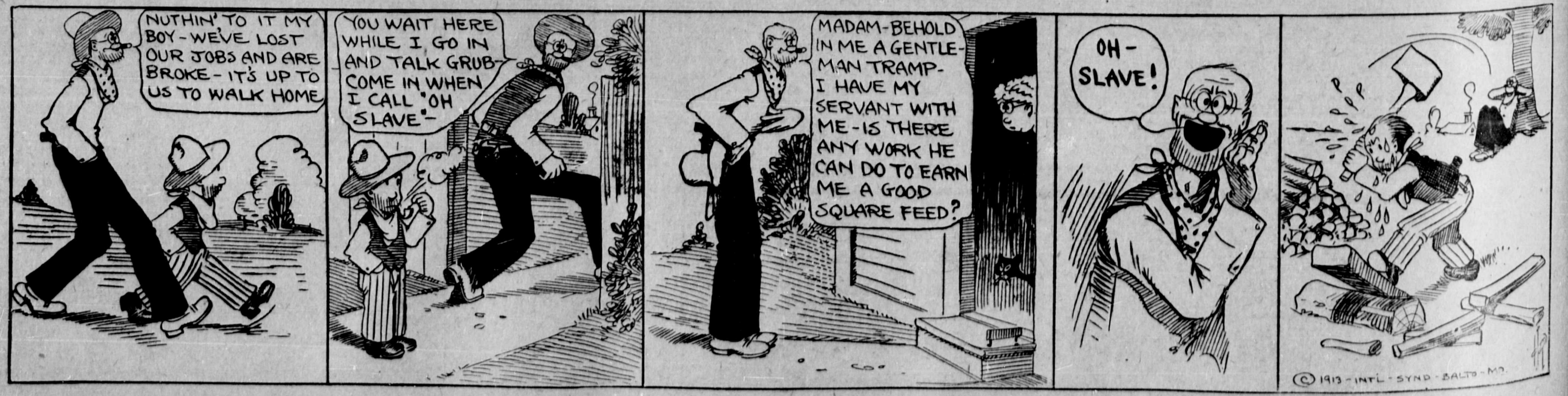
Drawn for The Daily News by 'Hog'