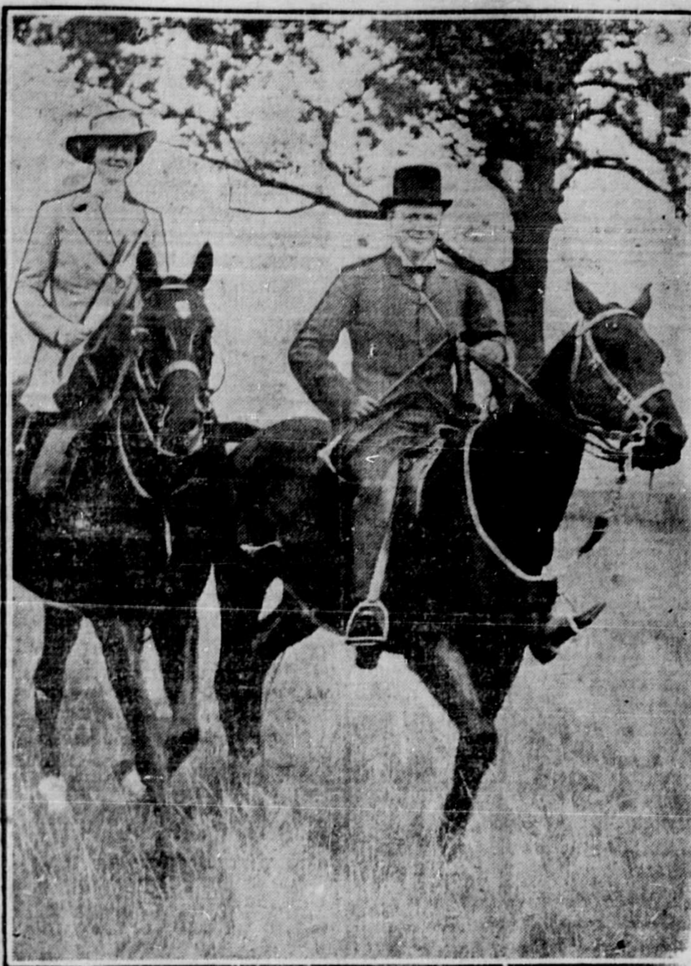
FIRST LORD OF THE ADMIRALTY AS A "HORSE MARINE."

The largest single payment for customs duty at this port was made on Monday when the Grand Trunk Pacific Railway handed over a cheque for $32,694.29, being the duty on the shipment of steel rails and angle bars now being unloaded from the steamer Santa Rosalia. The shipment came from Savannah, Georgia.