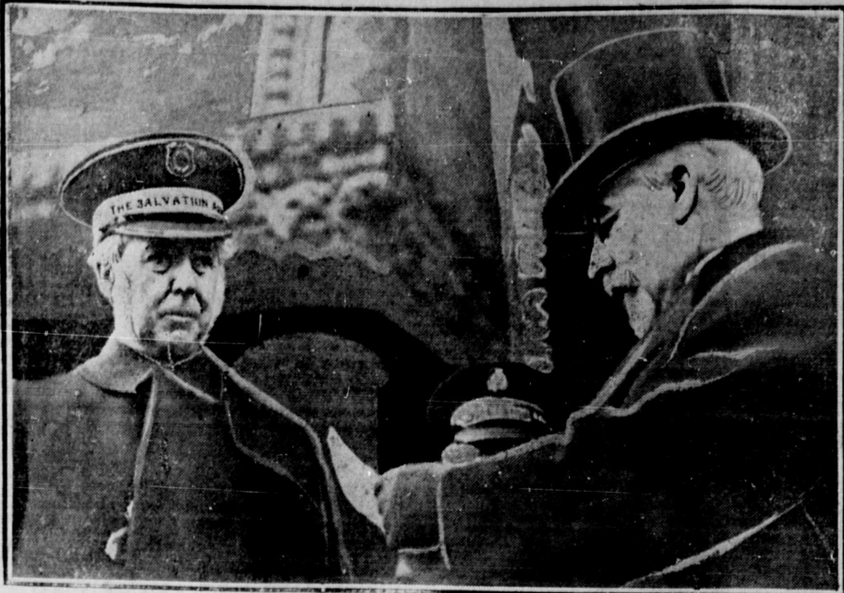
CANADA'S WELCOME TO SALVATION ARMY LEADER.