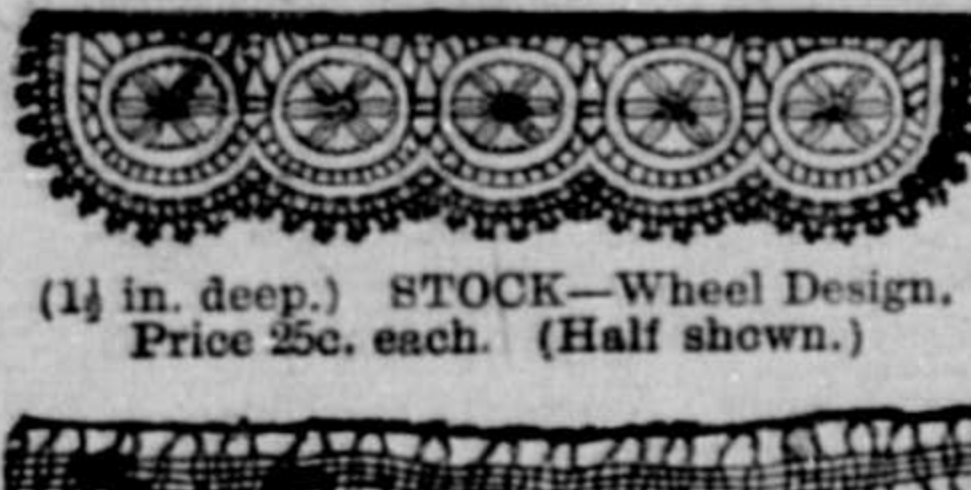
(1 1/2 in. deep.) STOCK—Wheel Design. Price 25c. each. (Half shown.)

Every sale, however small, is a support to the industry.