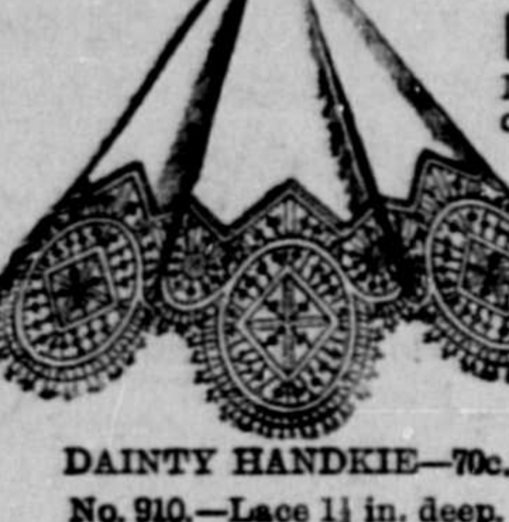
DAINTY HANDKIE—70c. No. 910.—Lace 1 1/2 in. deep.

IRISH CROCHET. Mrs. Armstrong having over 100 Irish peasant girls connected with her industry, some beautiful examples of Irish hand made lace may be obtained.