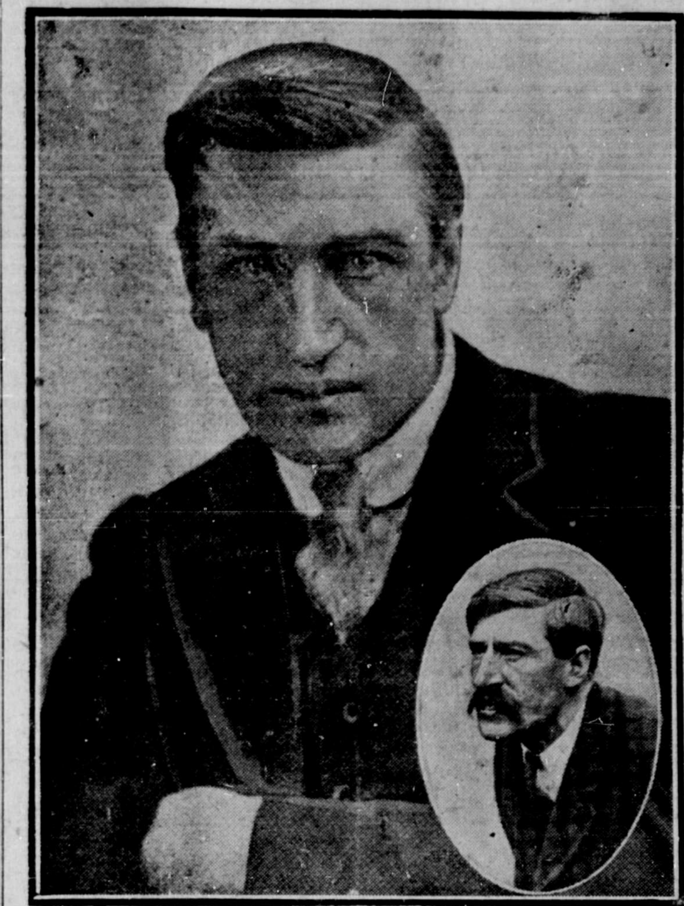
JIM LARKIN, THE LABOR AGITATOR, WHO WENT UP LIKE A ROCKET AND CAME DOWN LIKE A STICK

In Knights of Pythias Hall on Thursday, Dec. 4th, at 3 o'clock. Numerous articles for Xmas presents, home products, flowers, arts and crafts, candies, etc. The Old Woman Who Lived in a Shoe music. Tea and refreshments. Ices. Admission free.