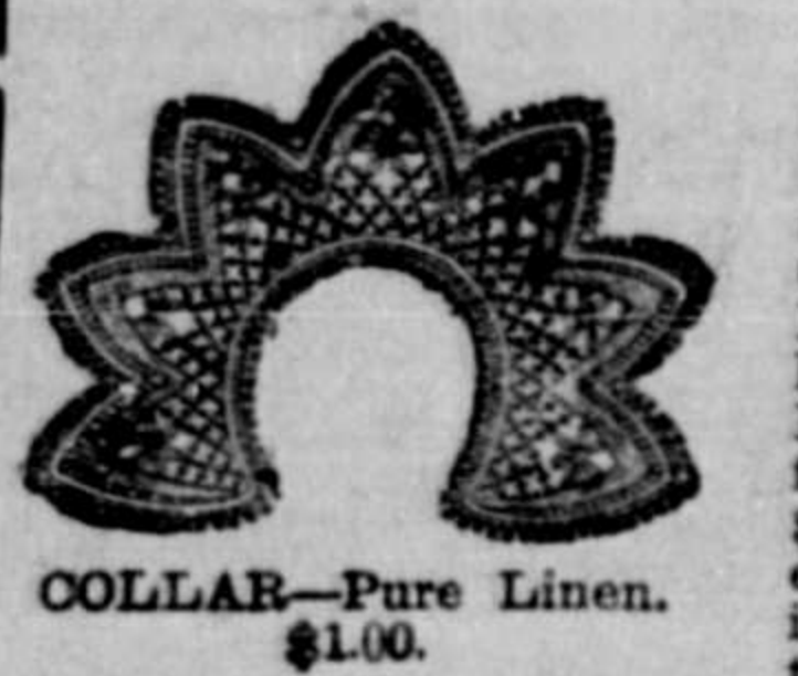
COLLAR—Pure Linen. $1.00.

Collars, Fronts, Plaques, Jabots, Yokes, Fichus, Berthes, Handkerchiefs, Stockings, Camisoles, Chemise Sets, Tea Cloths, Table Centres, D'Orlyes, Mats, Medallions, Quaker and Peter Pan Sets, etc., from 25c. 50c., $1.00, $1.50, $2.00 up to $5.00 each.