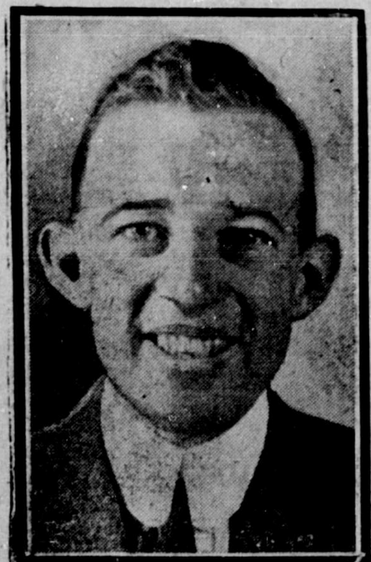
FRANCIS B. SAYRE