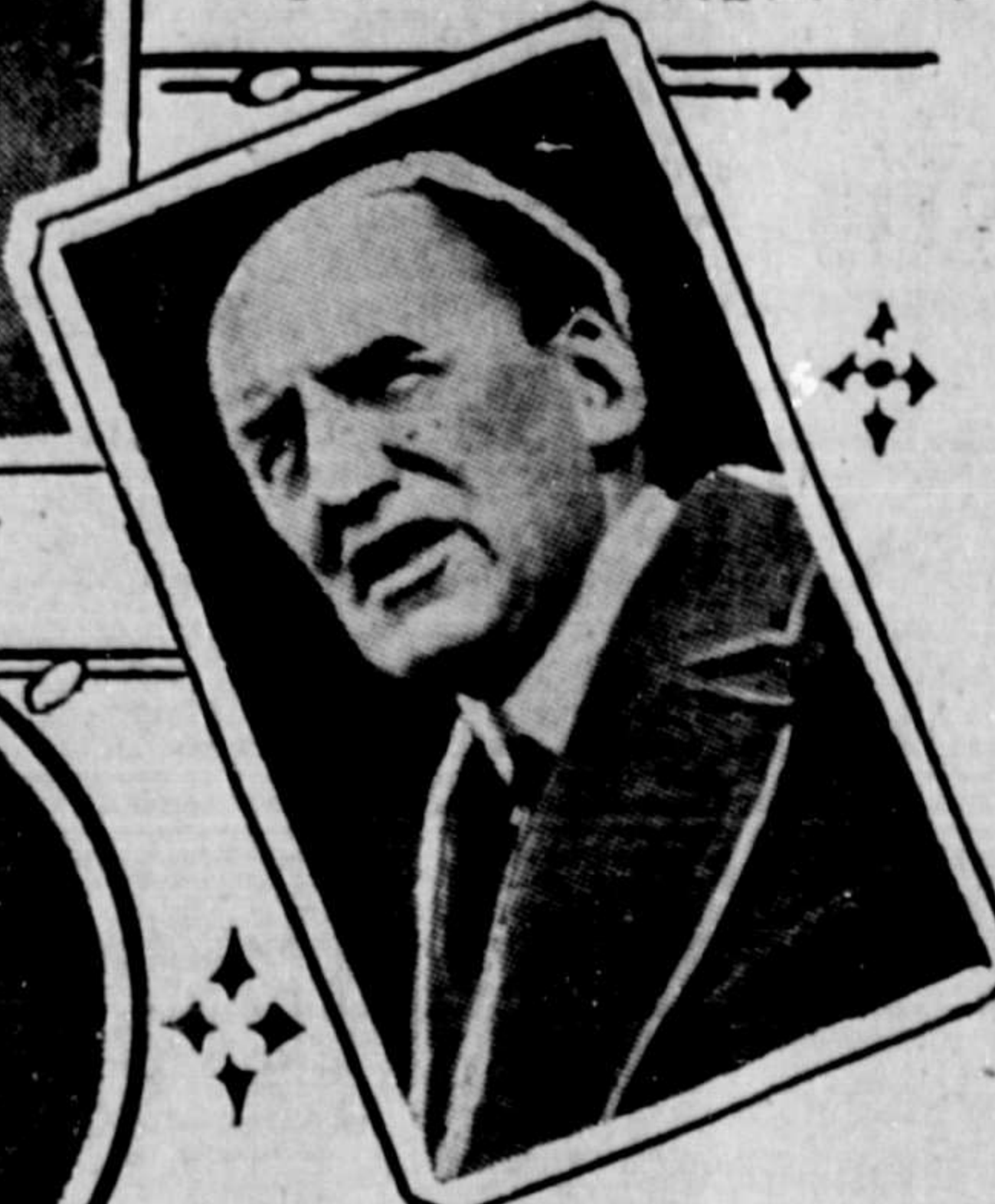
SIR EDWARD CARSON