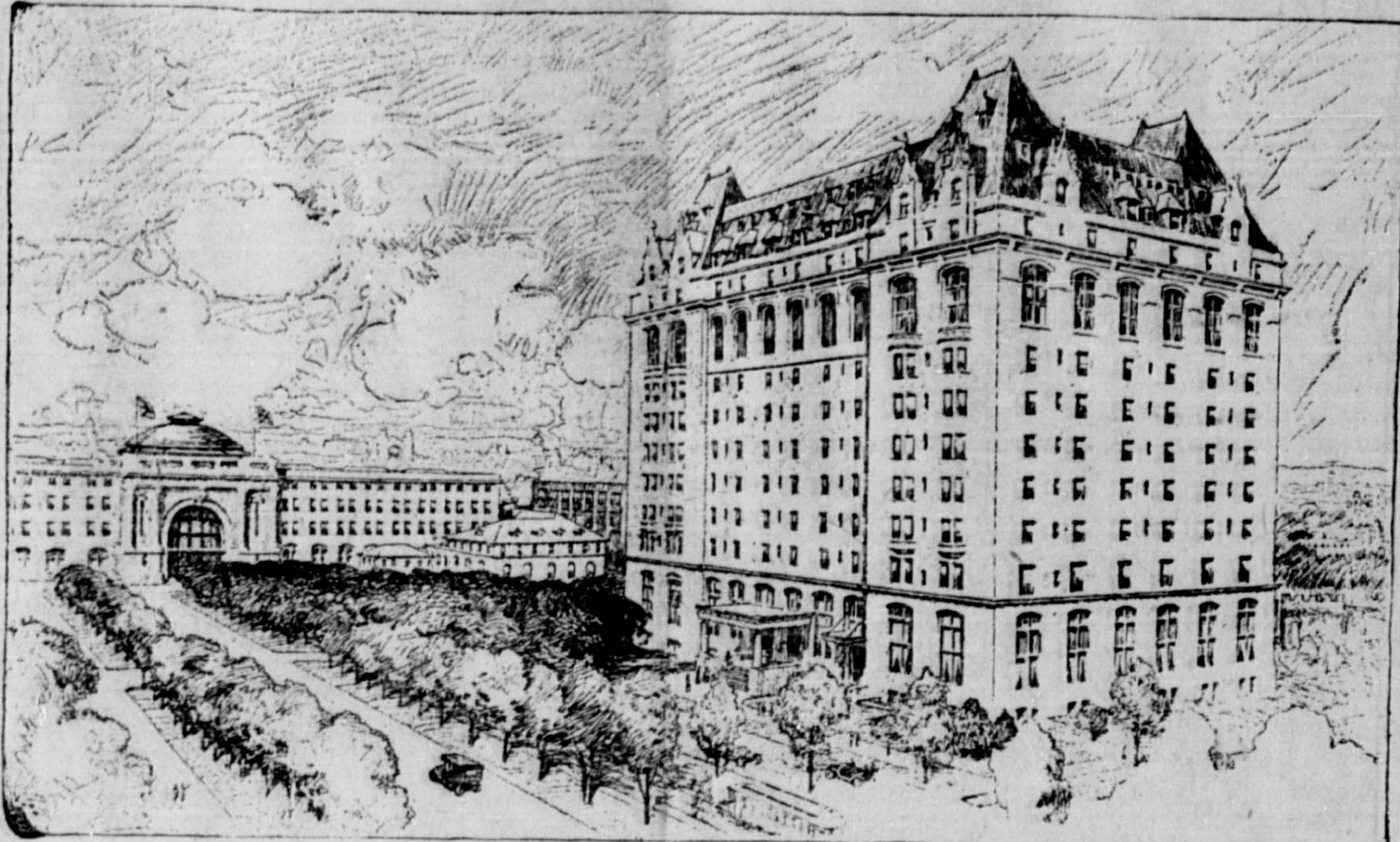
OF A SIMILAR CHATEAU DESIGN TO THAT CHOSEN FOR PRINCE RUPERT HOTEL

(Special to the Daily News) Winnipeg, Dec. 10.—The Fort Garry, the new Grand Trunk Pacific Hotel, was thrown open to the public this morning and is being visited by many people. The more formal opening will be this evening, when a ball will be given by the Winnipeg branch of the Victorian order of Nurses. This promises to be one of the most brilliant social functions that has ever taken place in Western Canada. The hotel stands adjacent to the ruins of that historic monument "Old Fort Garry," memorable in the early history of Canada's new western metropolis. It is a magnificent edifice, one of the world's finest hotels, embodying in its construction the most advanced, scientific and architectural ideals. Located in the very heart of Canada's greatest of western cities, to which all lines of traffic converge, it is readily accessible to the railroads and electric car lines and the leading theatres, the great stores and a "stones throw" from the new terminal station of the Grand Trunk Pacific. The Fort Garry is built of the finest of Canadian granite and bluff limestone, in the style of the old French chateau of Normandy and Touraine, and rears its stately height to fourteen storeys.