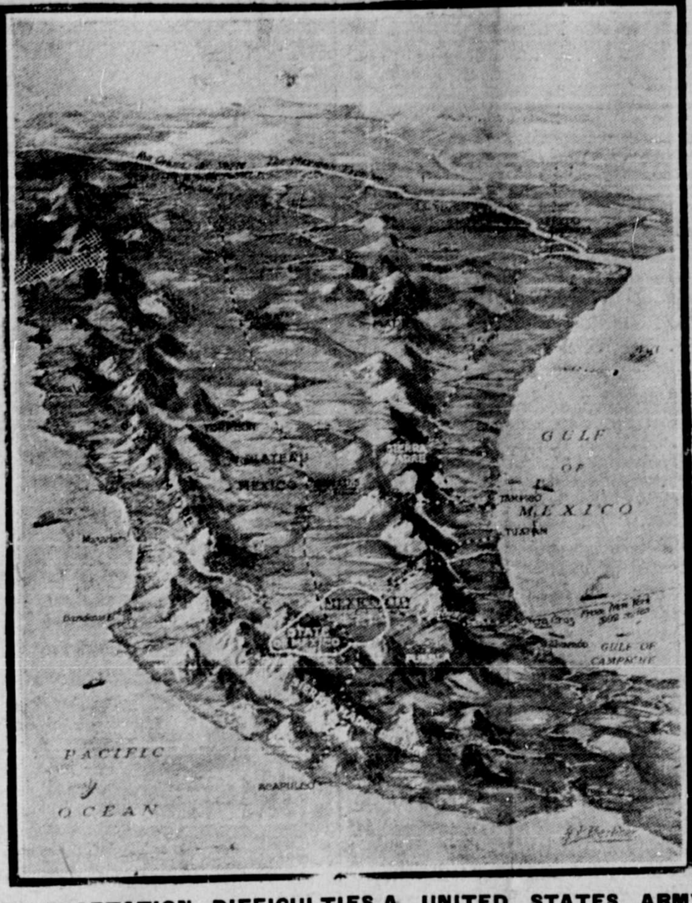
TRANSPORTATION DIFFICULTIES A UNITED STATES ARMY WOULD HAVE TO FACE IN MEXICO

Ratify Election. Washington, Dec. 10.—The word has been received here that the Mexican congress has officially recognized Huerta's election. This has caused no surprise among the officials here in view of the fact that the congress is so under the dictation of the provisional president. The official notification of the recent election and the ratification of Huerta as the provisional president to continue in power until another election can be held, probably in next July, was received here today.