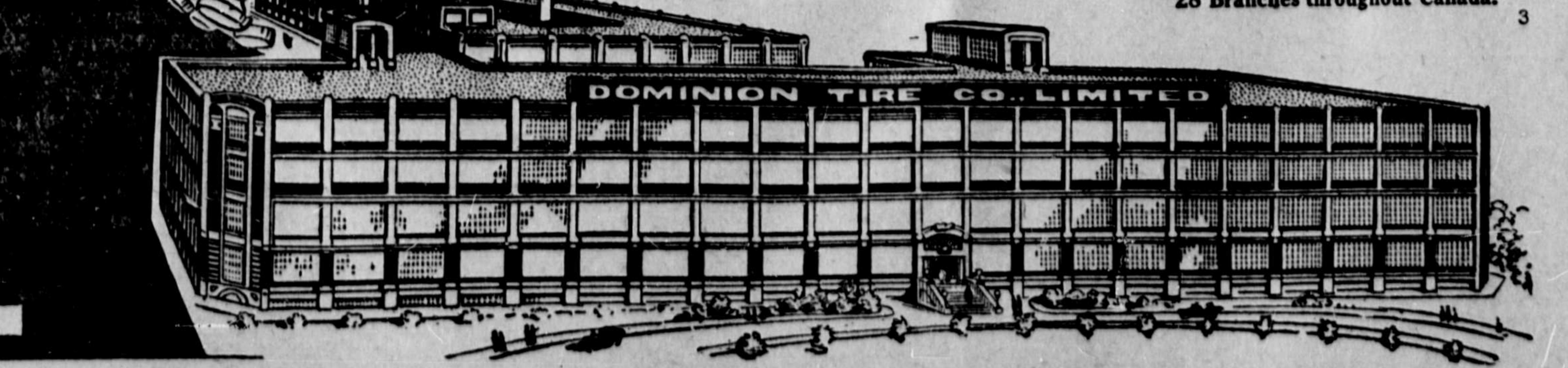
DOMINION TIRE CO. LIMITED 28 Branches throughout Canada.

So keen is the demand for DOMINION "Nobby Treads" that we have had to cut down some of the largest orders so as to be able to supply some, at least, to every dealer in Canada.