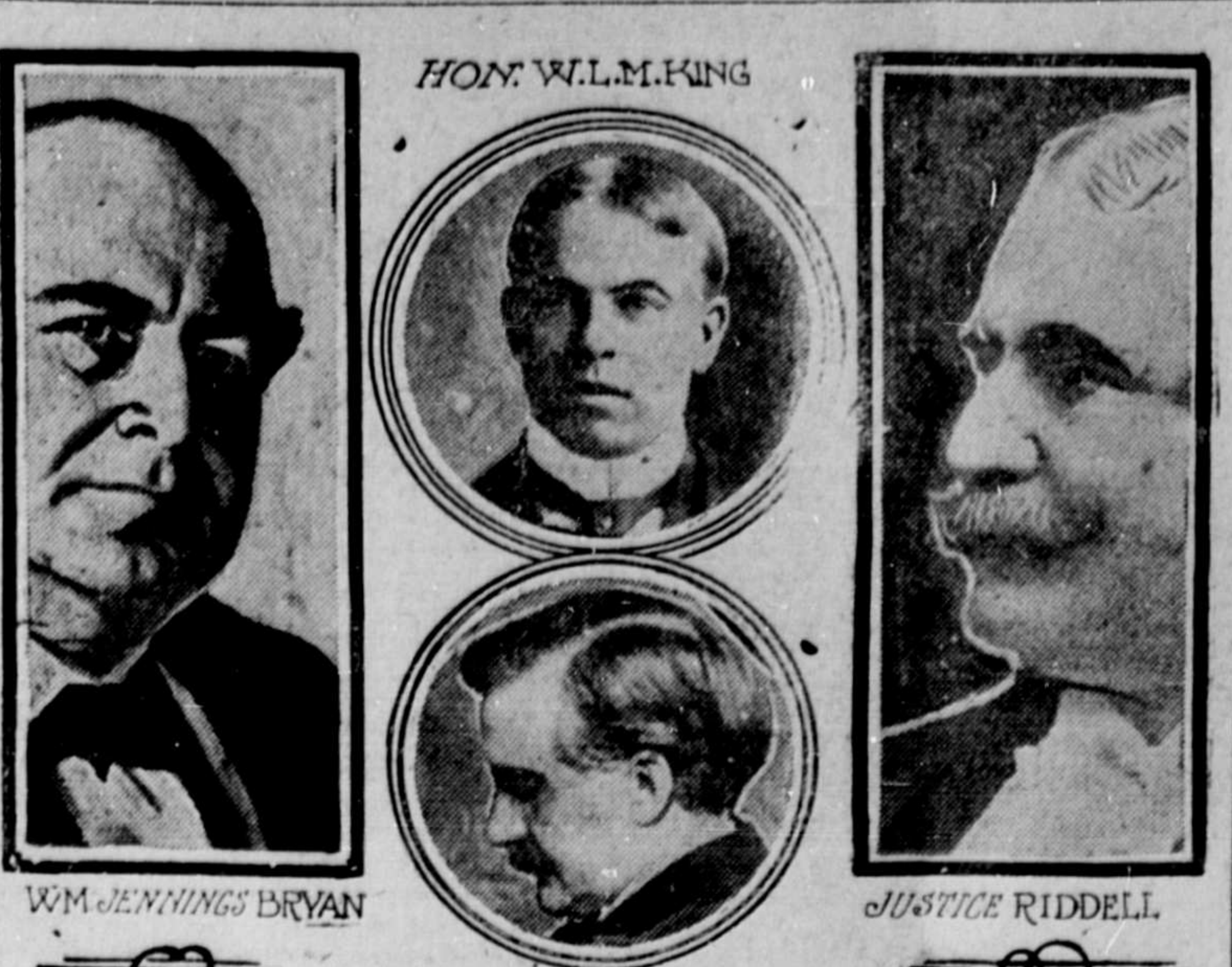
AT THE CANADIAN SOCIETY DINNER IN NEW YORK Four Prominent Guests at the Dinner