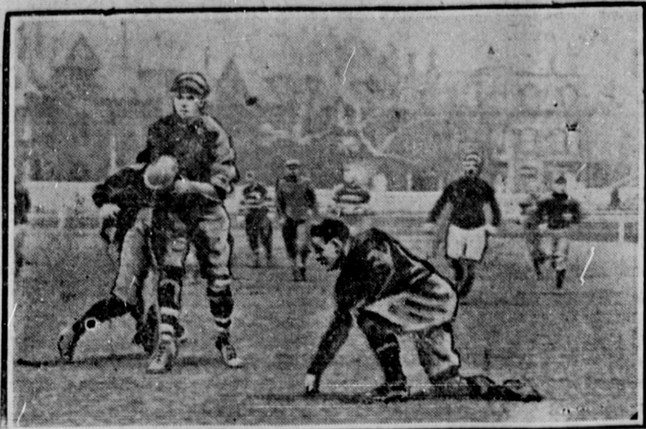
GREAT RUGBY BY THE "HUMAN LOCOMOTIVE"

This centralized authority is perhaps the weakest point in the system of modern government. It is at least the place where popular government stops, and where boss-rule begins. It is an unhealthy bunch of clotted veins that needs the surgeon's knife, before a free circulation of democratic principles can take place.