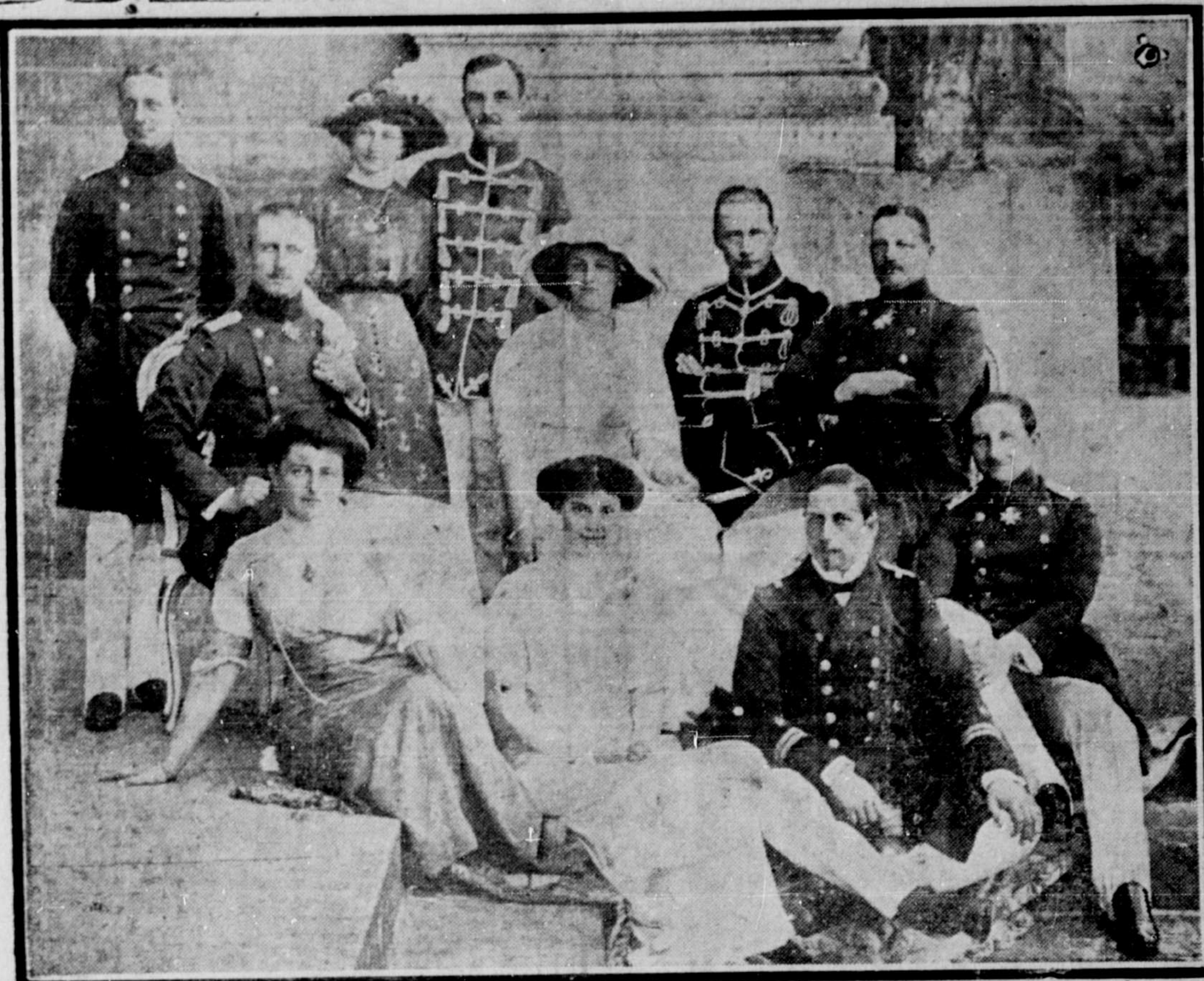
The Kaiser's six sons, daughter and son-in-law