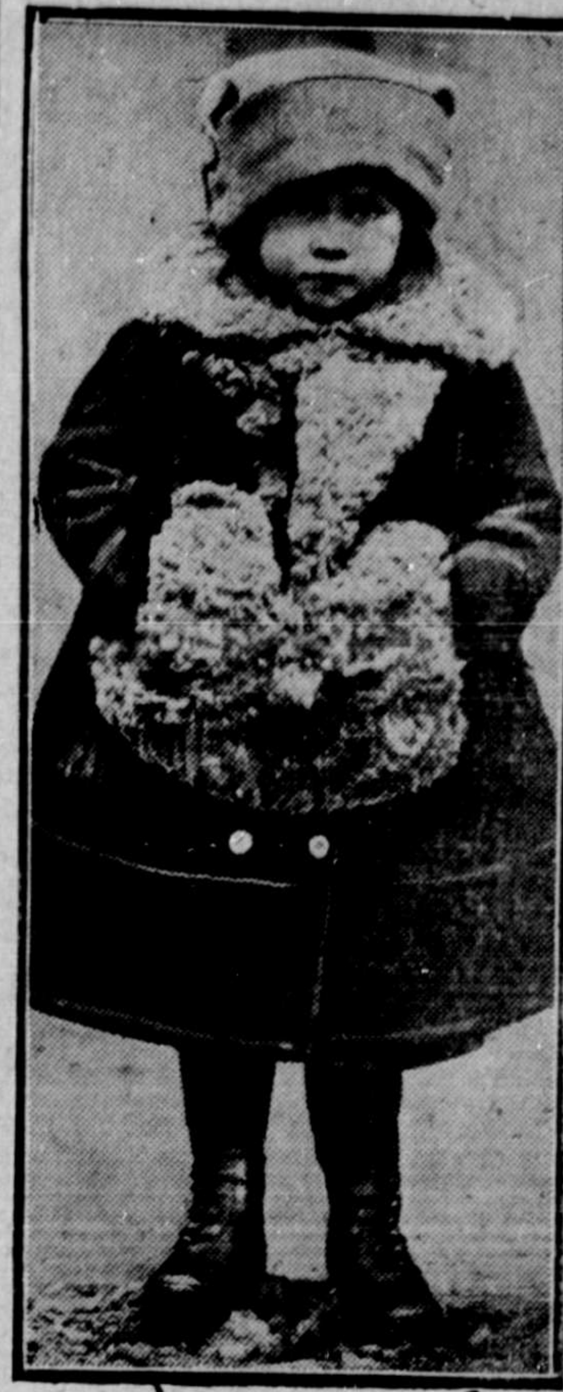
A PRIZE MAIL PACKAGE