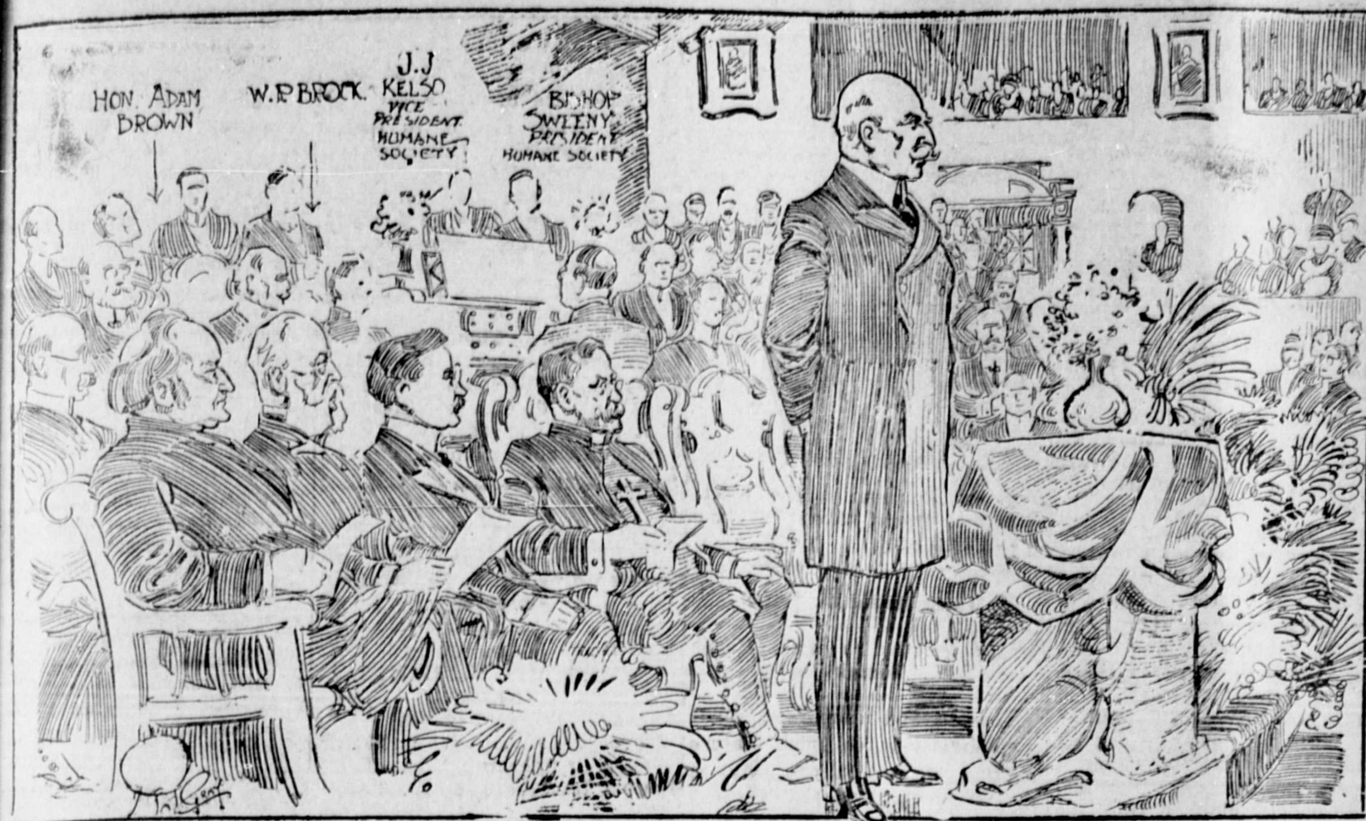
H. R. H. THE DUKE OF CONNAUGHT AT MEETING OF ROYAL HUMANE SOCIETY

Parents should endeavor to inculcate into their children a spirit of kindness towards the animal kingdom," said his Royal Highness when addressing the Royal Humane Society recently.