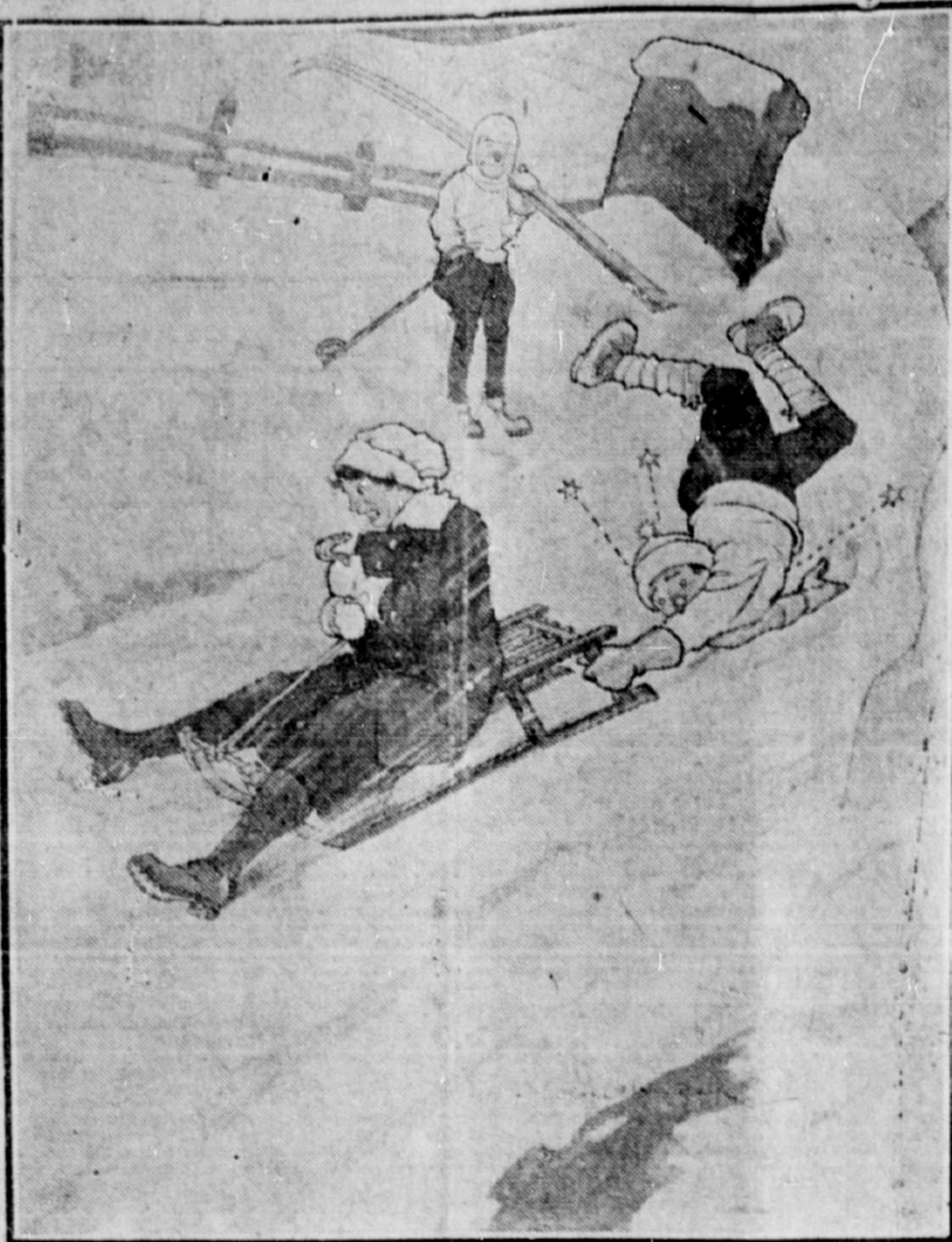
CREST (A) FALLEN

We are pleased to learn, as doubtless also was our morning contemporary, that subsequent to the advertisement of cancellation of the water reserves upon Kaien Island and the Tsimpsaan Peninsula, a notice was published in the B. C. Gazette making several specific reservations, notably McNicholl Creek and Cloyah River. This is well and it is gratifying that the matter was brought home to the attention of the government so sufficiently forceful that the reservation would now seem to be a permanent one, although no advices in the matter had been received at the city hall. This perhaps is not surprising, for even in the short life of this city matters between the government and