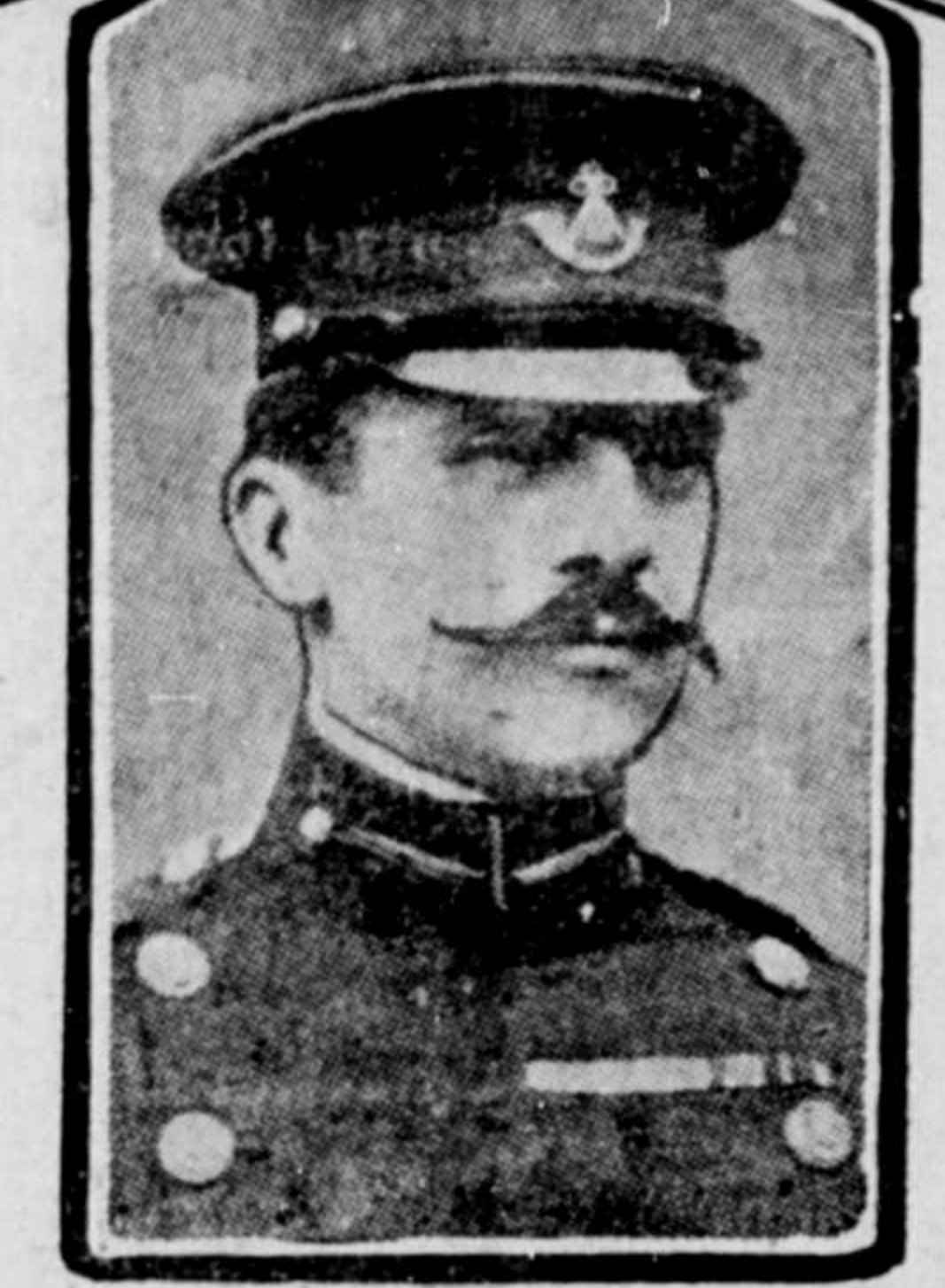
LORD FITZWILLIAMS, CORRESPONDENT.