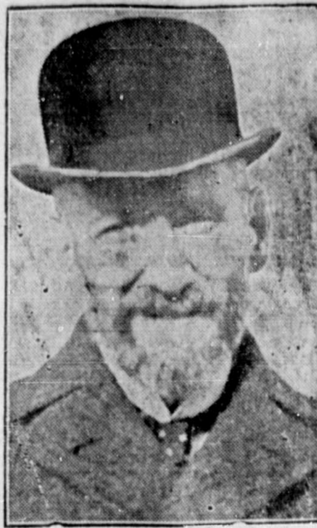
SIR HORACE PLUNKETT