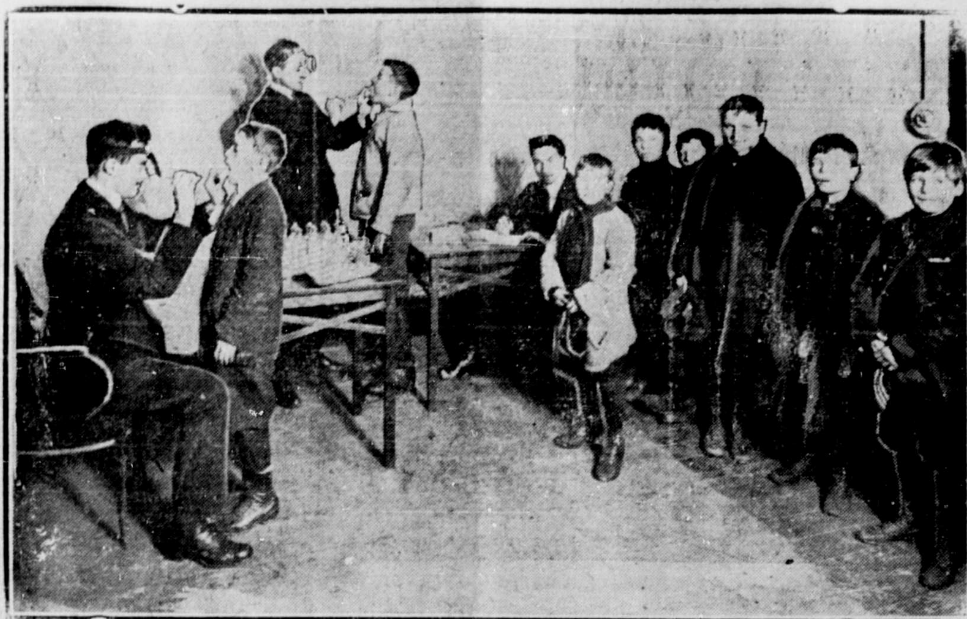
THE NEW CIGARETTE CURE

Literature would pay better if there were not so many dead men in the business.