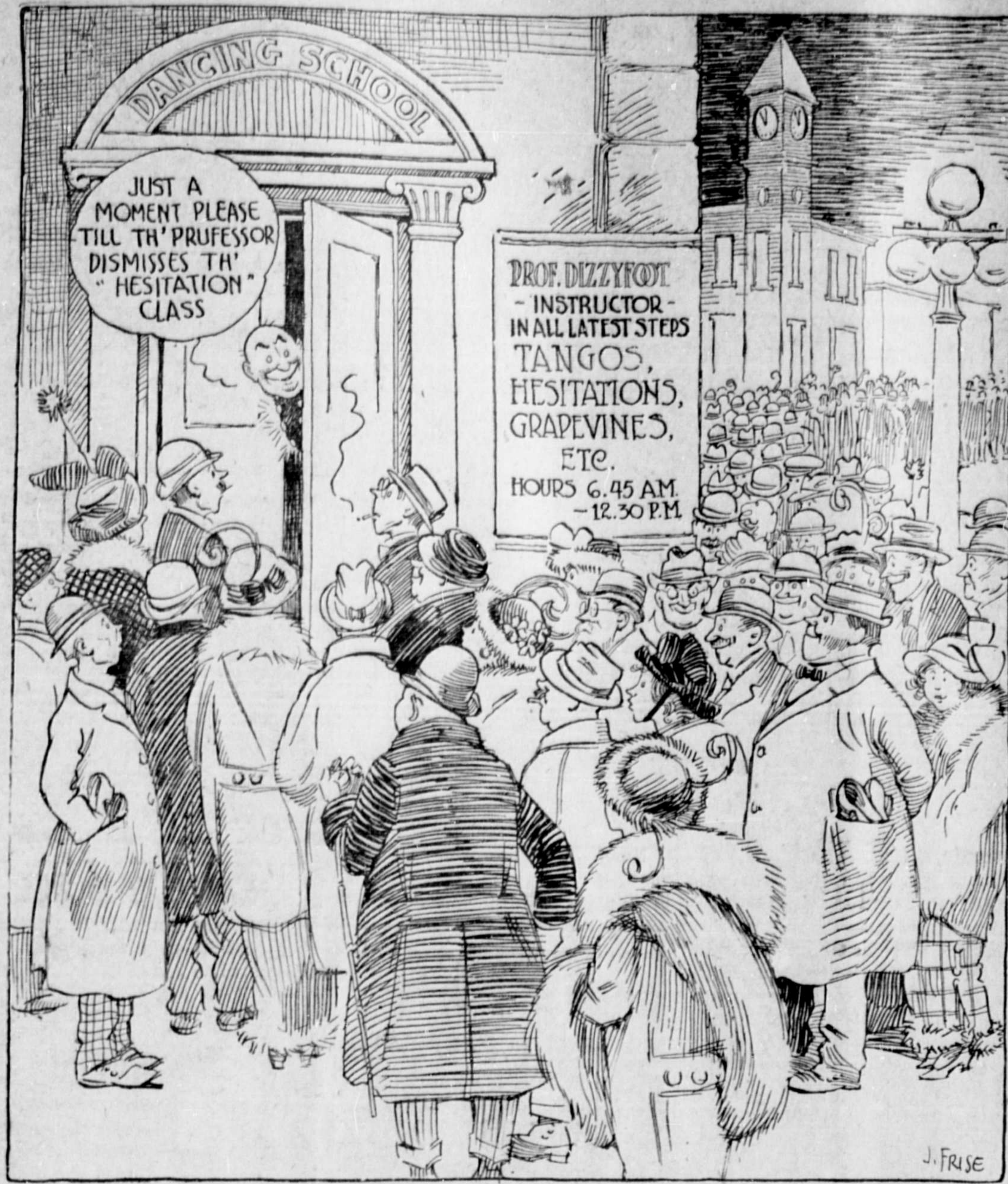
"Present Craze for Freak Dancing"