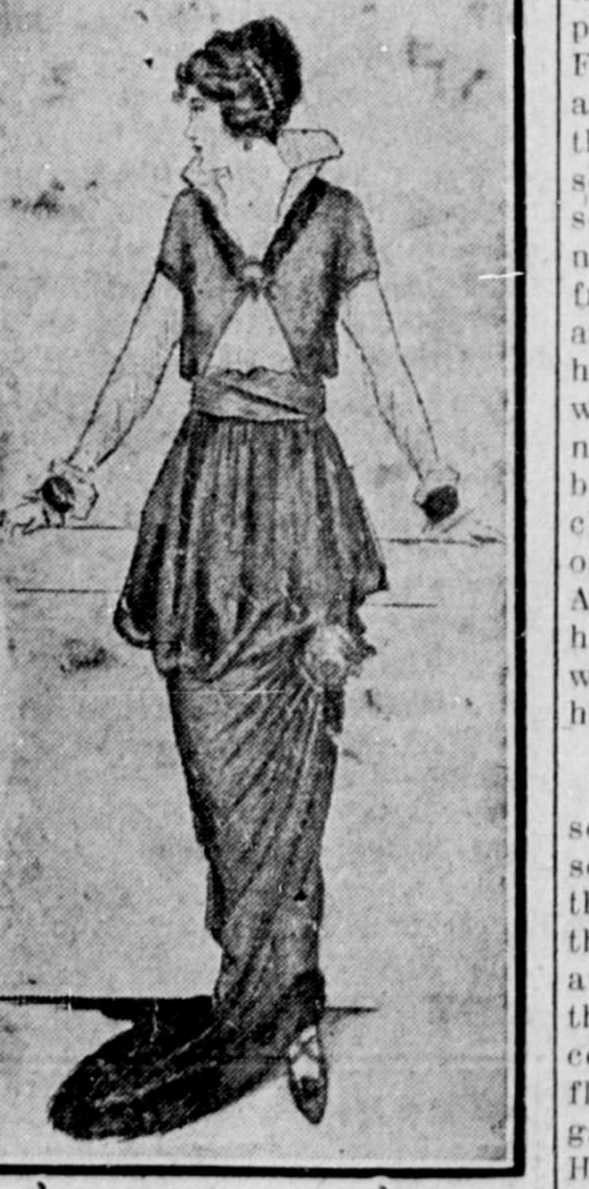
THE FASHION IN VELVET A charming spring gown in blue panne velvet. The bolero trimmed with skunk, is worn over a chemisette of fine spotted net. Belt in orange charmeuse.

It is not to be expected that Bowser and McBride are going to worry very much over what may happen in the future with regard to the province having to meet the guarantees given in connection with the Canadian Northern. These gentlemen are pretty well circumstanced, thank you, and when the time comes, as come it will, when the province has to dig up the coin, Bowser and McBride will curl up their beaks and soar away. Bowser and McBride will say to the Liberal administration: "We built the railroad; now you fellows can get in and pay for it."