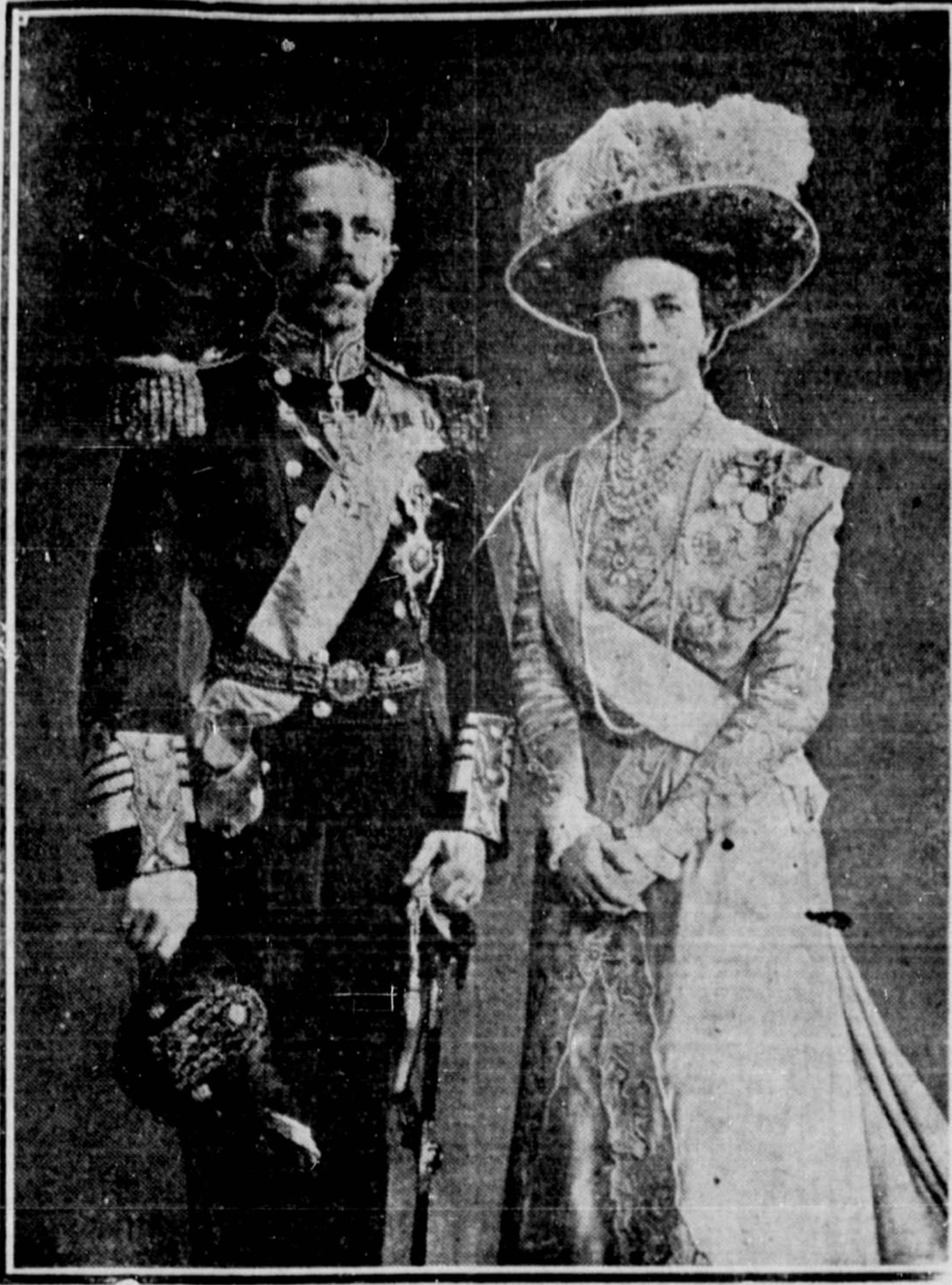
KING GUSTAVUS, THE FIFTH OF SWEDEN, AND HIS CONSORT

When you ask a friend of yours to subscribe for The News, you are also probably asking a friend of ours. The News is recognized as the leading daily paper of this flourishing district, and it is a permanent fixture in the community.