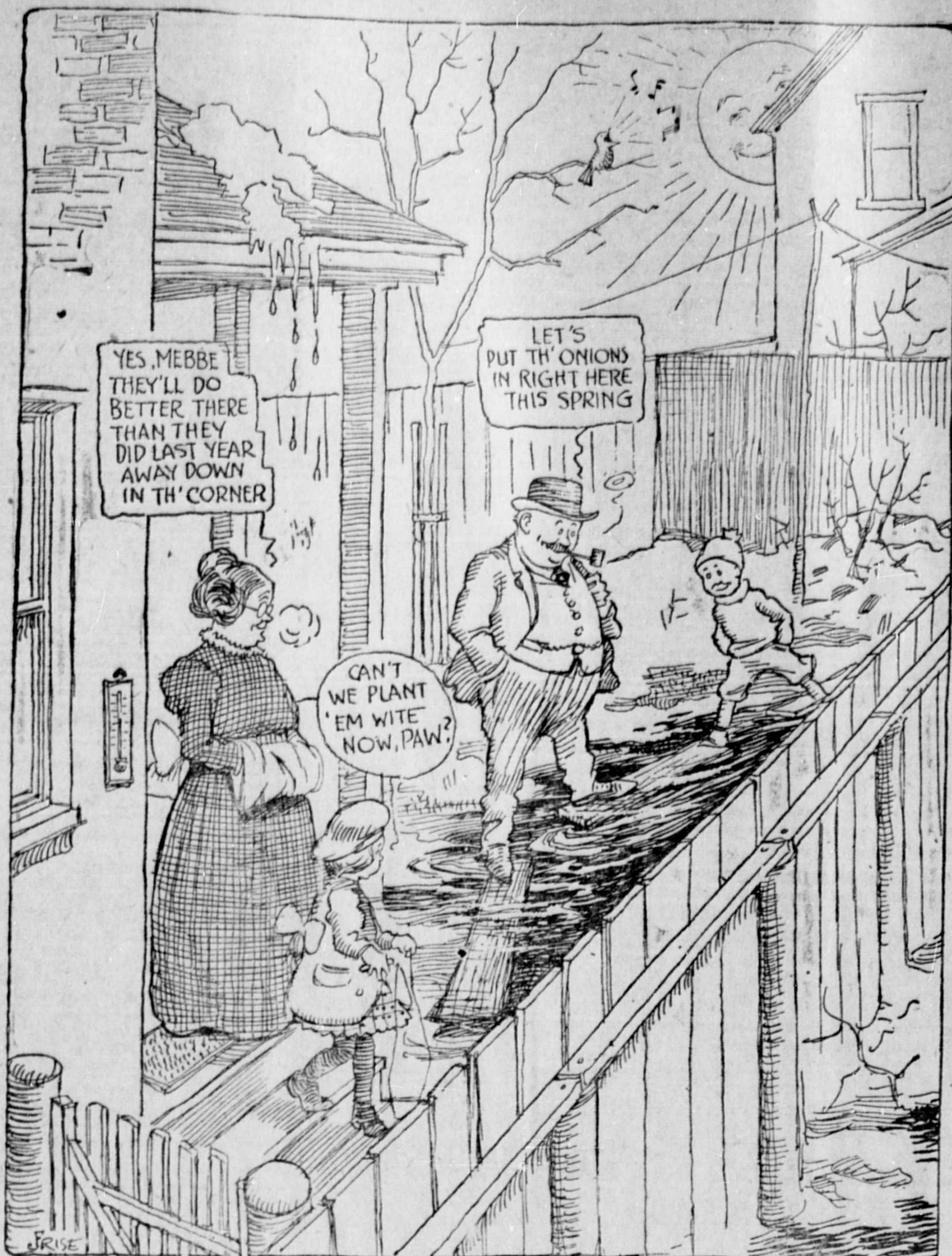
"THE GARDEN THAT IS TO BE"