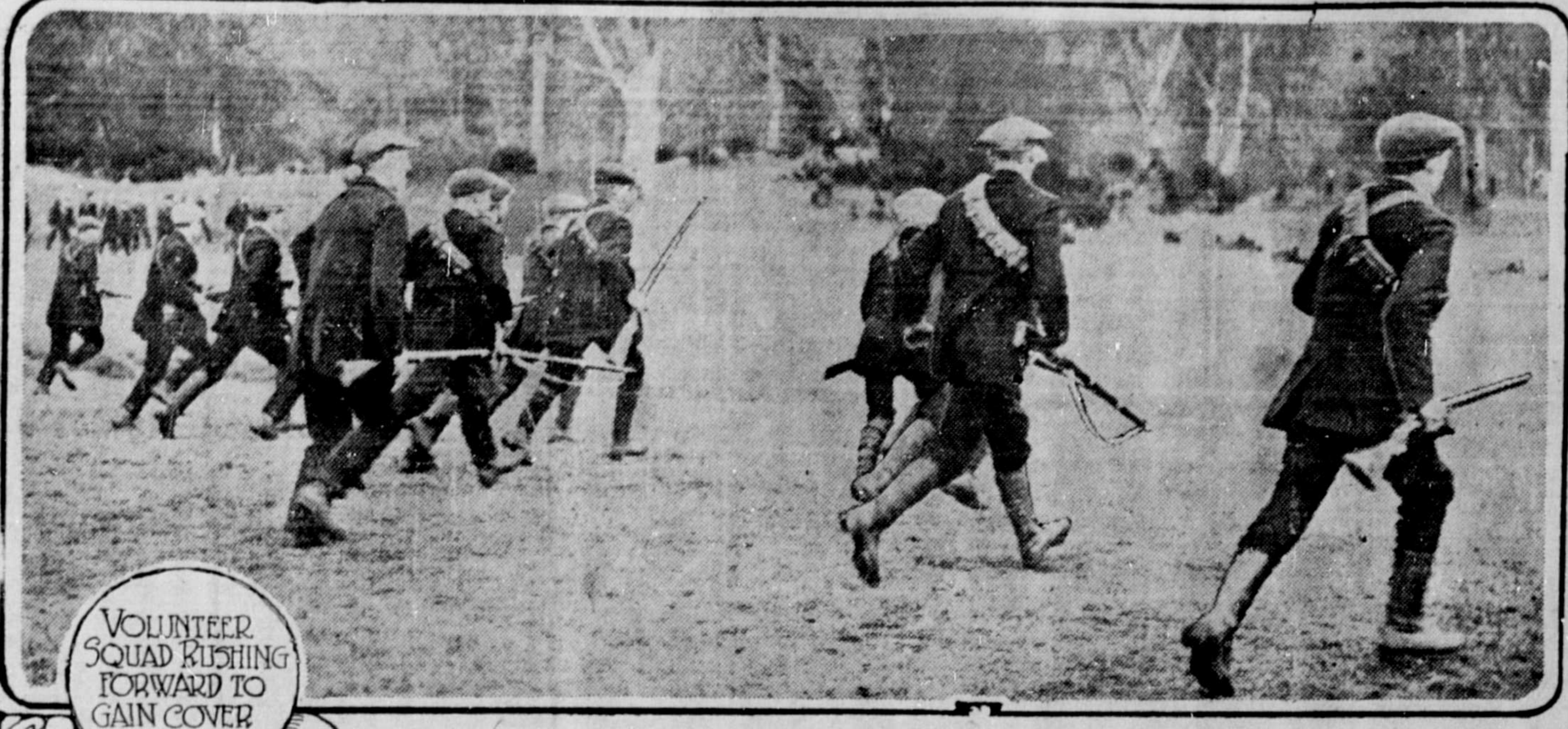
Tyrone volunteers holding manoeuvres at Dungannon, when the Fourth Dungannon Battalion Tyrone Regiment of the Ulster Volunteer force had a field day. The operations, in which 2,000 men participated, covered an area of two square miles.

(Special to The Daily News) London, April 2.—A remarkable pacific spirit has come over the political situation. It is almost certain that Premier Asquith will be returned unopposed. The feeling in favor of a settlement on a federal basis is gaining ground. Mr. Balfour will speak tomorrow and Sir Edward Carson and Mr. Bonar Law on Monday, when a division on the reading of the bill will be taken. The date of the East Fife election is April 15. The possibility of a compromise in connection with the home rule question is the whole talk of the day. There is a feeling that the government is about to make a proposal acceptable to the Unionists and to Ulster. It is even suggested that at this compromise the exclusion of the whole of Ulster may be granted. The News' reference that many volunteer drills arranged for Saturday have been cancelled may be due to this. Belfast Nationalists say they might as well drop the bill as exclude Ulster. The Liberal leaders have explained that with a general election possible and a Unionist victory not far off there is a chance that the measure would be amended considerably in the next few years to meet the views of the Unionists. In consequence of this chance, therefore, it might be advantageous to consent to the exclusion providing there is an understanding given by the Unionists that the home rule scheme will not be amended should the Unionists be returned to power.