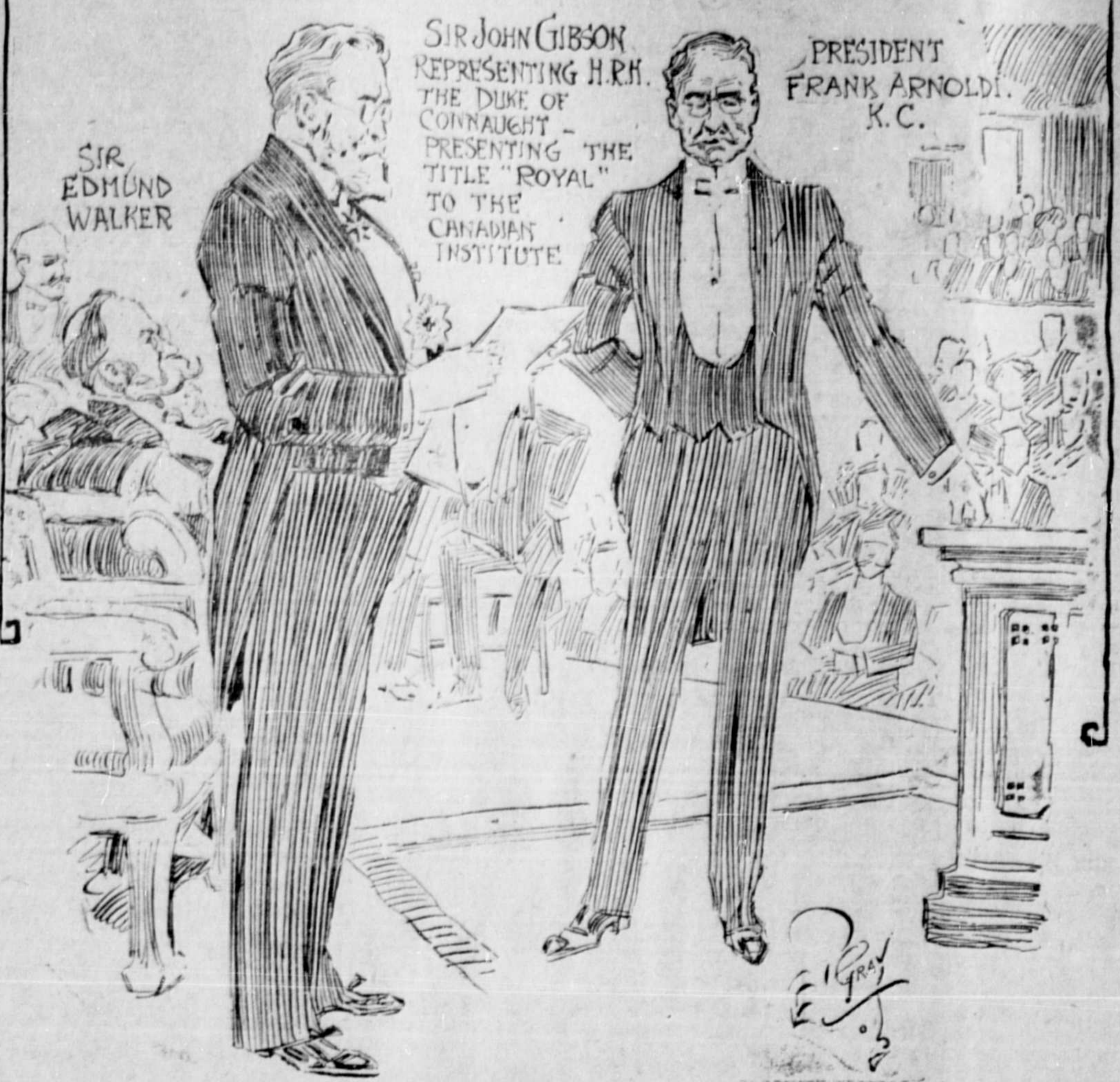
PRESENTING TITLE "ROYAL" TO CANADIAN INSTITUTE

This is the first scientific institute in Canada which has been given this title. The membership includes scientists and professional men all over Canada.