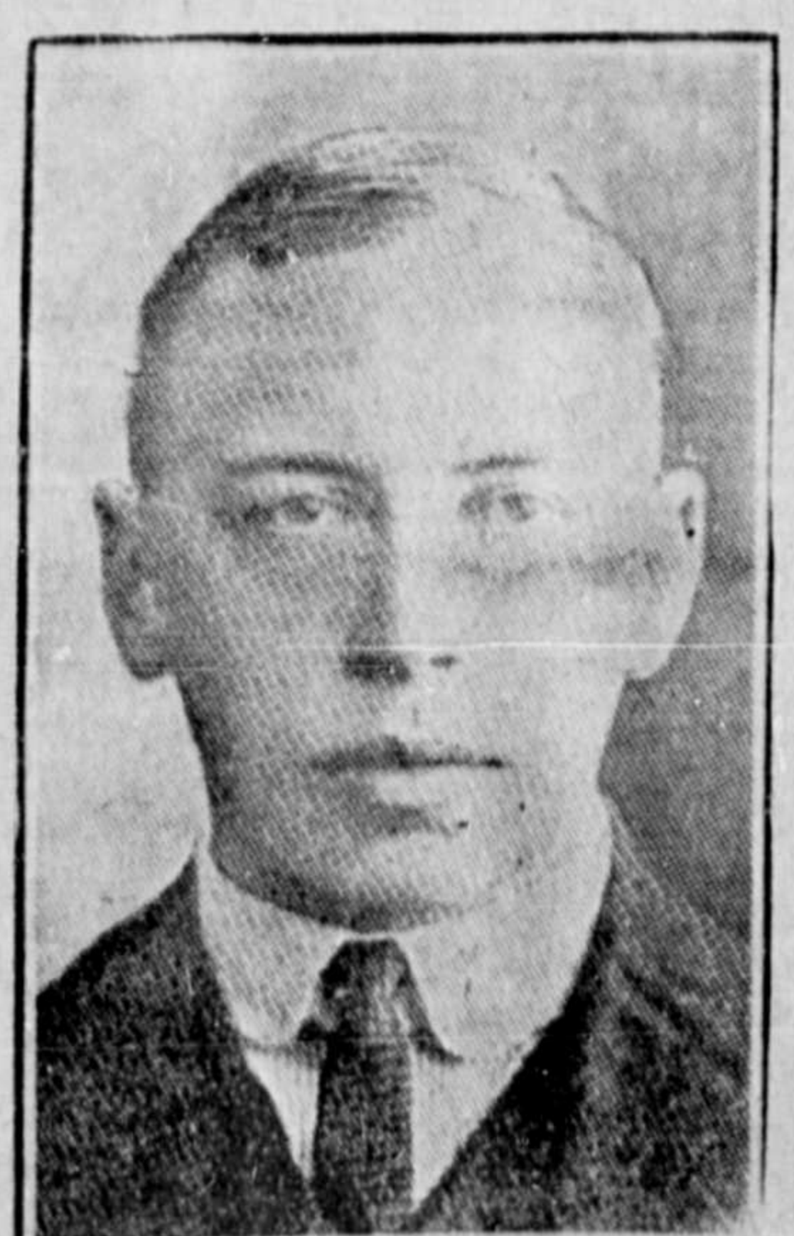
ALFRED NOYES The English poet, who is now touring Canada. Many people think he should have been appointed poet laureate in place of Bridges.