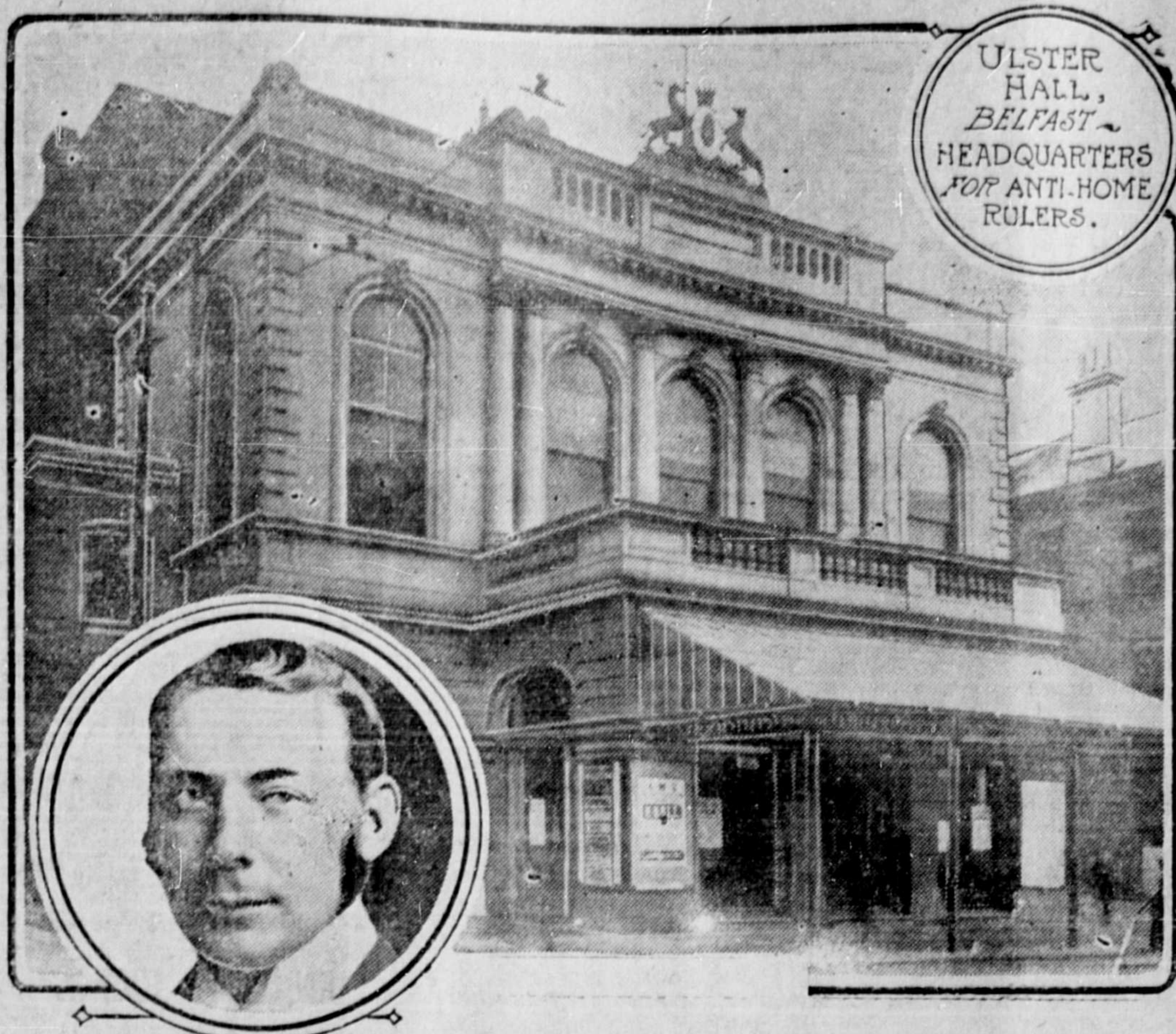
ULSTER HALL, BELFAST HEADQUARTERS FOR ANTI-HOME RULERS.