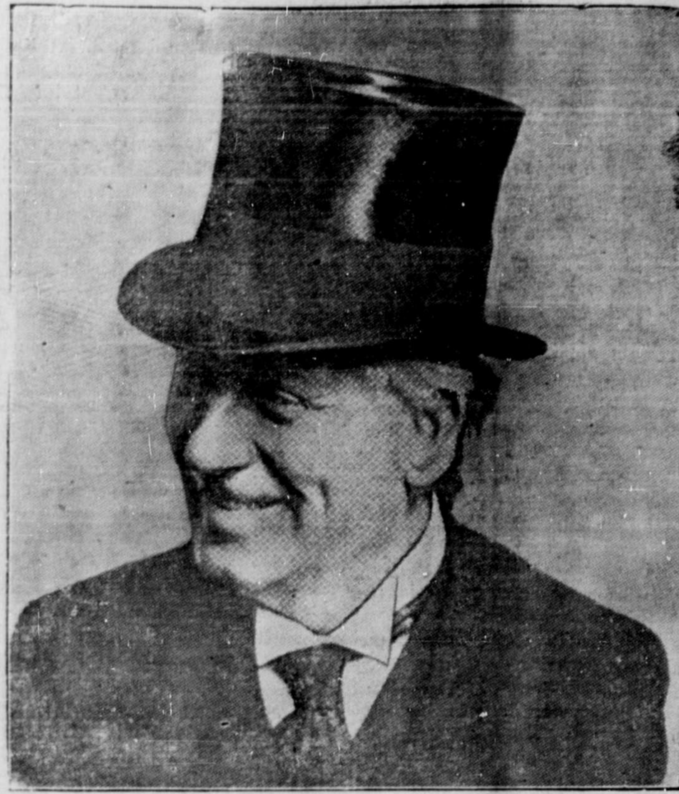
ASQUITH AND HIS ELECTION SMILE

Right Hon. Herbert H. Asquith, Prime Minister of Great Britain, is himself one of the best "stump" speakers in the Old Country. He is able to get and maintain the interest of his audience, even though it be very hostile. They do say it is largely on account of his broad smile, as seen in the picture.