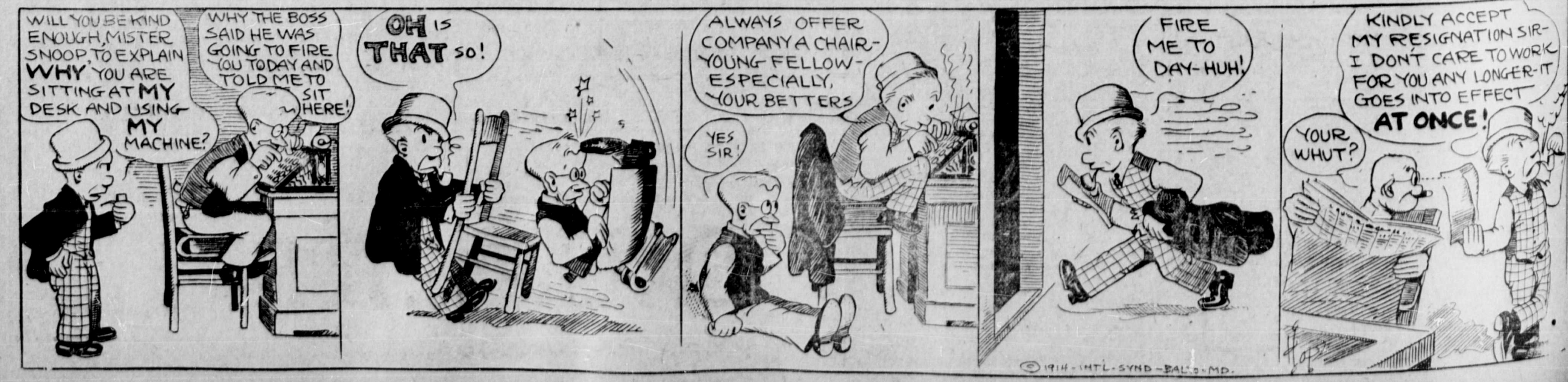
Drawn for The Daily News by "Hop"