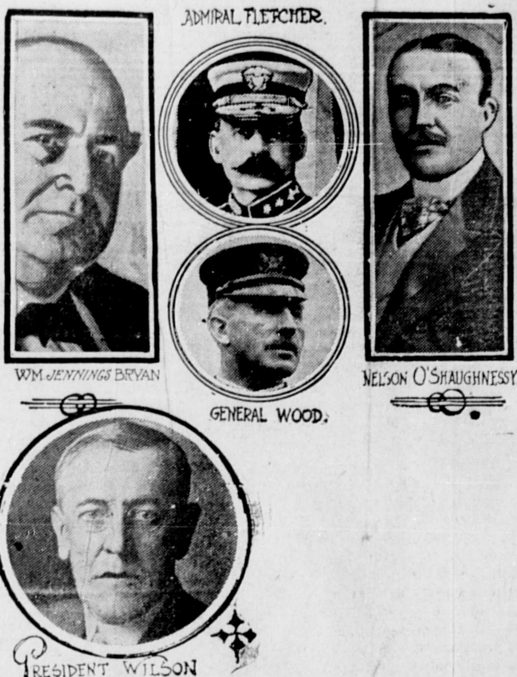
LEADING FIGURES IN THE UNITED STATES-MEXICAN CRISIS

The Westholme Lumber company are shipping three carloads of building material to Skeena Crossing for the B. R. Jones hotel being built there.