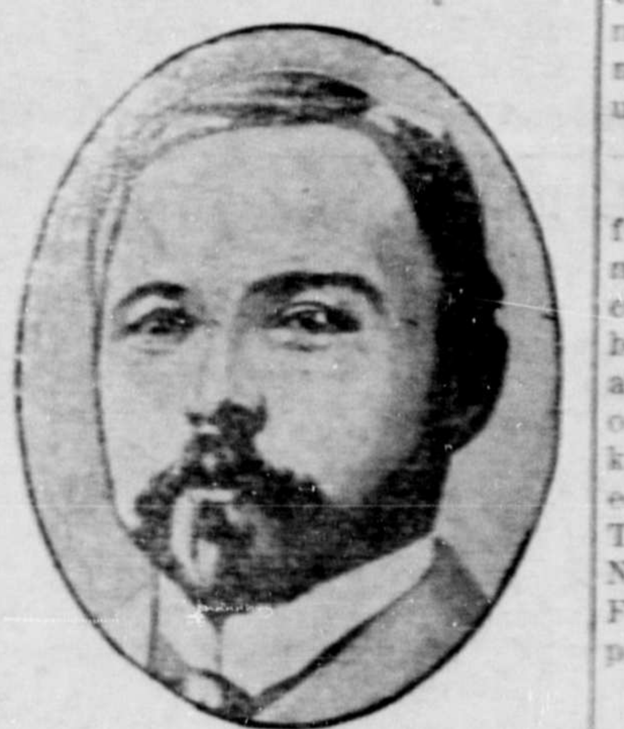
BRIG.-GENERAL FUNSTON Commander of the United States forces in Mexico now in occupation of Vera Cruz.

TAKE NOTICE that I, William McK. Logan, of Prince Rupert, B. C., occupation carpenter, intend to apply for permission to purchase the following described lands: Commencing at a post planted about 160 chains east and 40 chains south of the northeast corner of Pre-emption Record 1823, thence south 40 north 40 chains, thence west 80 chains to the northerly shore line of an island, thence south 60 chains to the southerly shore line to point of commencement; containing 220 acres, more or less. W. M. McK. LOGAN, March 7, 1914.