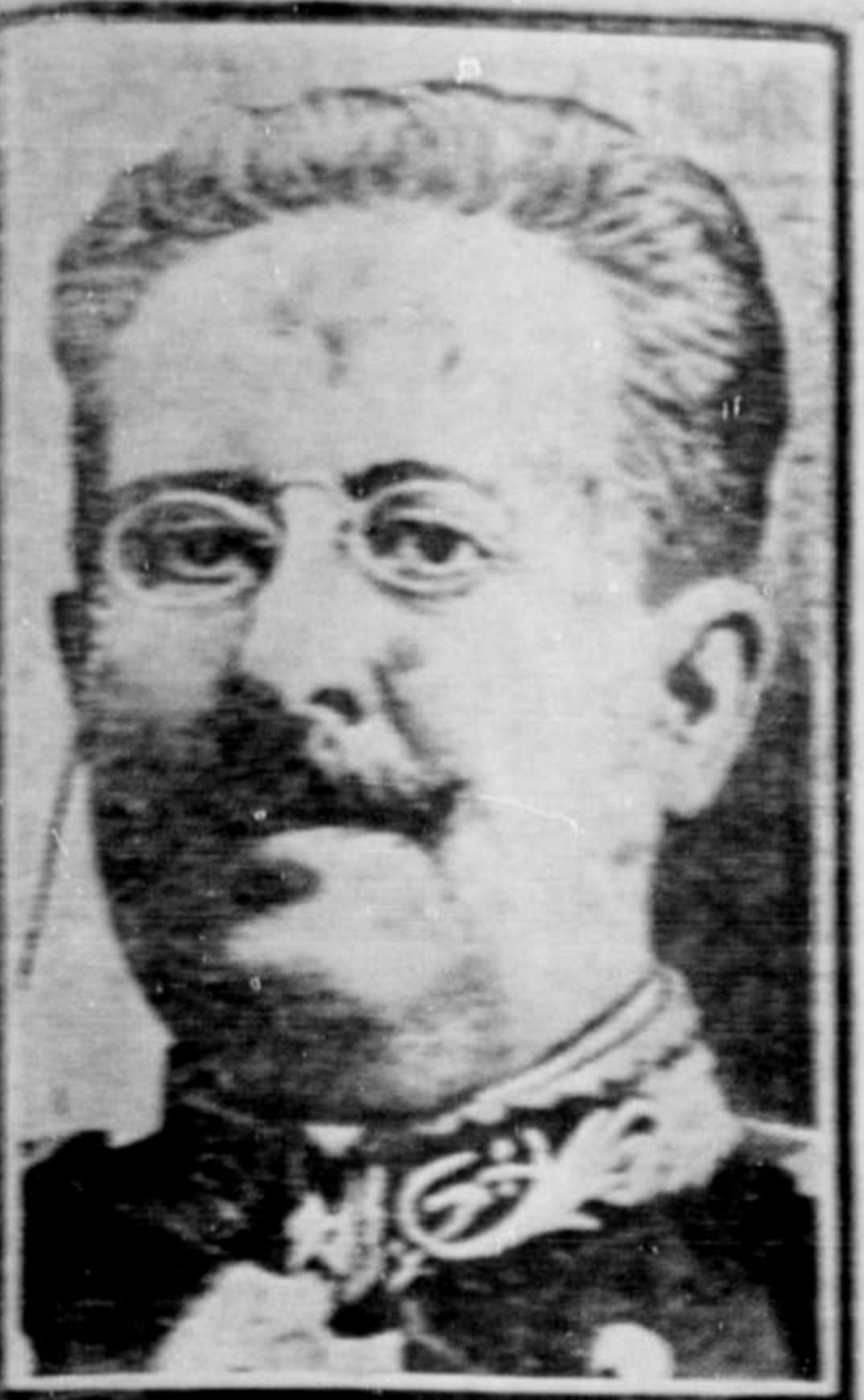
GEN. GUSTAVO MAAS

THE WEATHER Furnished by F. W. Dowling Observer For the 24 hours ending 5 a.m. May 13, 1914 Barometer reduced to sea level 30.154 Highest temperature 54.0 Lowest temperature 43.0 What everyone should know: People of discriminating taste dine at the G.T.P. Cafe. 831f