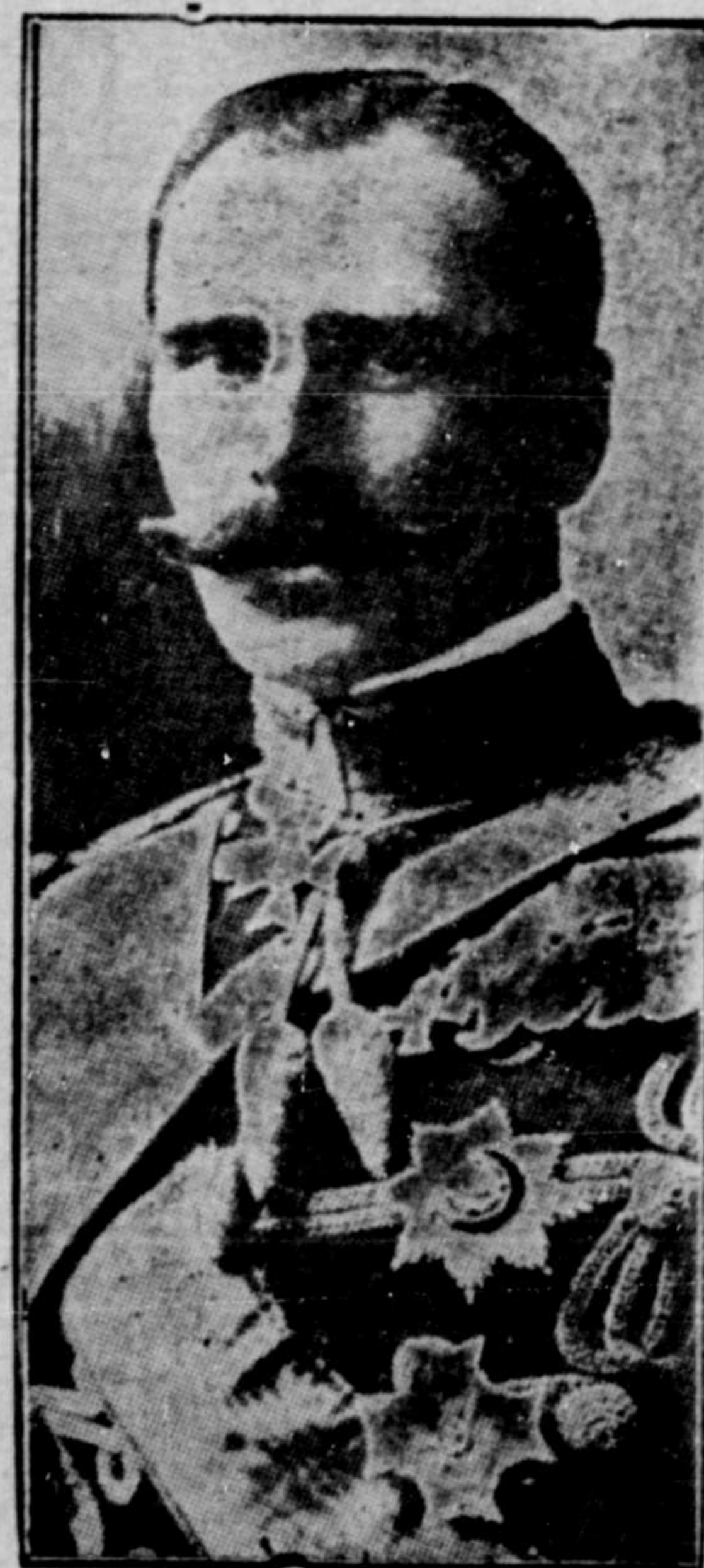
PRINCE ALEXANDER OF TECK Who will assume the position of Governor-General of Canada in October next.

a few men in the north each winter to care for equipment and supplies. The actual visible results of the six or seven years of efforts, a twenty-foot vista, cut like a gigantic avenue or line, through all timber and brush districts, together with monuments, set at intervals of points, from three to four miles apart.