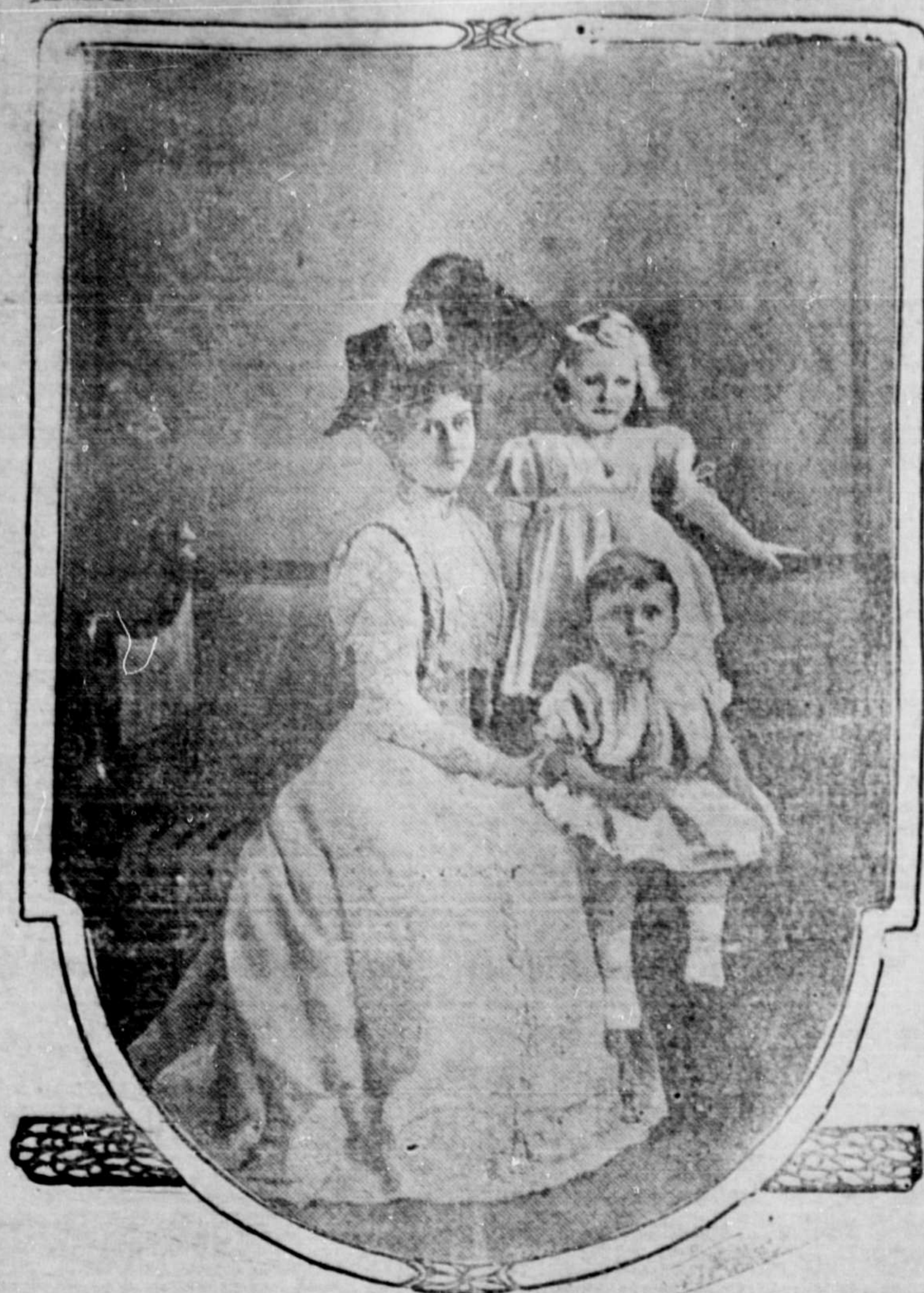
NEW MISTRESS OF RIDEAU HALL AND HER CHILDREN

Remember, too, that when you pay an indirect tax, you generally pay twice as much.