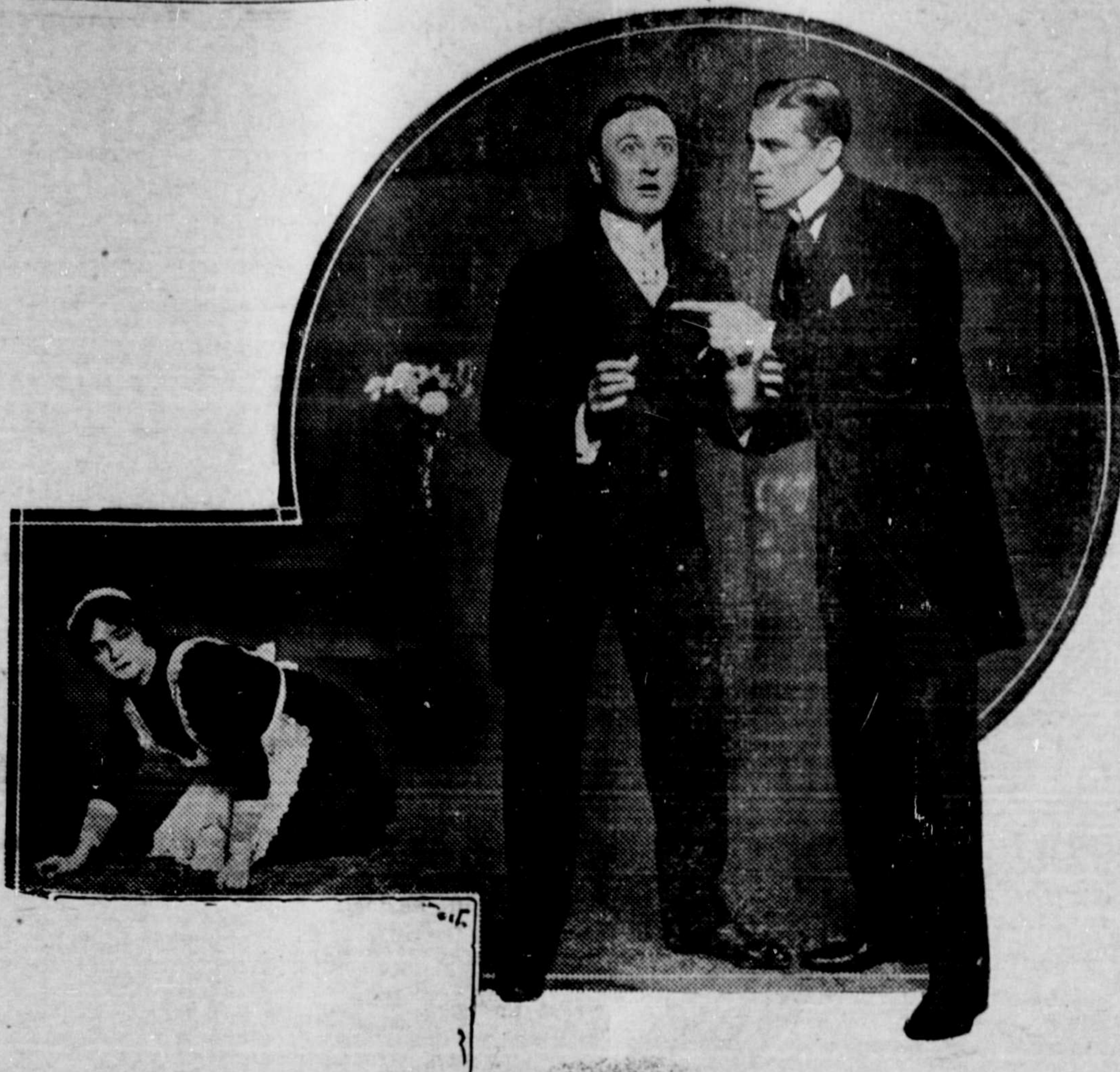
Scene from "The Fortune Hunter" presented at the Empress theatre tonight.

It will be a great day for Northern British Columbia when a Liberal administration is in office.