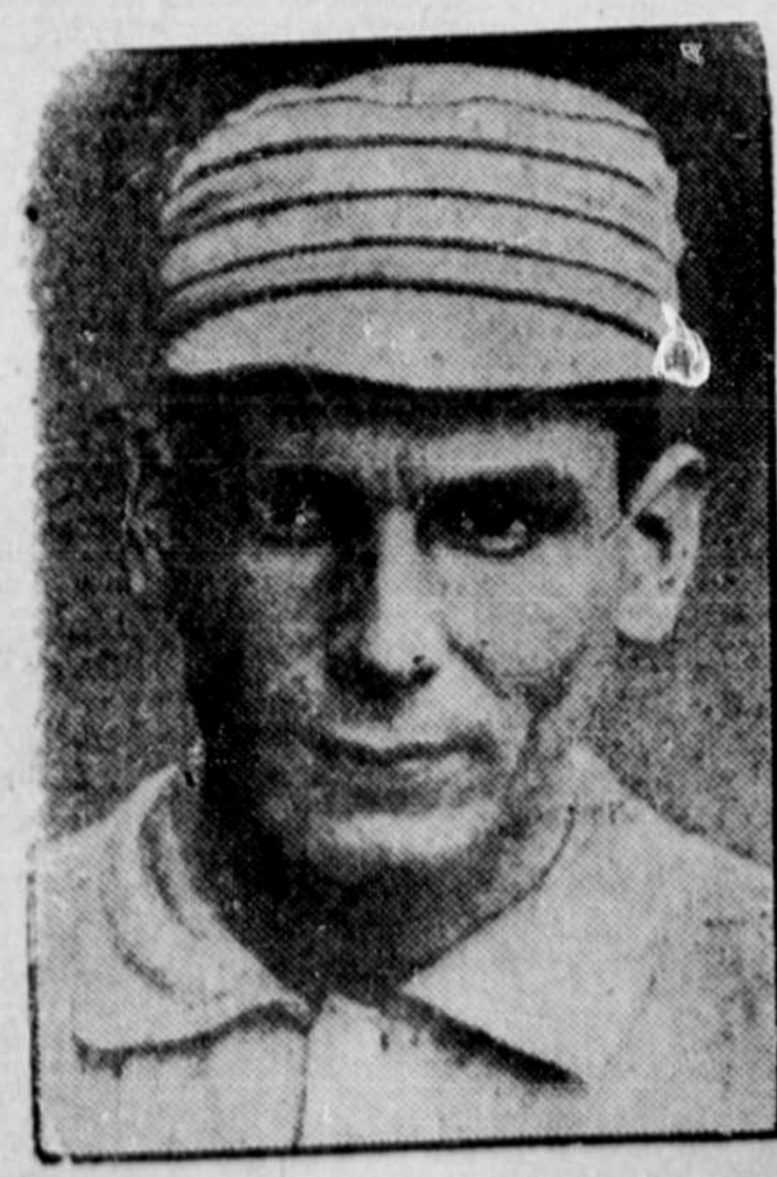
JACK COOMBS Pitcher of the Athletics, who is expected to be able to take his turn in the box shortly after a prolonged absence.

A snap—Lots 1 and 2, block 23, section 5, $4,000.—Estate of C. D. Rand. 116-18