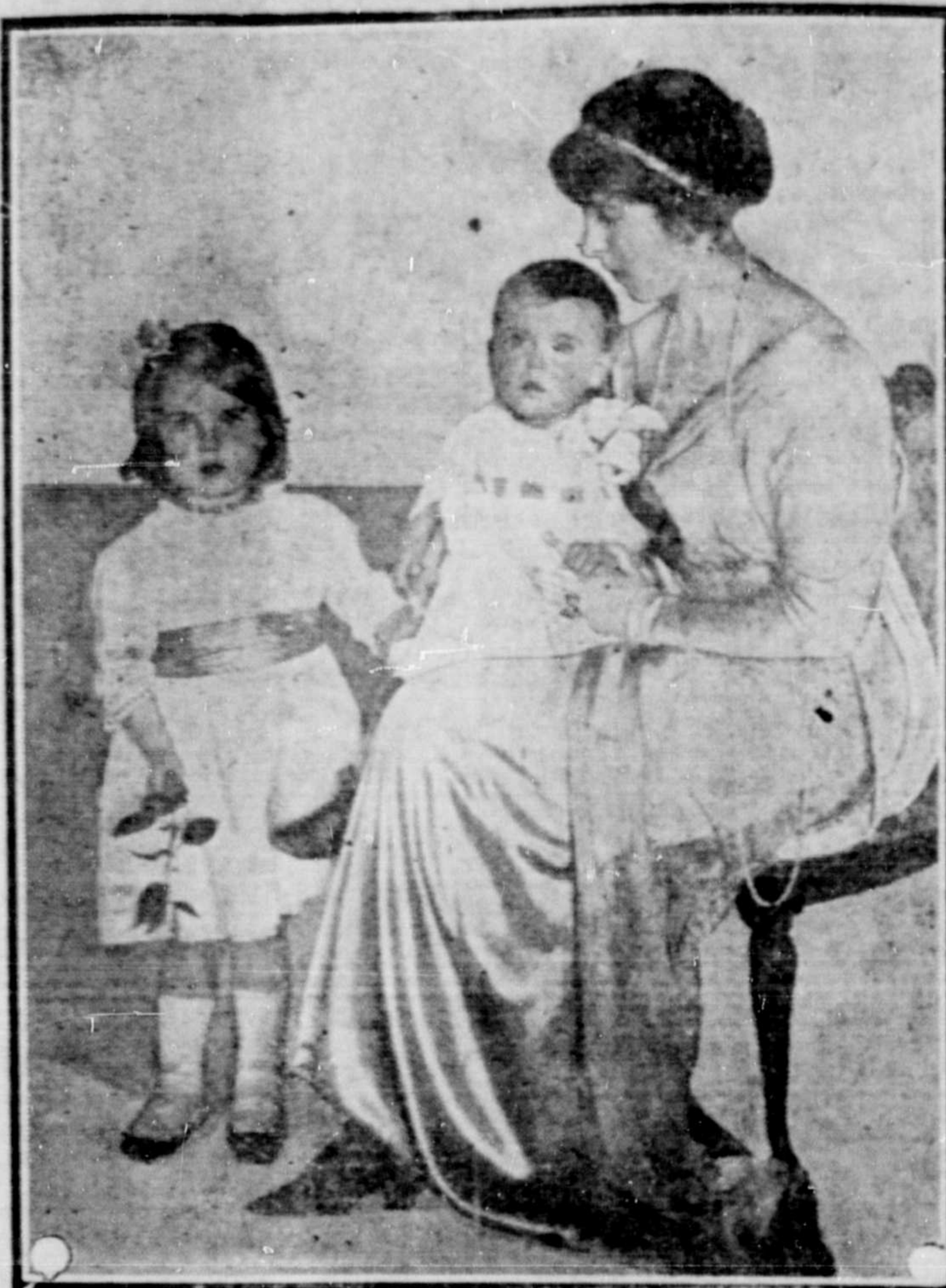
CHILDREN OF CROWN PRINCESS OF SWEDEN

The little girl on the left is Princess Ingrid, daughter of the Crown Prince and Princess of Sweden. Ingrid is just four years old, while her brother Bertil is a little over two years of age. He has, however, had time to become the Duke of Holland, a Chevalier of the Order of the Seraphims. Their mother was Princess Margaret of Connaught before her marriage with Prince Gustavus Adolphus of Sweden.