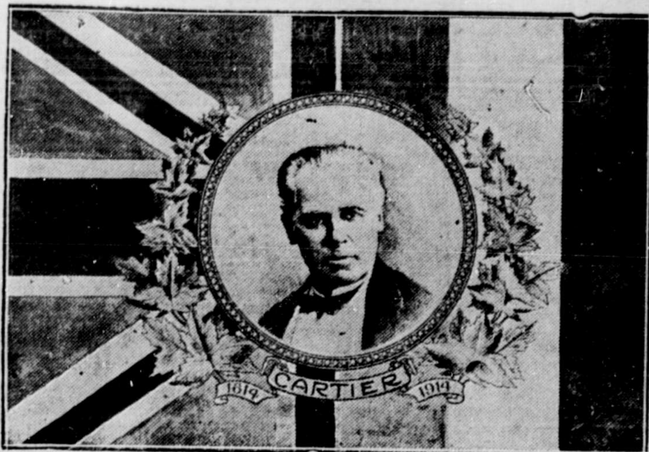
TO CELEBRATE CENTENARY OF SIR ETIENNE CARTIER