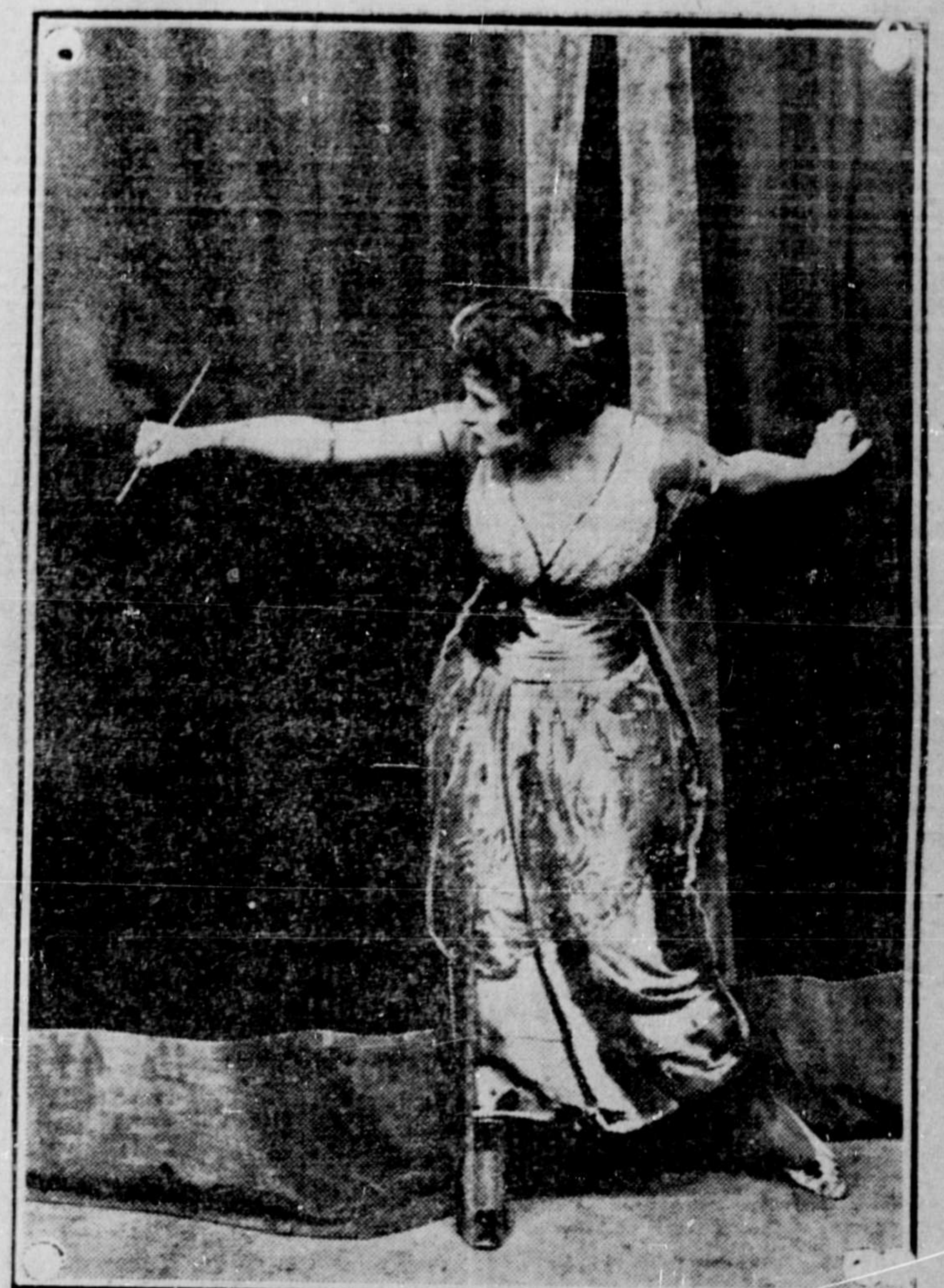
THE MOST EXCITING SCENE ON THE ENGLISH STAGE AT PRESENT

5 roomed modern apartment, on sewer, $35 per month. Ready June 15th.—M. M. Stephens & Co., Ltd. 132-4-6