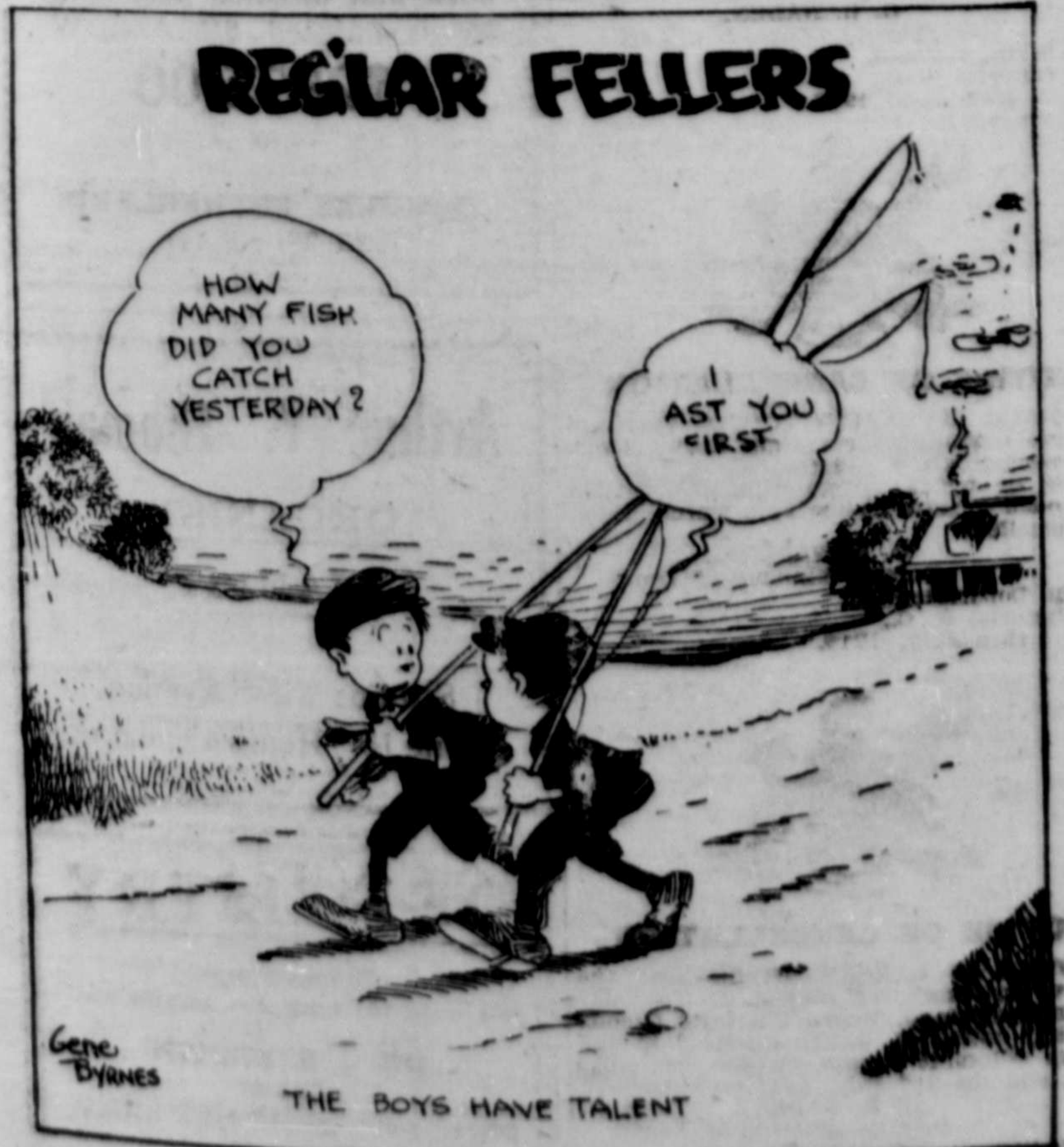
THE BOYS HAVE TALENT

Offered by the Robin Hood Flour Mills, Ltd., for the best bread baked with ROBIN HOOD FLOUR to be shown at the Prince Rupert Exhibition. FIRST PRIZE $10.00, SECOND PRIZE $5.00, THIRD PRIZE $2.50. Each exhibitor must present with entry, grocer's sales slip for one 49-lb. sack Robin Hood Flour, purchased within thirty days of the opening of the Exhibition. For Further Information, Apply Secretary, Exhibition Association.