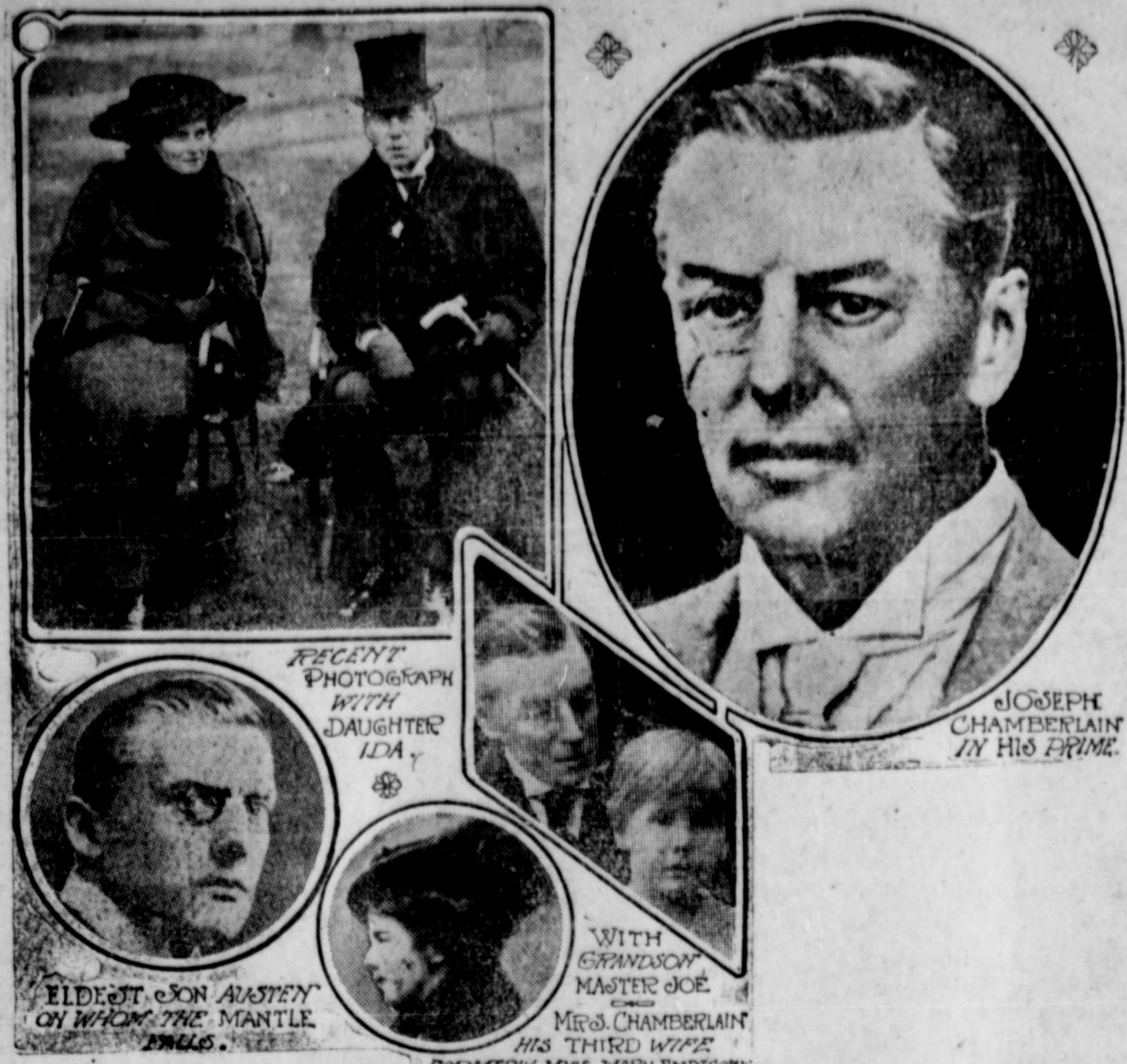
THE LATE MR. JOSEPH CHAMBERLAIN AND HIS FAMILY

Were he at the head of affairs when the free trade question came up the result would have been very different. If there are any citizens of Prince Rupert who do not admire the statesmanship and character of Canada's grand old man—and they must be very few—then for very selfishness sake they should support him and thus allow him to make of Prince Rupert what he has always had mind for it.