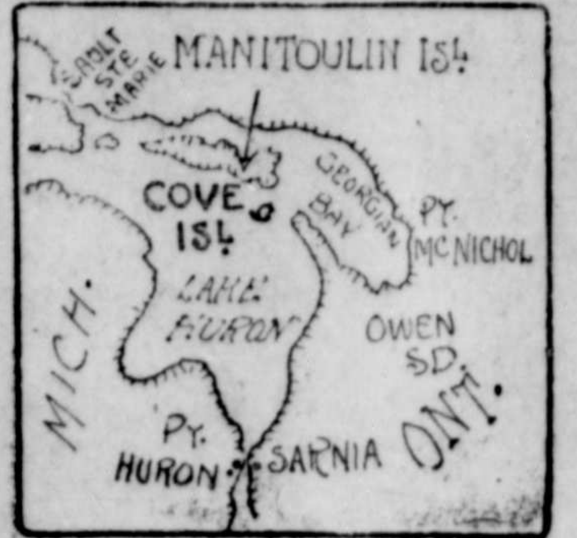
Where the C. P. R. Steamer "Assiniboia" Went Ashore

This seems to me, as an American, absurd. I never heard of it in the States. The Western American and the Western Canadian are so much alike to me that I cannot tell who are Americans and who are Canadians excepting that perhaps the Canadian is a trifle more polite and a trifle more conservative.