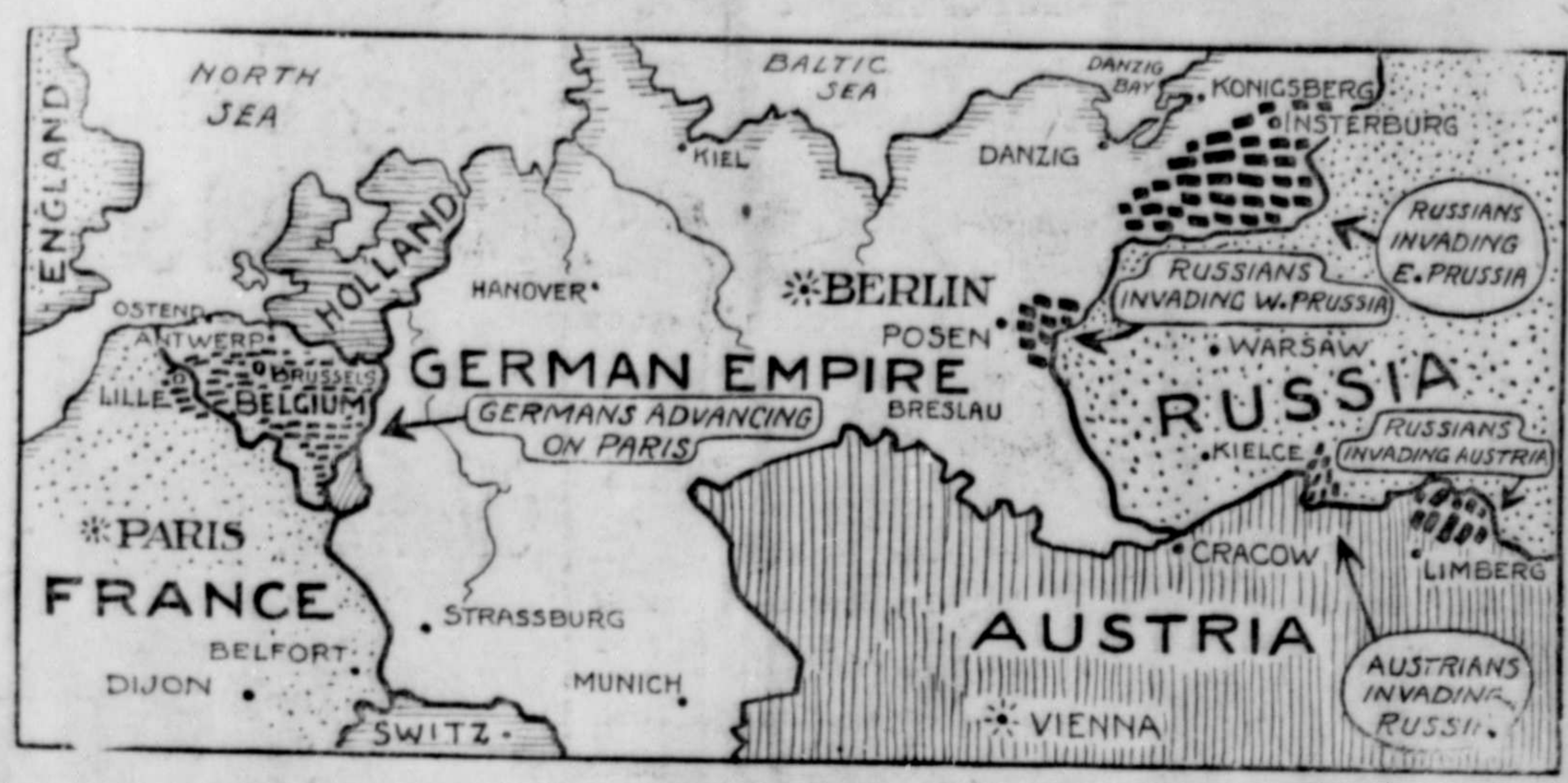
THE WAR SITUATION IN EUROPE.

no chance to recover from the effects of their rush down from the north. The Germans have now withdrawn to about seventy miles northeast of Paris. They are constantly pushed by the British. With Asquith's extra half million men, Britain will soon have an army of one million two hundred thousand. The British forces now on the Continent are believed to number over three hundred thousand at the present time. The French are again invading Alsace.