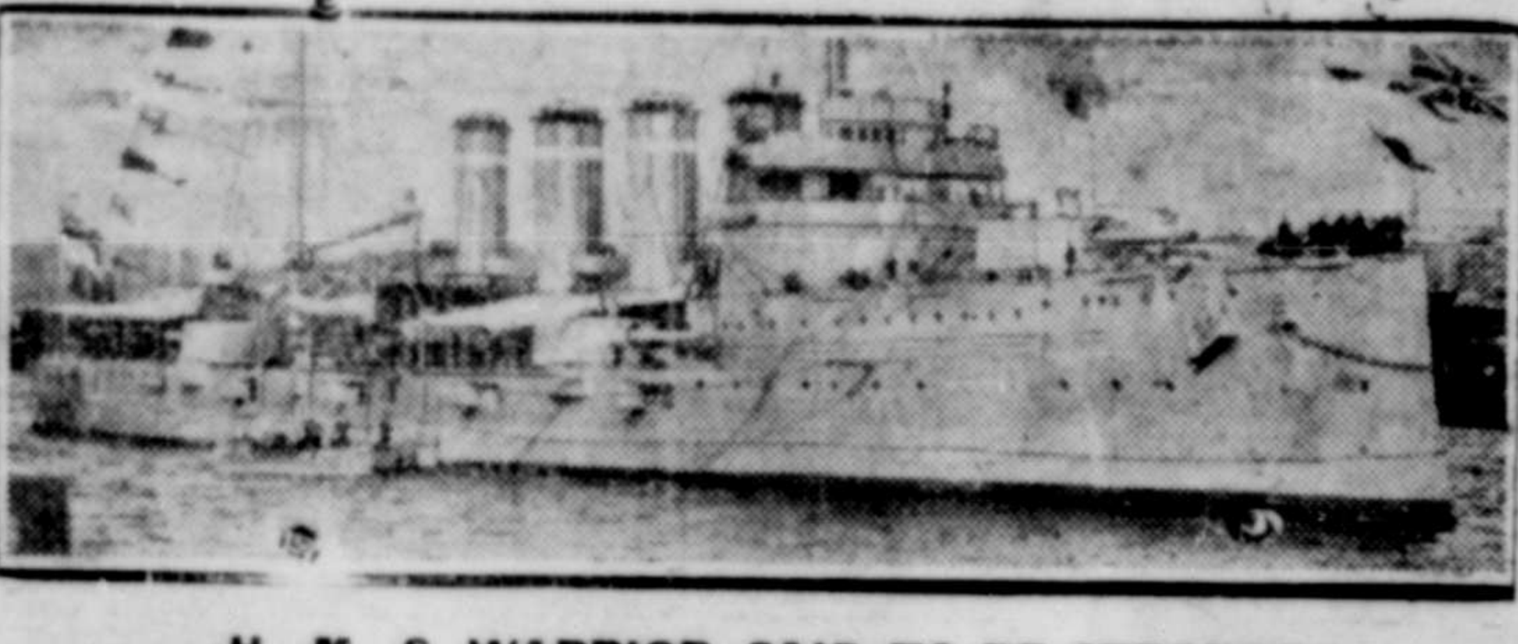
H. M. S. WARRIOR, SAID TO BE STRANDED. At the outbreak of the war this cruiser was with the Mediterranean fleet and may now be in the Adriatic.