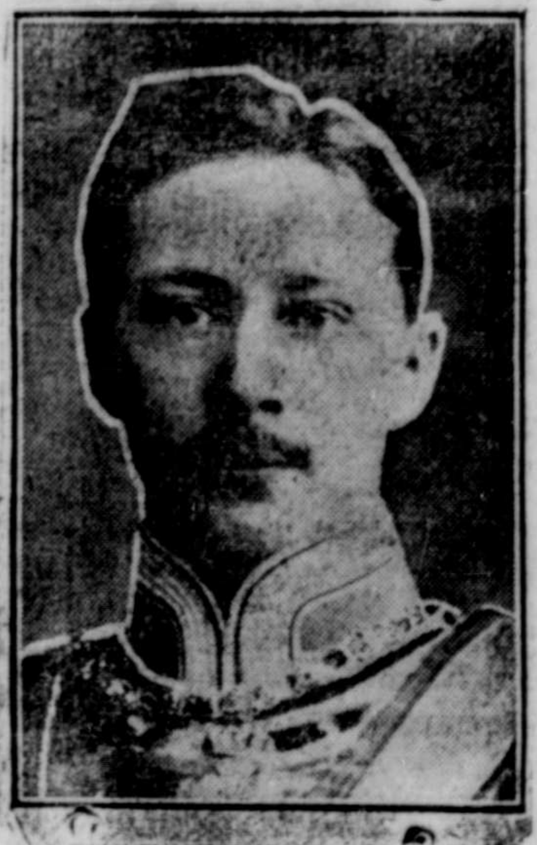
Crown Prince Frederick William. In command of the Imperial Guards, said to have been annihilated.