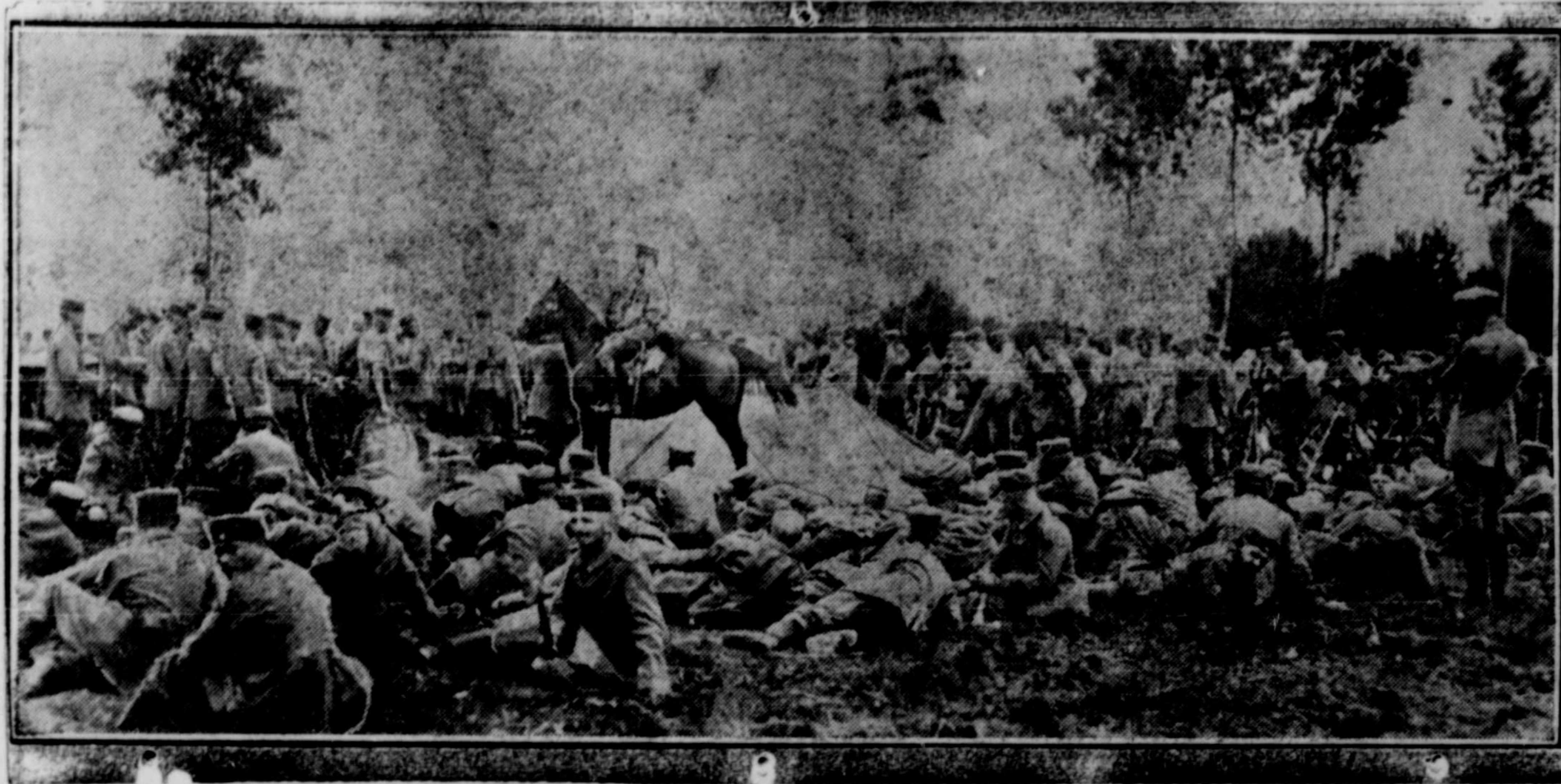
AN ACTUAL WAR PICTURE FROM THE FRONT. The German bivouac after the battle of Vise.