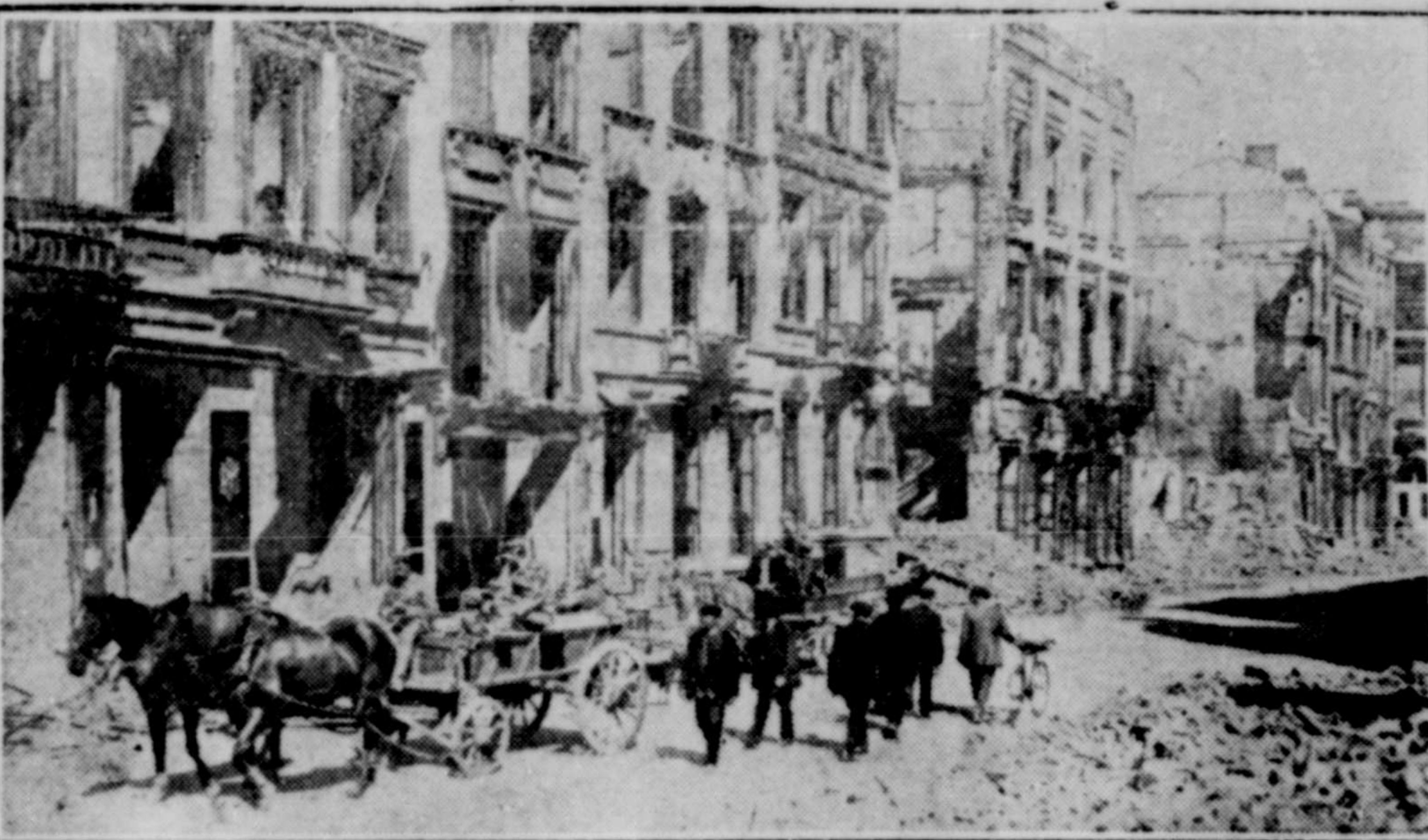
HOW A UNIVERSITY FARES AT GERMAN HANDS—LOUVAIN.

The destruction of the ancient university town of Louvain by the Germans suggests what might have happened to Oxford or Cambridge in the event of a German invasion. The destruction of the "Oxford of Belgium" has raised indignant protests from all parts of the world against such an incredible act of vandalism on the part of a nation which boasts of its "culture."