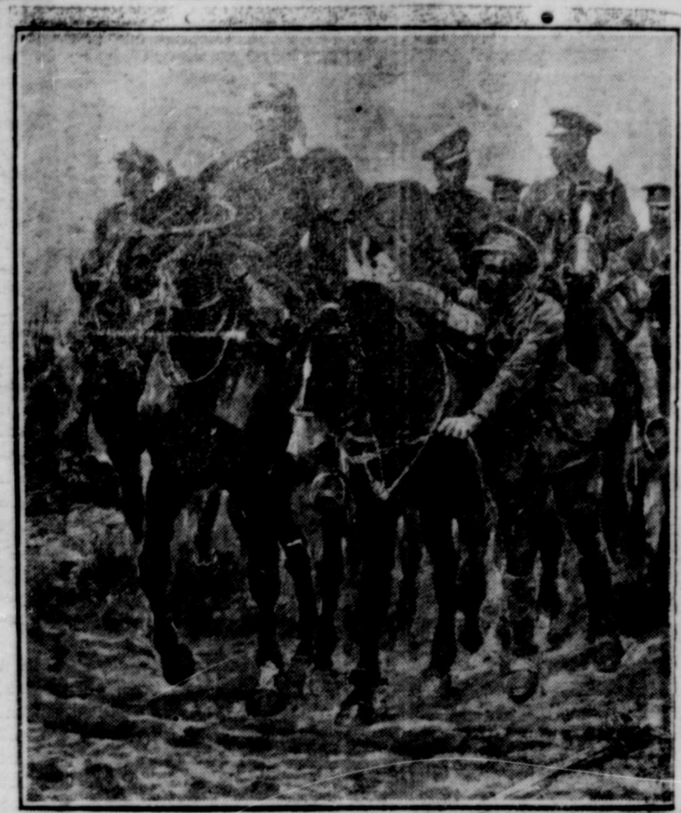
ON BRITAIN'S HONOR ROLL: THE RETURN FROM THE CHARGE

(Special to The Daily News.) Rotterdam, Oct. 20.—The latest lists of casualties published by the German papers bear out the French and British claims that they wiped out whole battalions of Germans. The German reservist infantry regiment No. 17 lost in one battalion 800 men. Another battalion of the same regiment lost 740 killed at the Battle of the Marne.