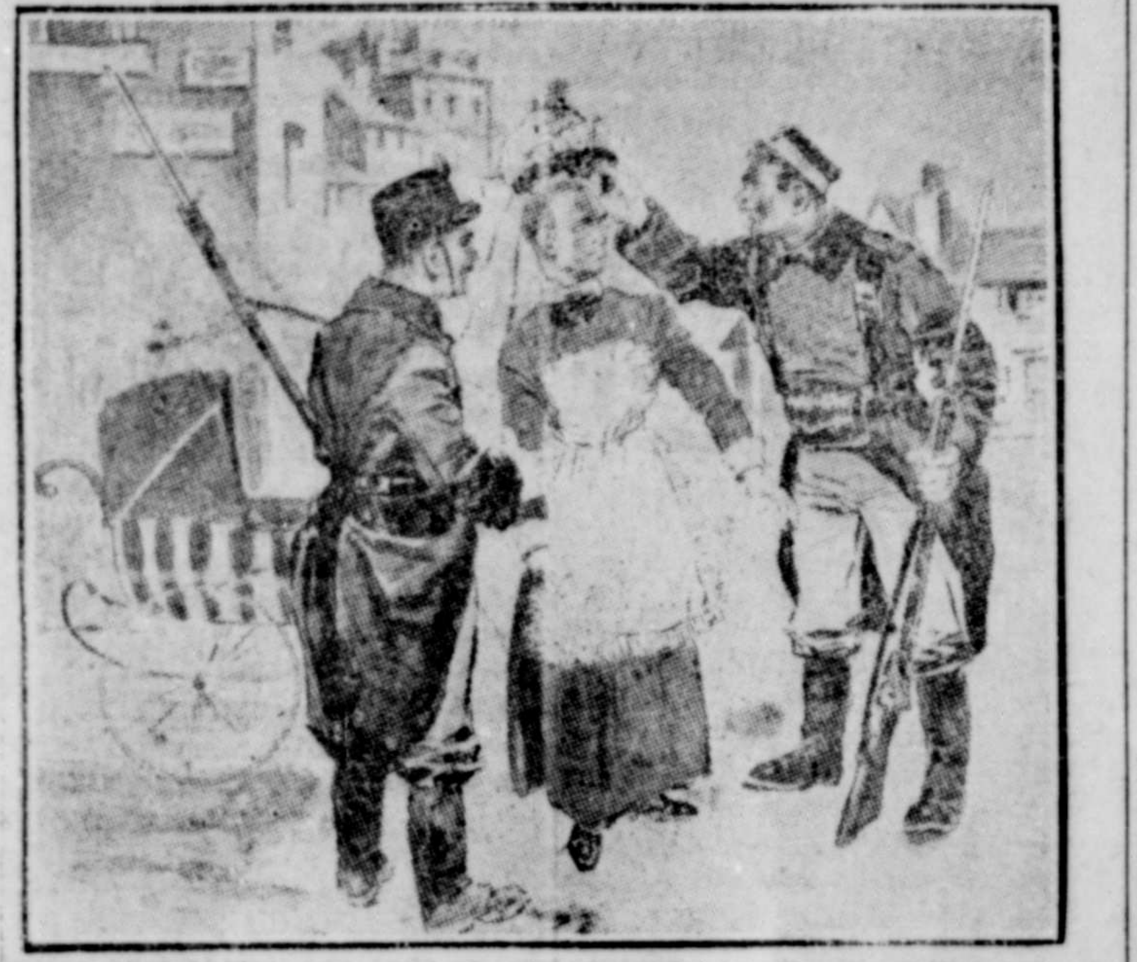
THE NURSEMAID. A Favorite Disguise for German Spies.