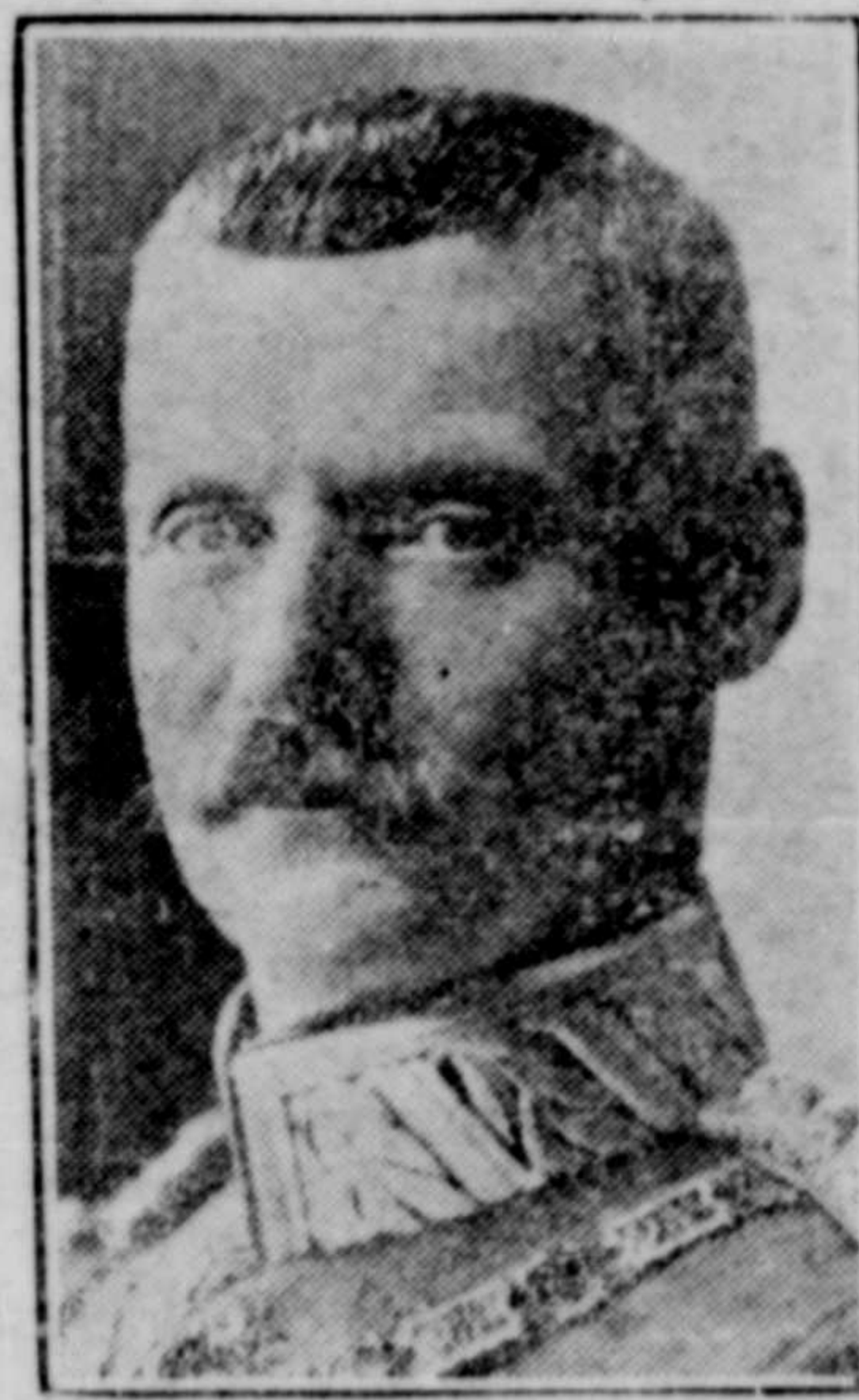
CROWN PRINCE RUPPRECHT OF BAVARIA.