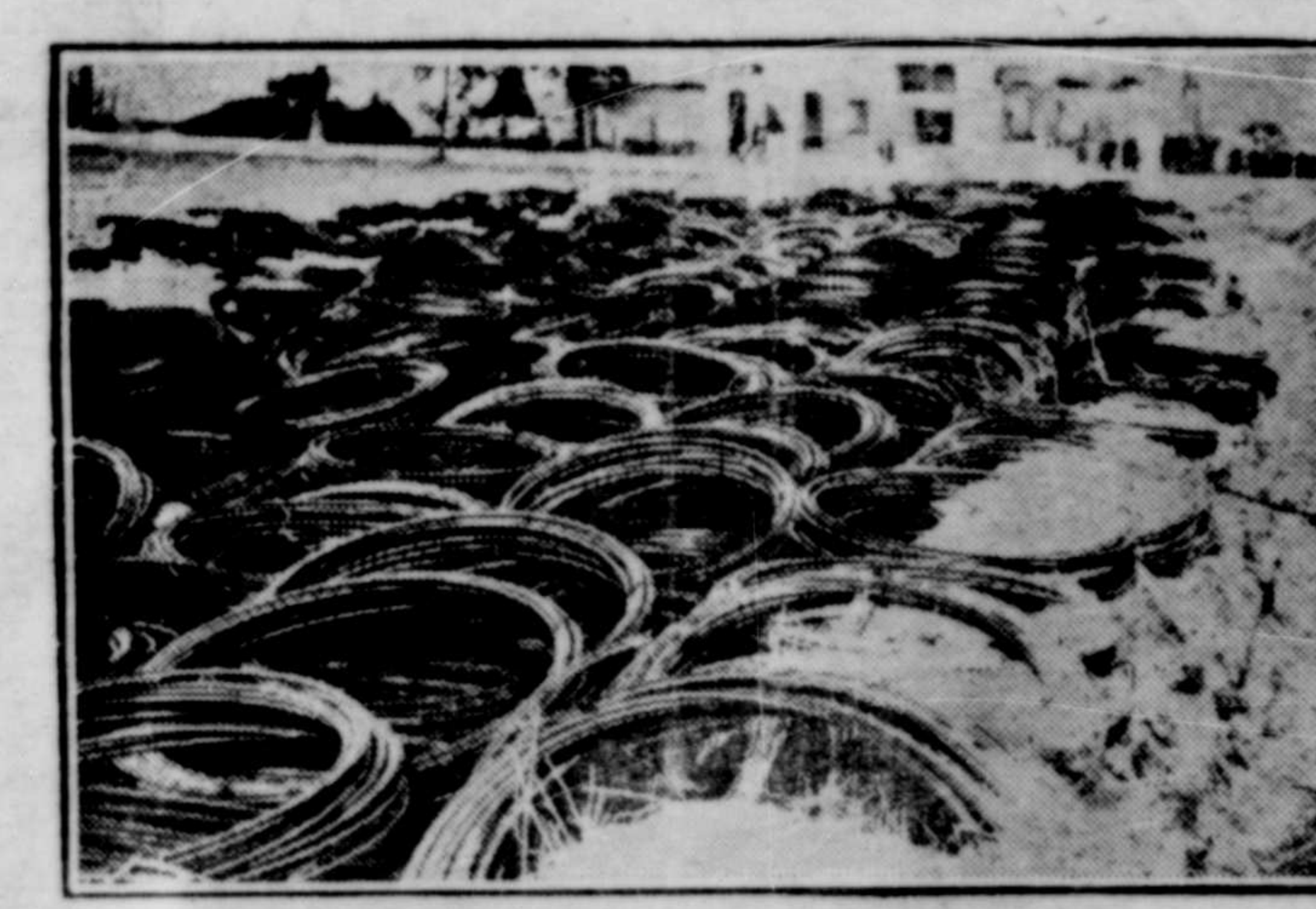
PROTECTION FOR GERMAN TRENCHES The Germans have found a new plan for the protection of their soldiers in the trenches. Coils of wire are placed before the trenches and when a shell falls they prevent the fragments from spreading to the trenches.