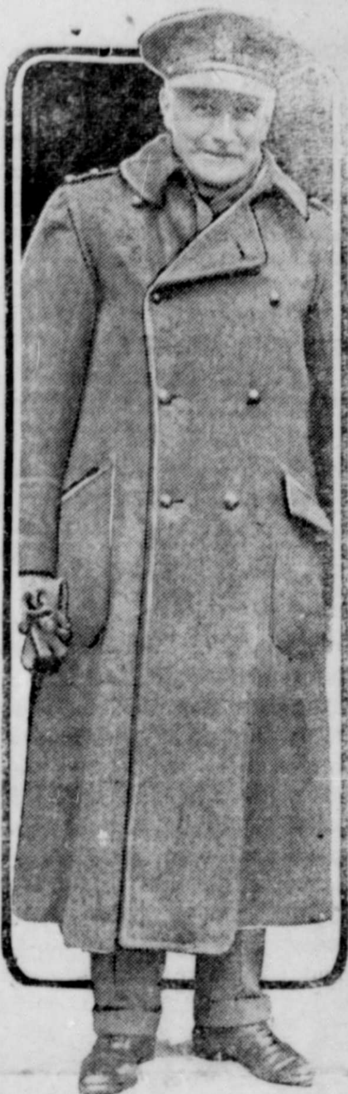
BISHOP OF LONDON PREACHES TO CANADIANS IN TRENCHES.

We will clear your lot and pre- pare your ground at a very rea- sonable price. Fritz. Phone 583. 95-97