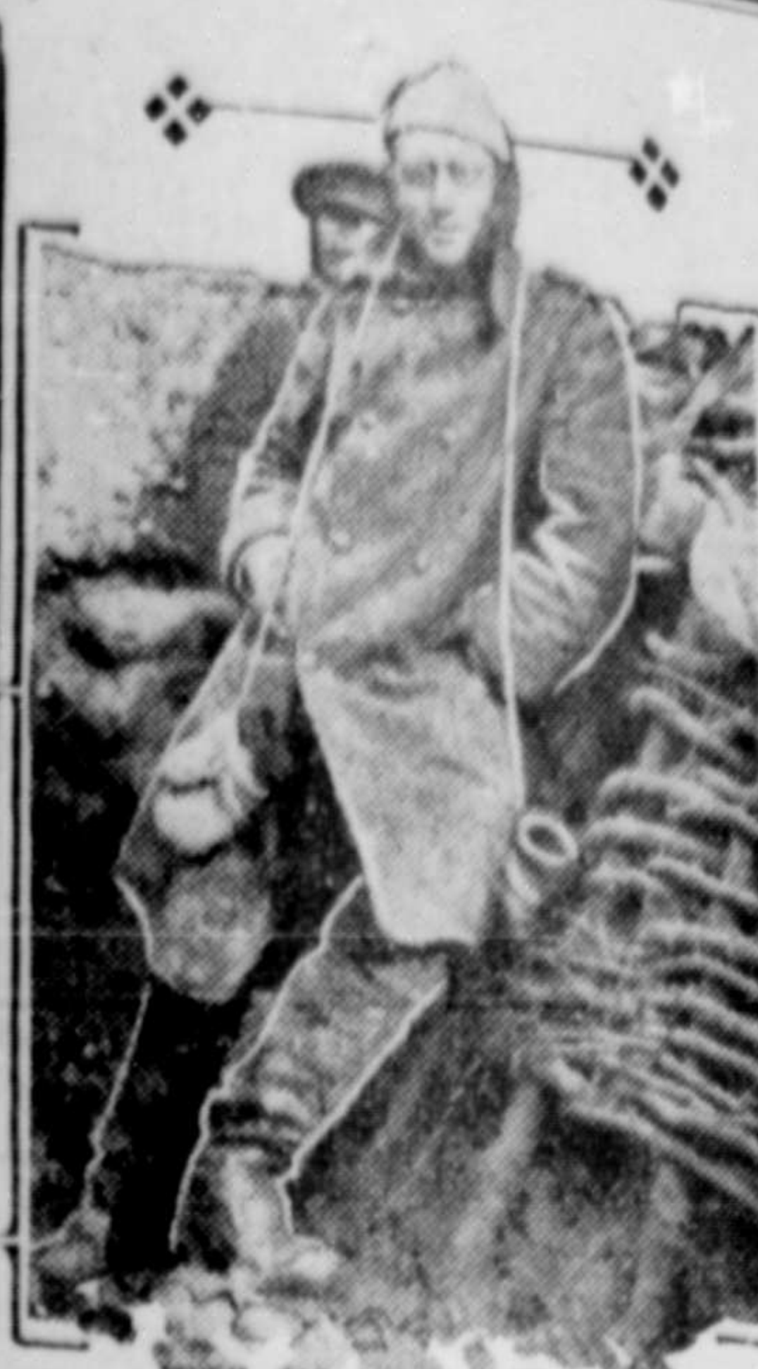
HOW THE CANADIAN SOLDIERS APPEAR IN THE TRENCHES—Some pictures taken in the Canadian trenches in France near where the Langemark battle was fought.