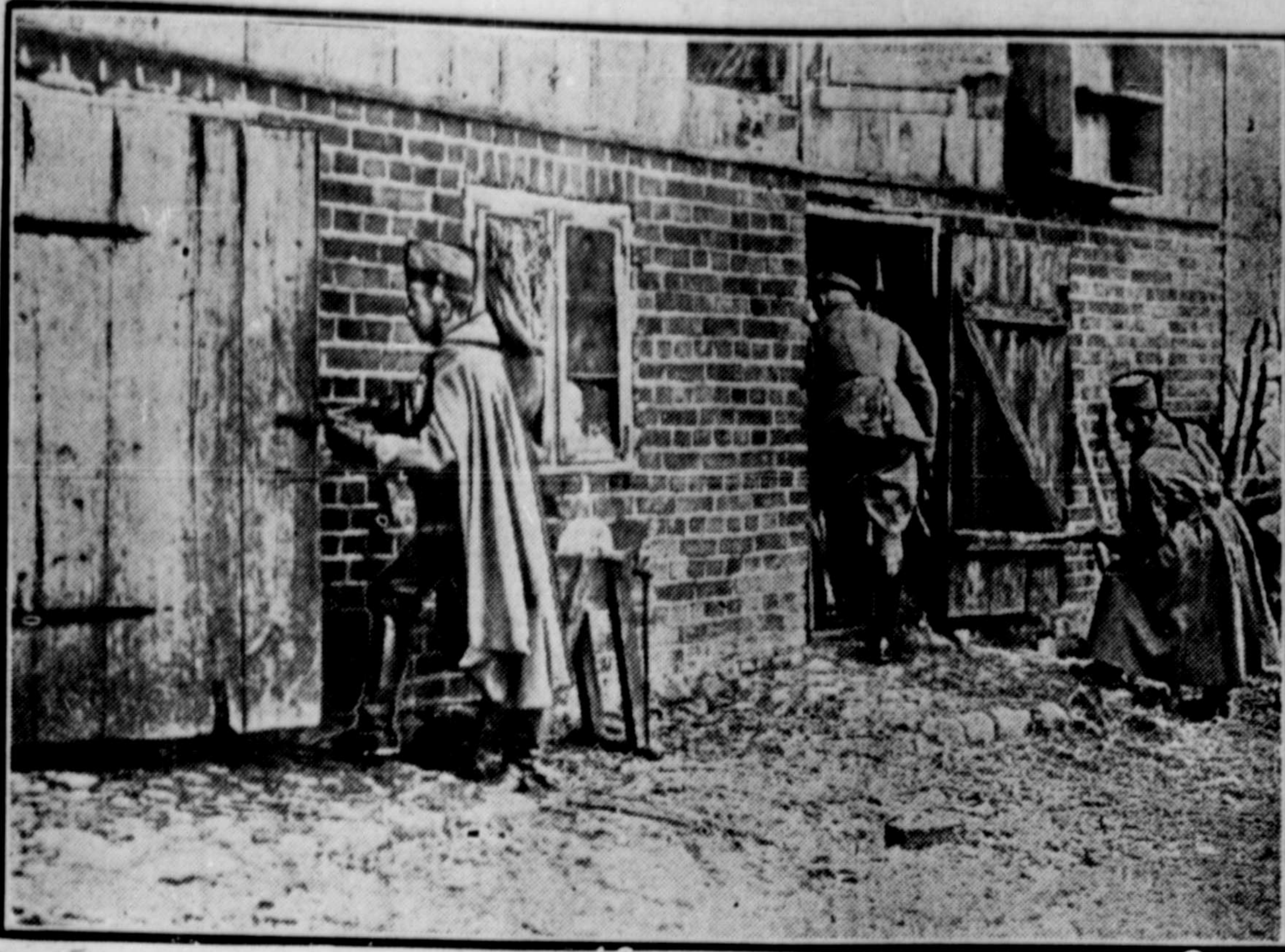
GERMAN HUSSARS SEARCHING A RUSSIAN PEASANT'S SHOP FOR HIDDEN RUSSIANS.