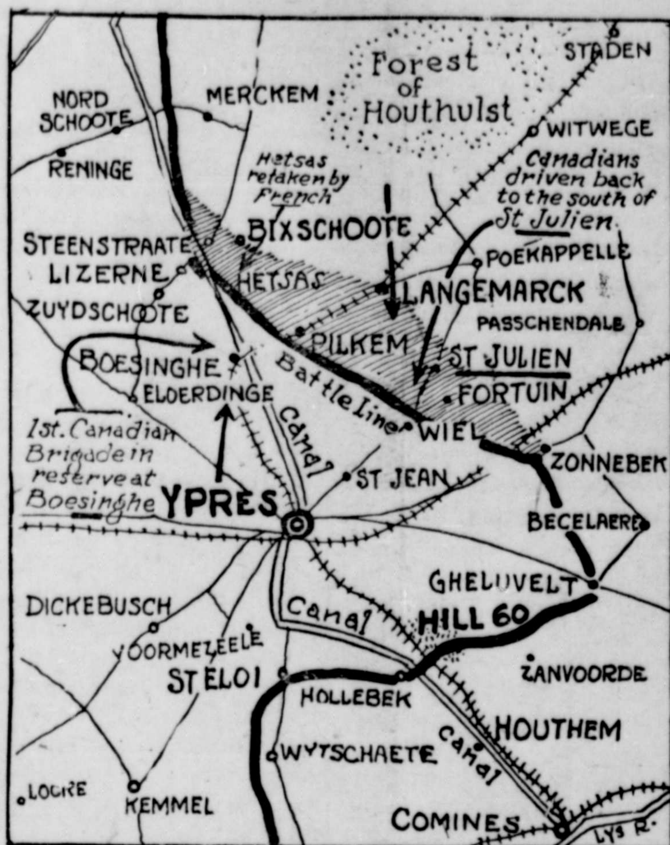
SHADED PORTION INDICATES GERMAN GAIN. SCALE OF MILES THE STUBBORN BATTLE FOR YPRES. Hetsas and Lizerne were recently recaptured after the Langemark defeat by the Allies. The battle line shows Ypres is now being attacked from three angles.