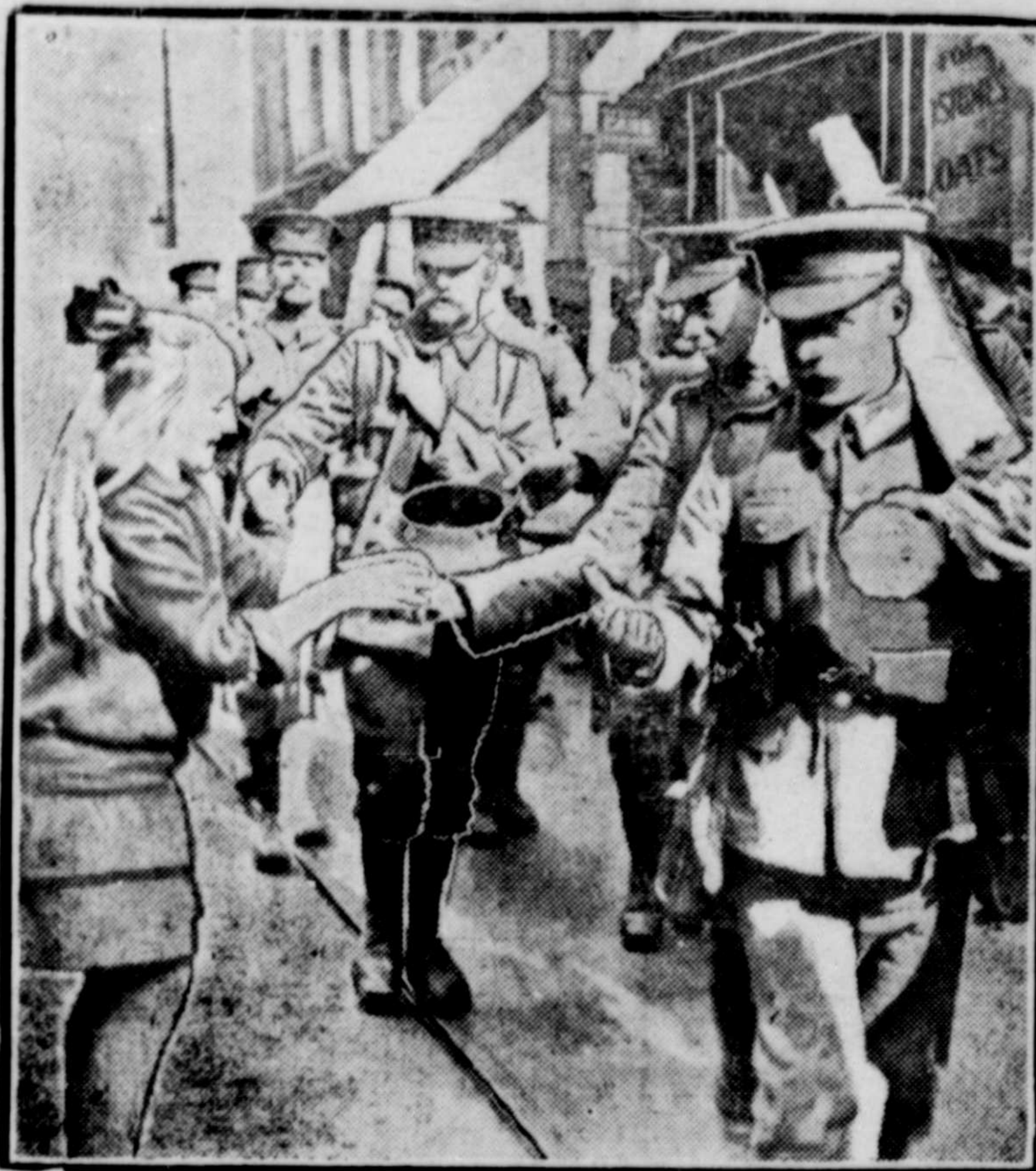
MORE OF KITCHENER'S ARMY OFF FOR THE FRONT.

Genuine Wellington Coal lasts longer. It's the best. P. R. Coal Co. Phone 15. 112-14