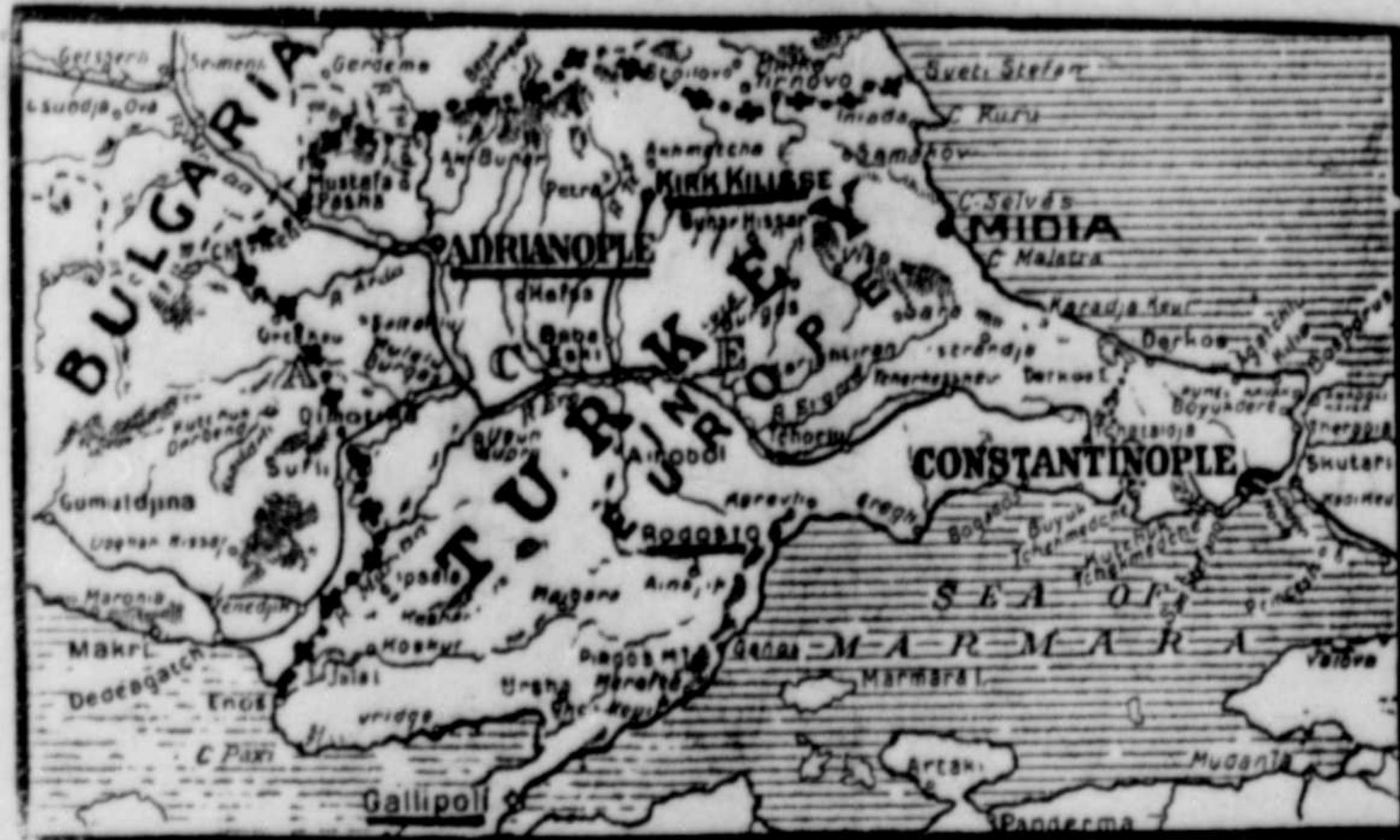
THE CONSTANTINOPLE SITUATION.

Developments here are such that Turkish reinforcements urgently needed on the Peninsula of Gallipoli are being recalled and sent to Midia and Kirk Killisser to resist invasion from that point. Troops are also being rushed north from Adrianople.