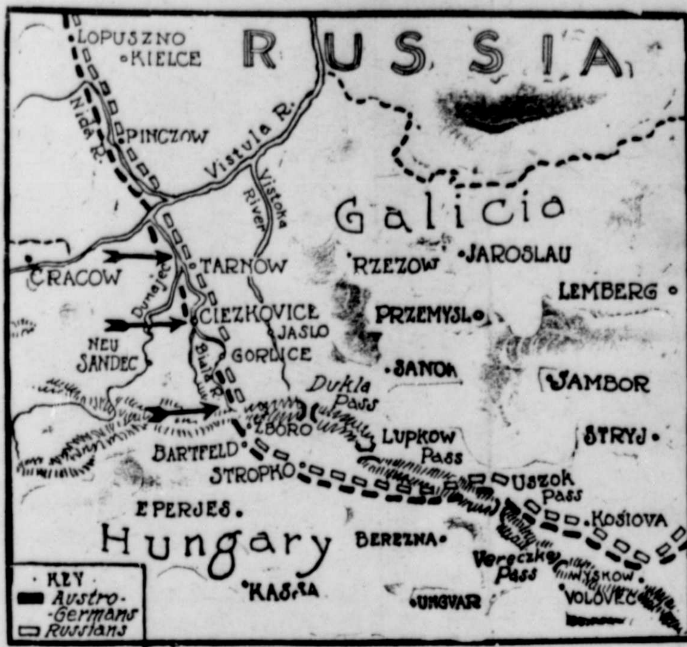
SITUATION IN WESTERN GALICIA.

total captures at Carency were over 2,000. French Aviators Busy. Amsterdam, May 17.—French aviators destroyed a chemical factory at Launethal, near Danzig, causing a loss of $75,000, and also destroyed seven sheds at Koenigsburg. Tanneries worth $2,000,000 were also destroyed at Strassburg. German Air Raid. London, May 17.—A German air raid on Ramsgate caused the death of one woman. Angle guns protected Dover. Zeppelins dropped incendiary bombs on Deal and Margate, with no damage reported, and five more were sighted north of Freeland.