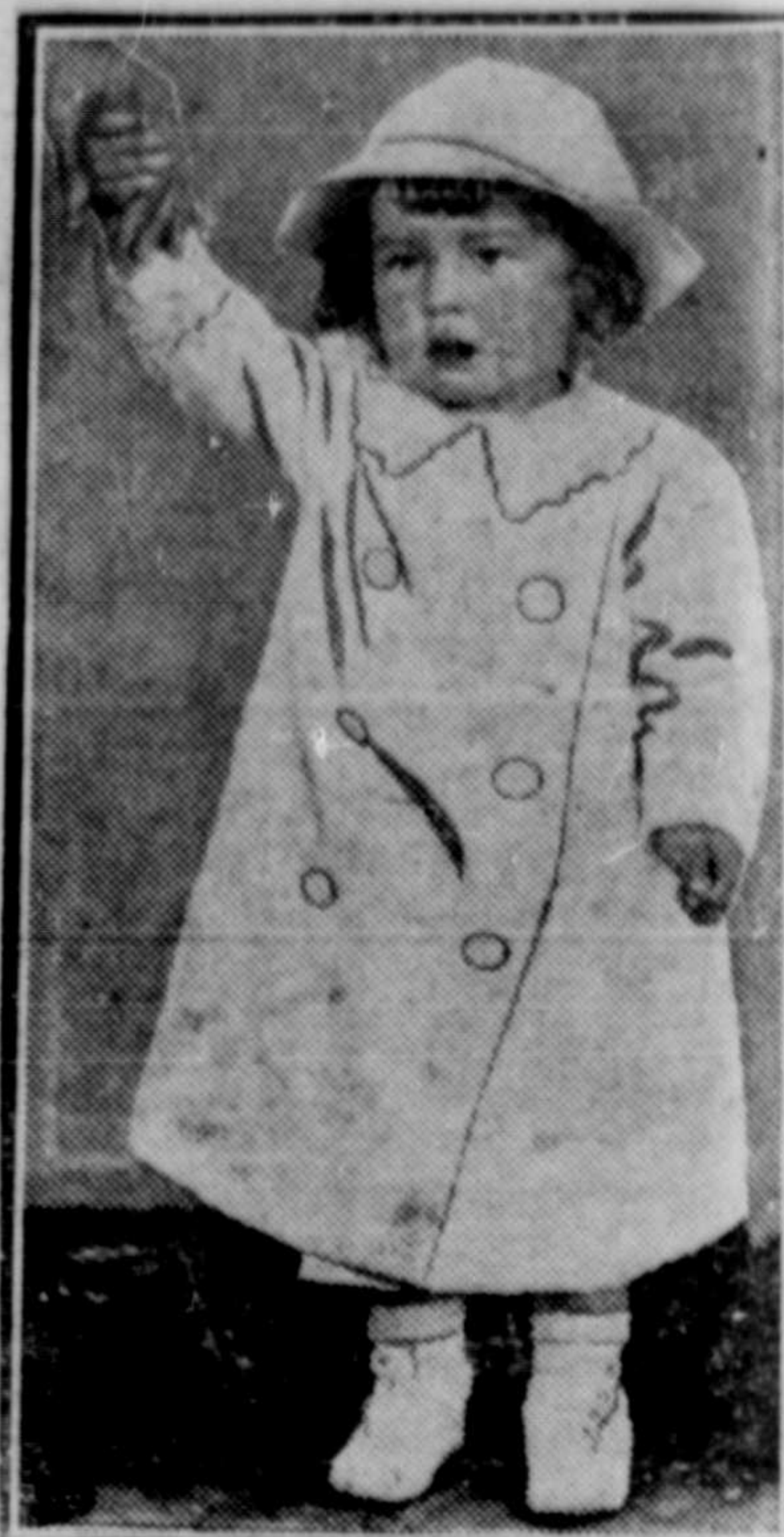
ALFRED VANDERBILT, JR.

"The Premier will return to Ottawa at the end of the week and Hon. Robt Rogers, who has been in Winnipeg, is also expected back in a few days."