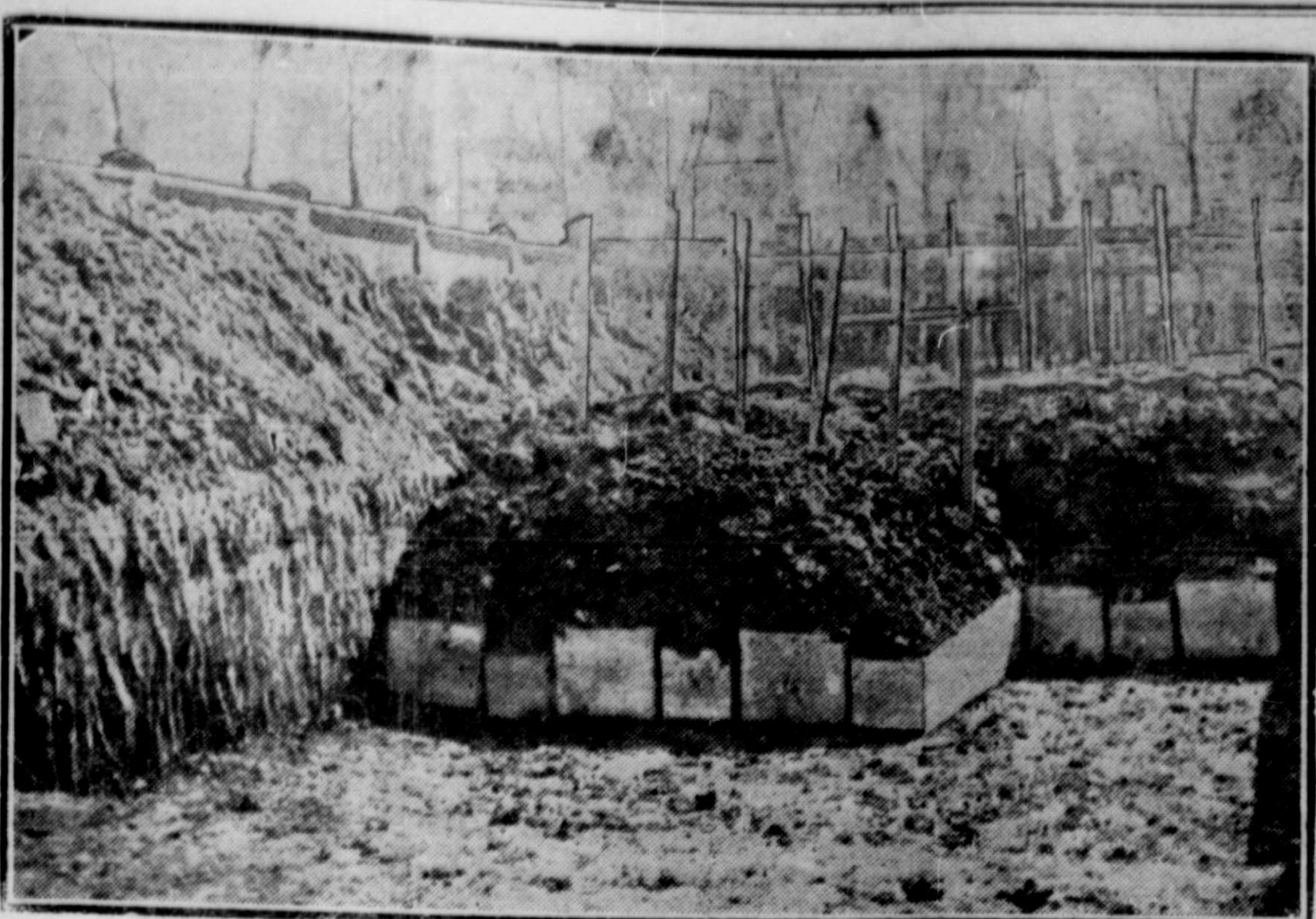
THE PRICE OF NEUVE CHAPELLE. A corner of Nille cemetery, showing the graves of British soldiers who lost their lives during the now famous battle.