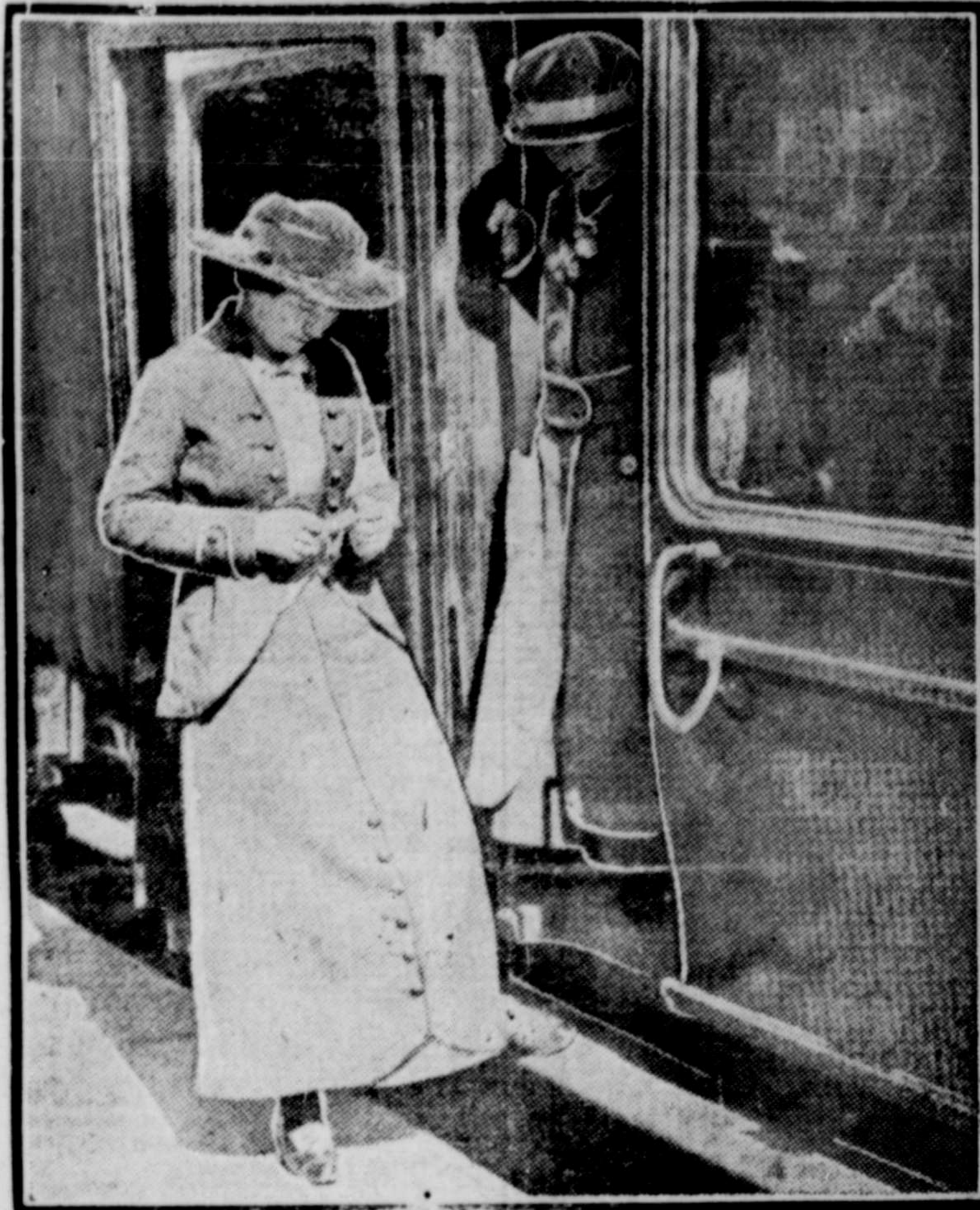
WOMAN TICKET COLECTOR IN ENGLAND.

SKIMMED MILK 5c per quart. BUTTERMILK 10c per quart, two quarts for 15 c. Delivered to any part of the city—Prince Rupert Dairy—Phone Green 252 ft.