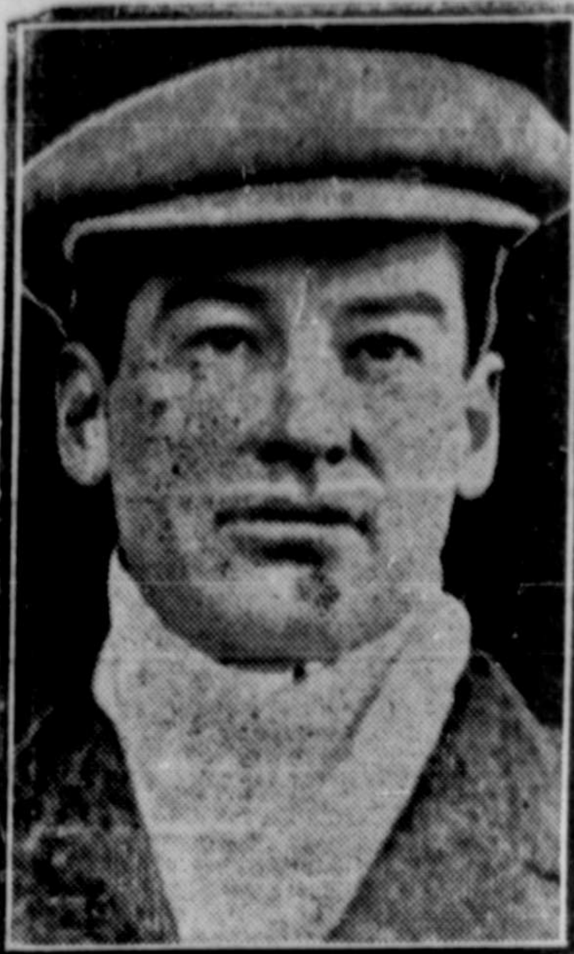
A. G. VANDERBILT,