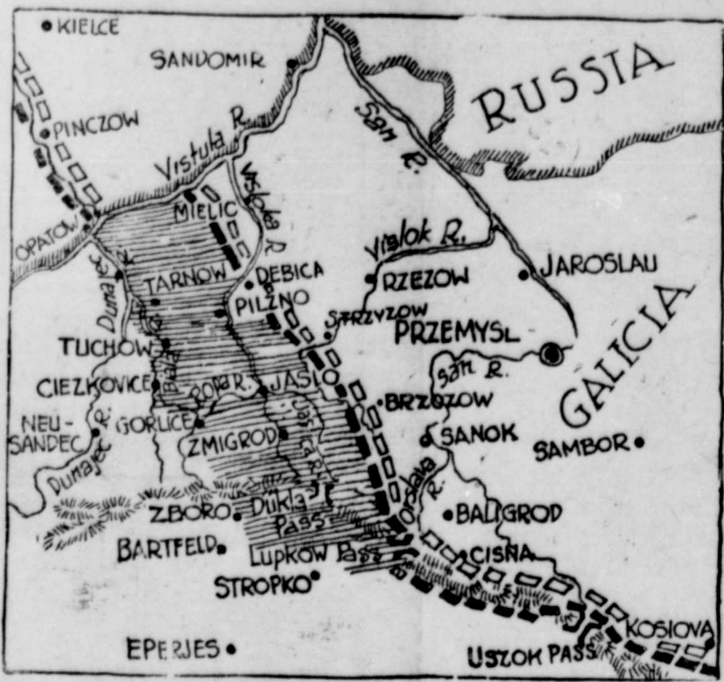
THE ENEMY'S PROGRESS IN GALICIA IS CHECKED.

her class of battleship. She was, however, built a long time ago, in 1895. She was of 14,900 tons displacement, with 12,000 horsepower. Her armament consisted of four 12-inch guns, twelve 6-inch, eighteen 12-pounders, six 3-pounders and machine guns and five torpedo tubes. More Villainy. London, May 28.—The steamer Cadeby, of 677 tons, has been sunk by gunfire off the Scilly Isles. The crew was saved. The Danish steamer Ely struck a mine and sank off Stockholm, her crew being saved.