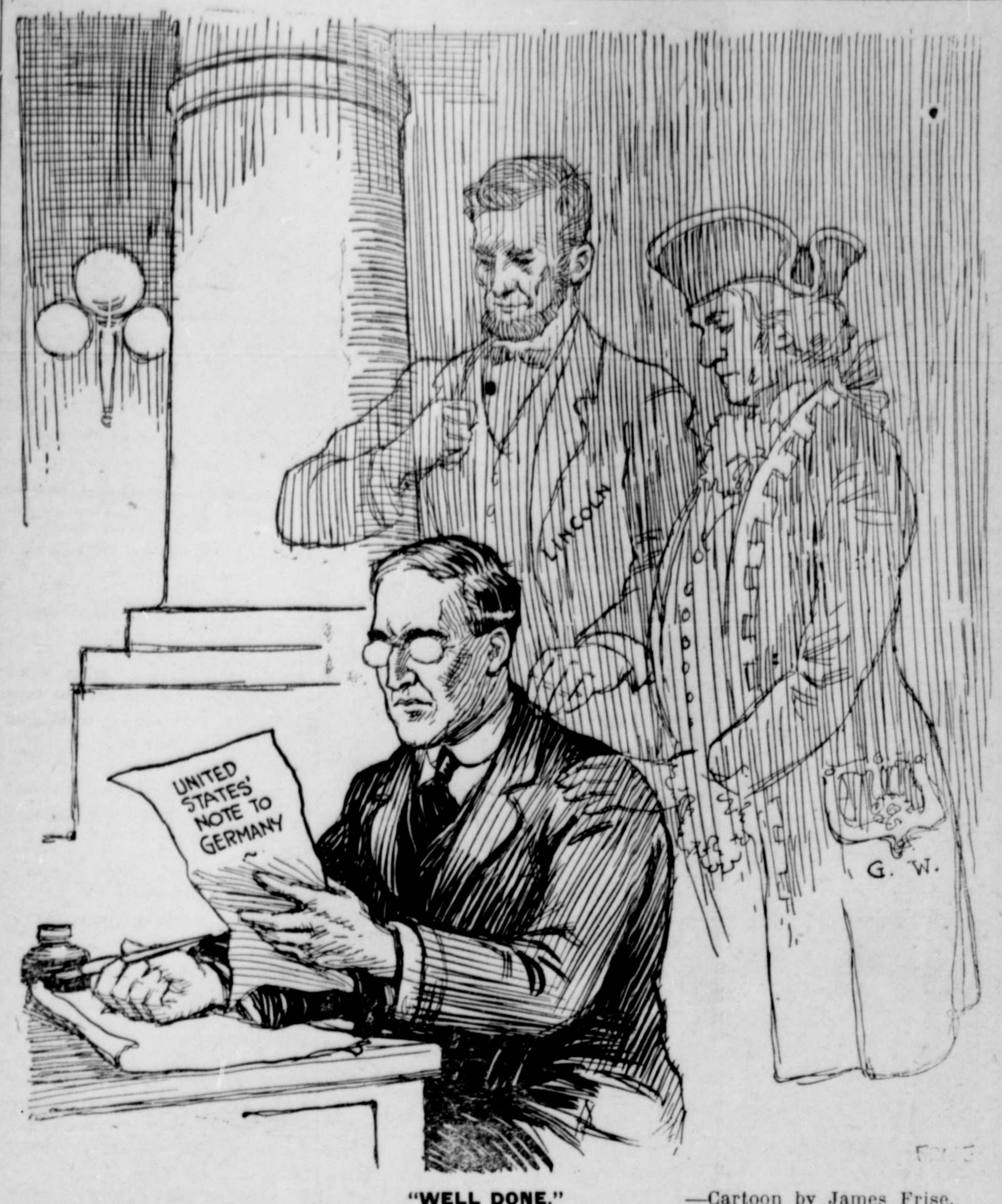
"WELL DONE."